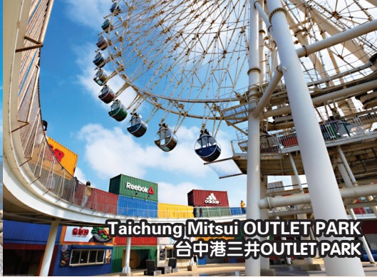
Taichung Mitsui OUTLET PARK 台中港三井OUTLET PARK