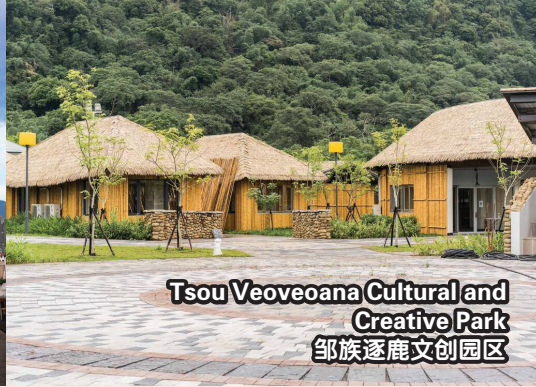
Tsou Veoveoana Cultural and Creative Park 邹族逐鹿文创园区