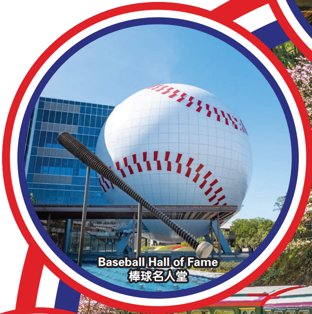
Baseball Hall of Fame 棒球名人堂