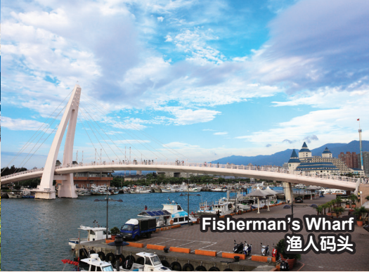
Fisherman's Wharf 渔人码头