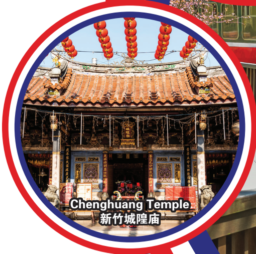
Chenghuang Temple 新竹城隍庙

行程次序，以当地旅社安排为准。 Sequences of Itinerary are subject to local arrangement.