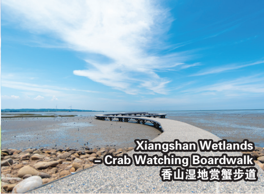
Xiangshan Wetlands - Crab Watching Boardwalk 香山湿地赏蟹步道