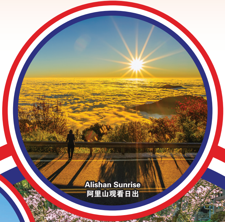
Alishan Sunrise 阿里山观看日出