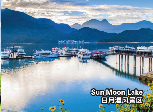
Sun Moon Lake 日月潭风景区