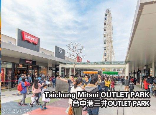
Taichung Mitsui OUTLET PARK 台中港三井OUTLET PARK