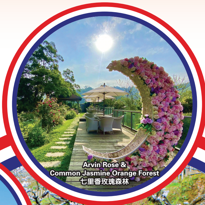
Arvin Rose & Common Jasmine Orange Forest 七里香玫瑰森林