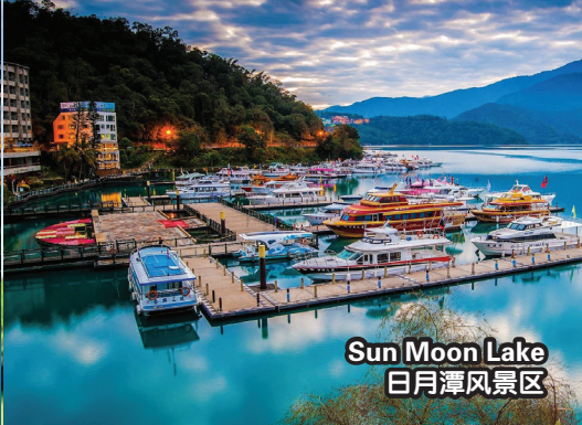
Sun Moon Lake 日月潭风景区