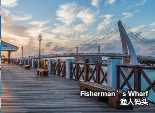
Fisherman's Wharf 渔人码头