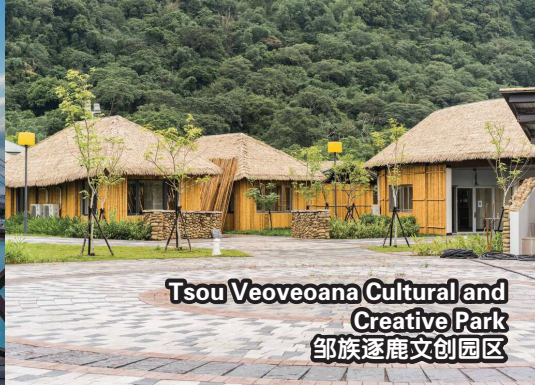
Tsou Veoveoana Cultural and Creative Park 邹族逐鹿文创园区