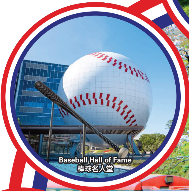
Baseball Hall of Fame 棒球名人堂