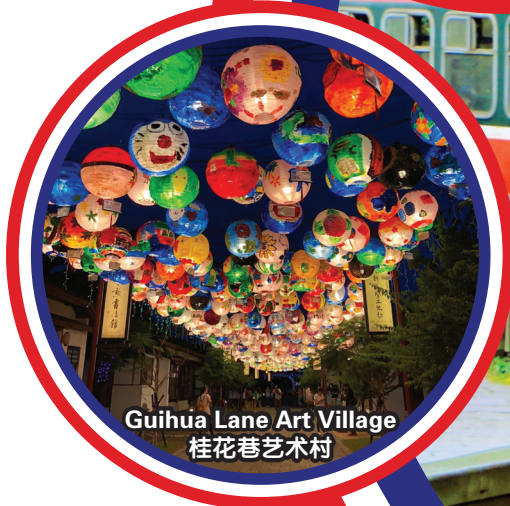
Guihua Lane Art Village 桂花巷艺术村