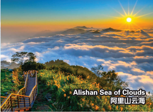
Alishan Sea of Clouds 阿里山云海