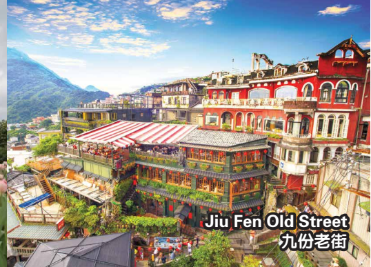
Jiu Fen Old Street 九份老街