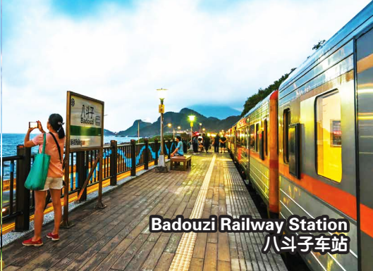
Badouzi Railway Station 八斗子车站