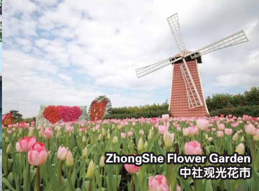
ZhongShe Flower Garden 中社观光花市