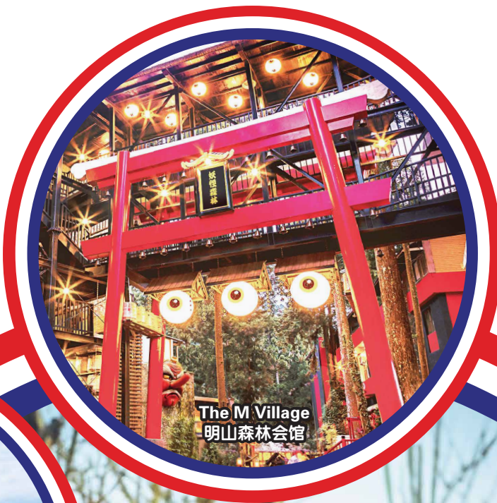
The M Village 明山森林会馆