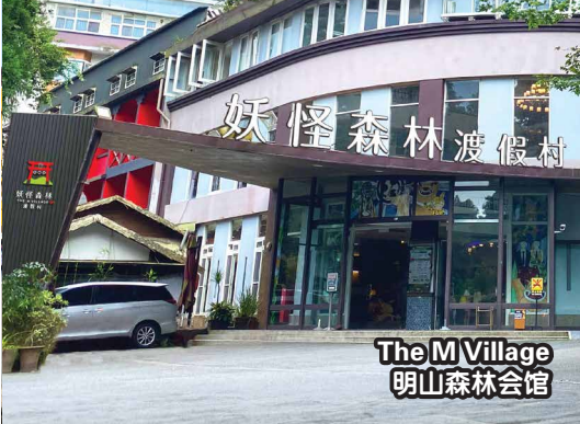
The M Village 明山森林会馆