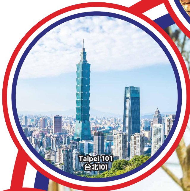
Taipei 101 台北101