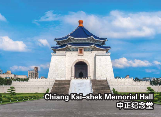
Chiang Kai-shek Memorial Hall 中正纪念堂