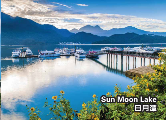
Sun Moon Lake 日月潭