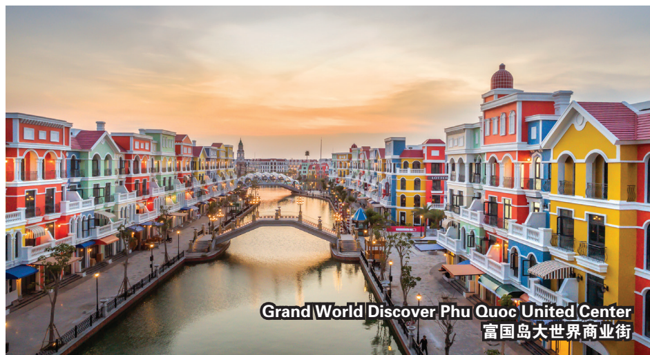
Grand World Discover Phu Quoc United Center 富国岛大世界商业街

✓ Wyndham Garden Grandworld Phu Quoc x3 Nights