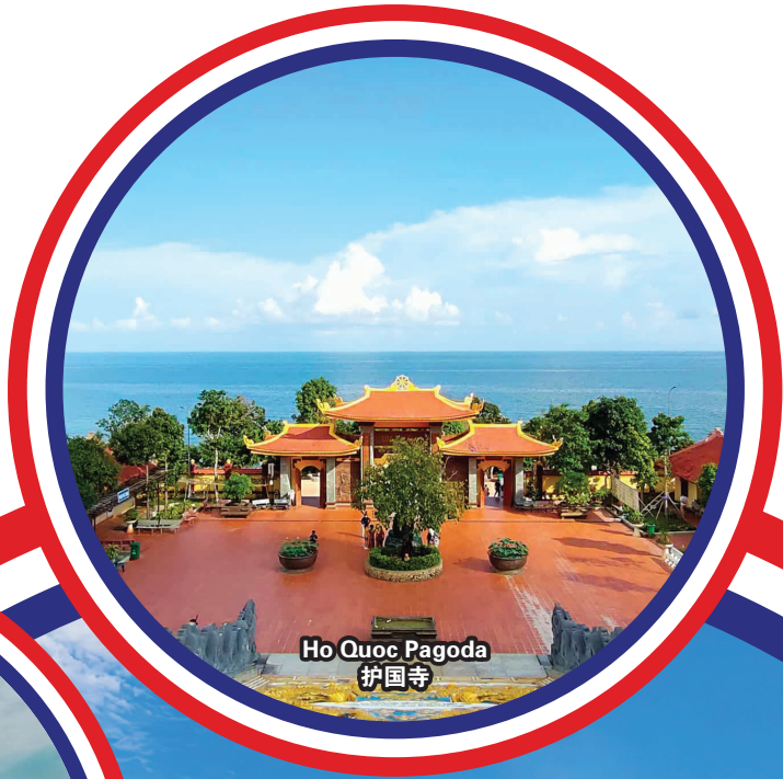
Ho Quoc Pagoda 护国寺