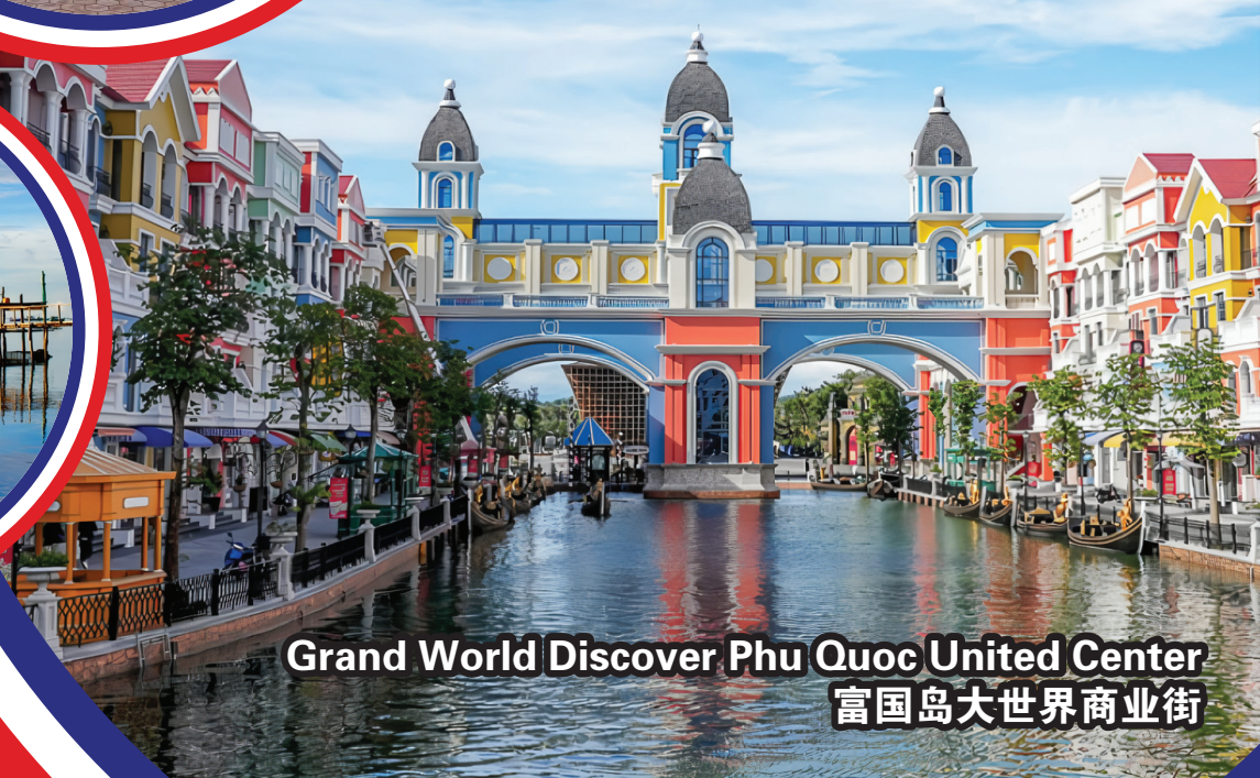
Grand World Discover Phu Quoc United Center 富国岛大世界商业街

行程次序，以当地旅社安排为准。 Sequences of Itinerary are subject to local arrangement.