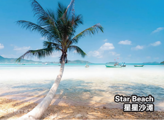
Star Beach 星星沙滩