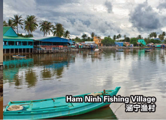
Ham Ninh Fishing Village 涵宁渔村