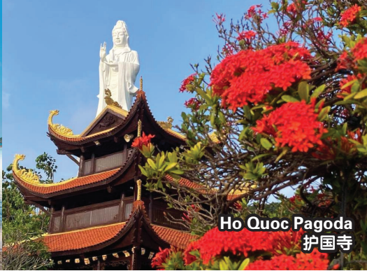
Ho Quoc Pagoda 护国寺