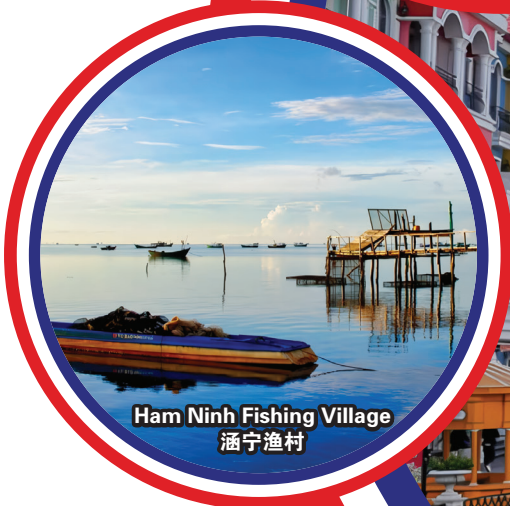
Ham Ninh Fishing Village 涵宁渔村