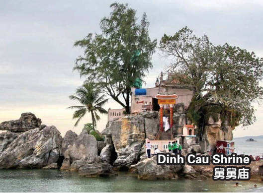
Dinh Cau Shrine 舅舅庙