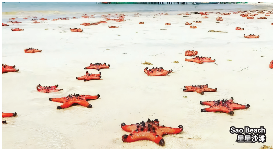
Sao Beach 星星沙滩

免责声明: 由于新冠肺炎疫情旅行限制当地/宗教节日, 公众假期, 天气状况, 交通等情况, 自然灾害, 必要时黄金旅程保留对行程进行适当调整 (调整景点游览顺序) 以确保行程顺利进行, 会或否事先通知。 备注: 如果旅游行程受到上述问题的影响, 将不予退款或更换。图片仅供参考。