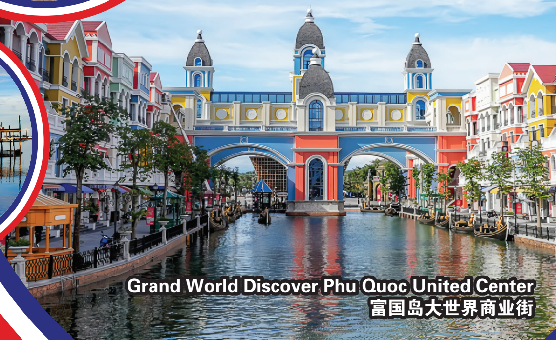
Grand World Discover Phu Quoc United Center 富国岛大世界商业街

行程次序，以当地旅社安排为准。 Sequences of Itinerary are subject to local arrangement.