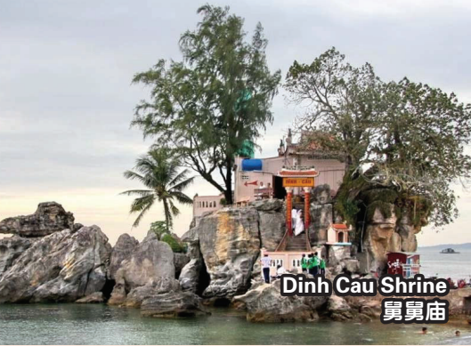
Dinh Cau Shrine 舅舅庙