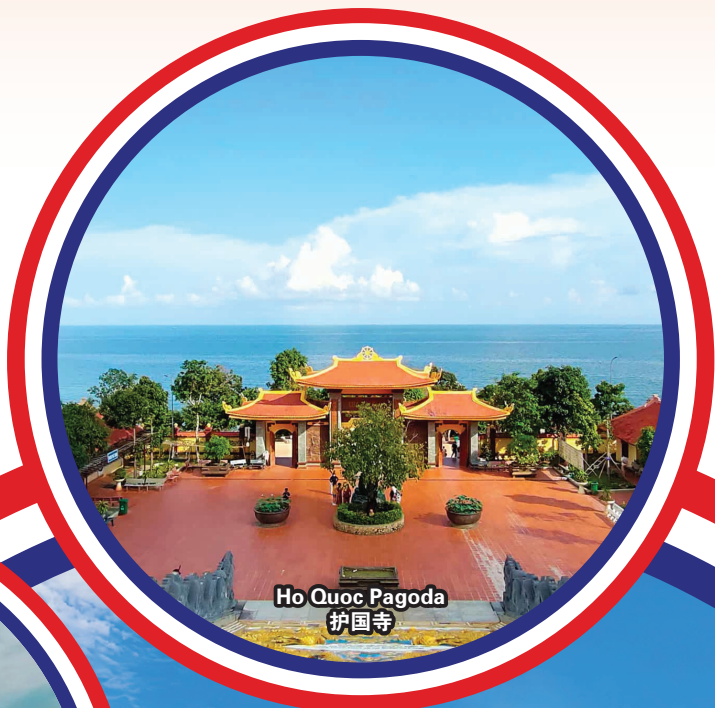
Ho Quoc Pagoda 护国寺