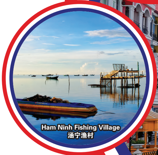
Ham Ninh Fishing Village 涵宁渔村