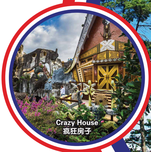
Crazy House 疯狂房子