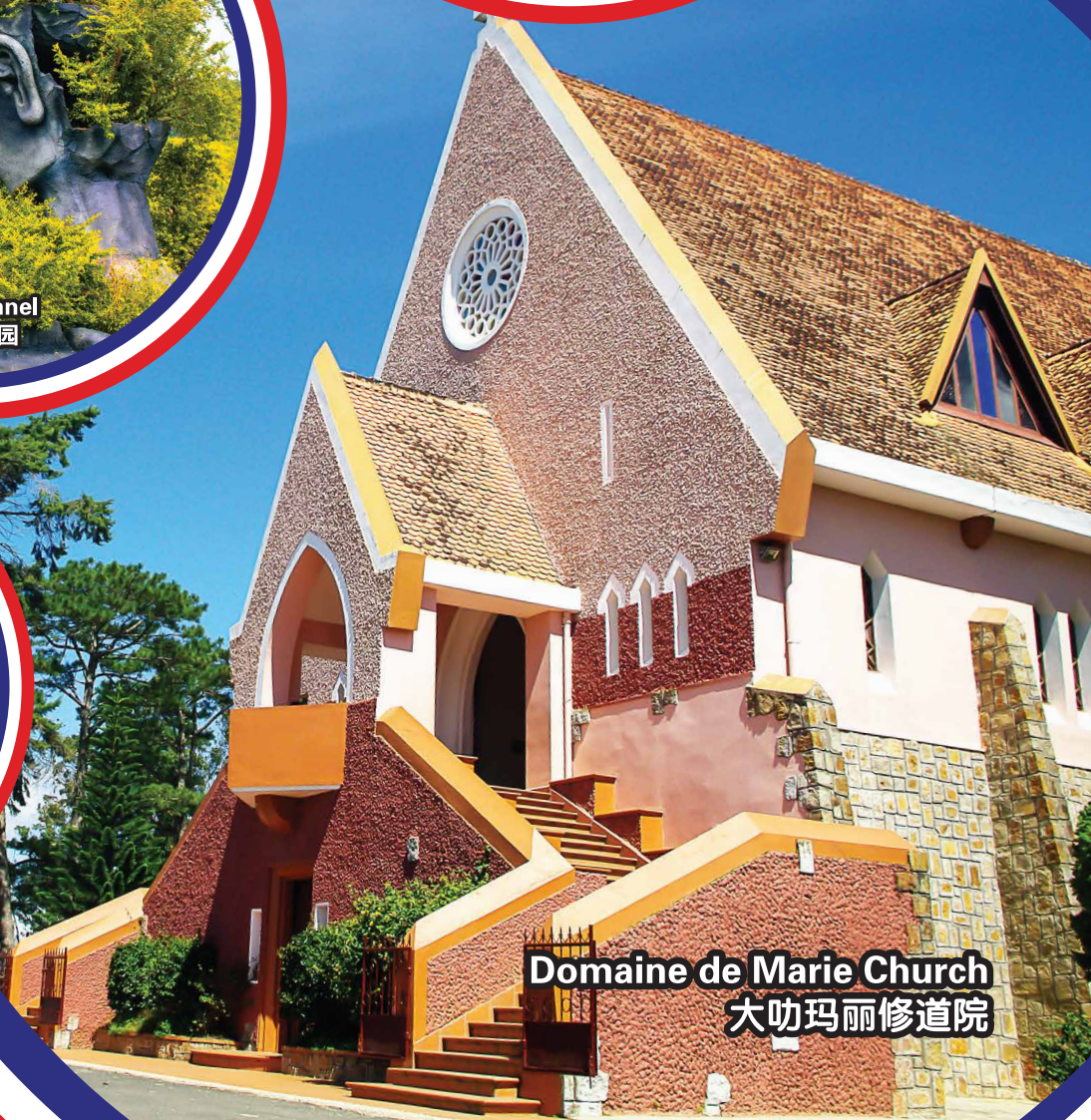
Domaine de Marie Church 大叻玛丽修道院

行程次序，以当地旅社安排为准。 Sequences of Itinerary are subject to local arrangement.