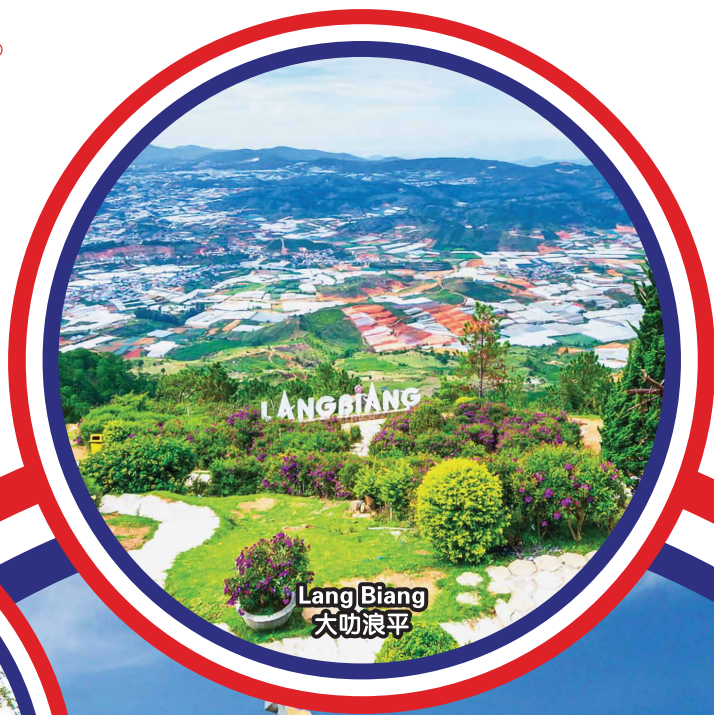
Lang Biang 大叻浪平