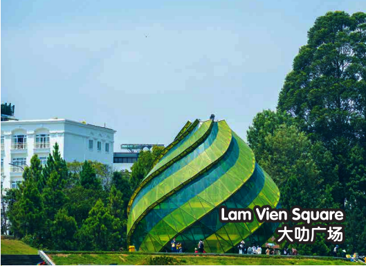
Lam Vien Square 大叻广场