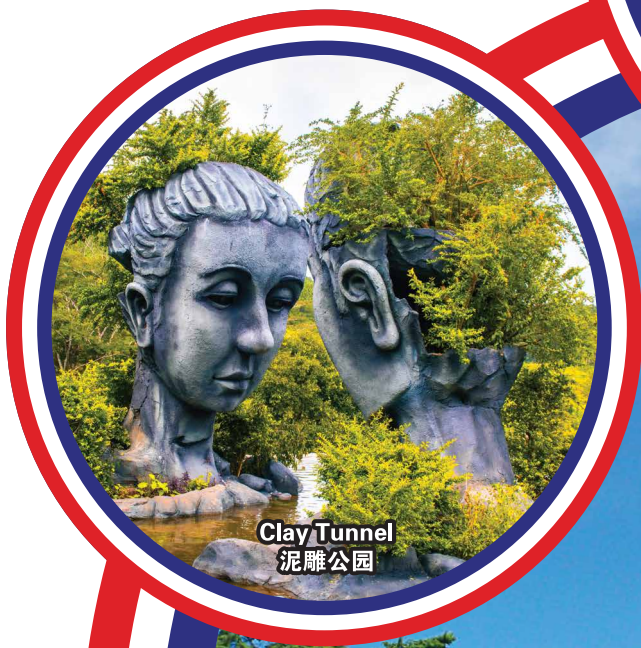
Clay Tunnel 泥雕公园