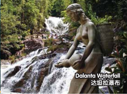
Dalanta Waterfall 达坦拉瀑布