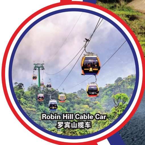
Robin Hill Cable Car 罗宾山缆车