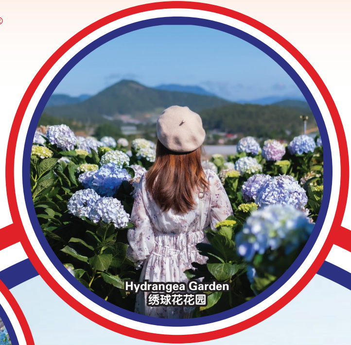
Hydrangea Garden 绣球花花园