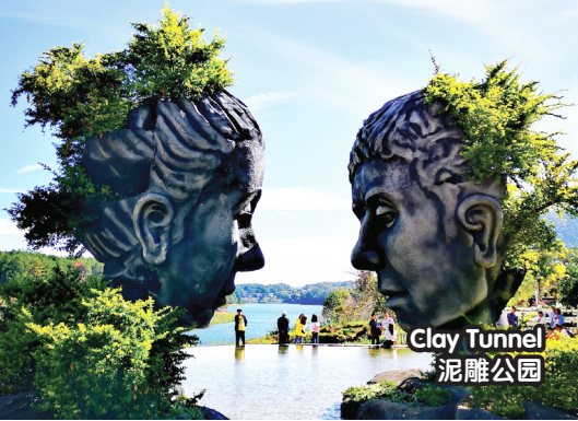
Clay Tunnel 泥雕公园