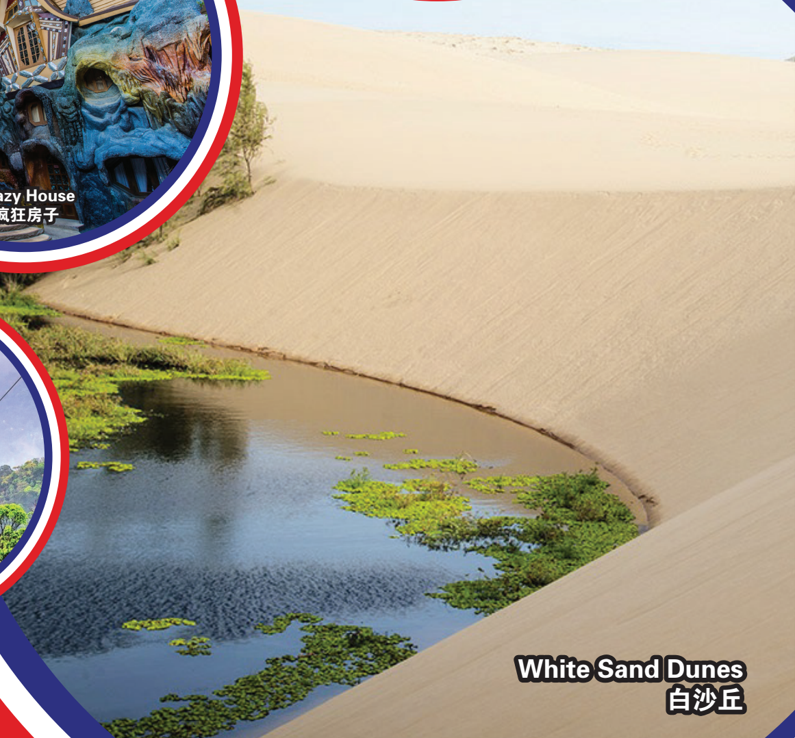
White Sand Dunes 白沙丘

行程次序，以当地旅社安排为准。 Sequences of Itinerary are subject to local arrangement.