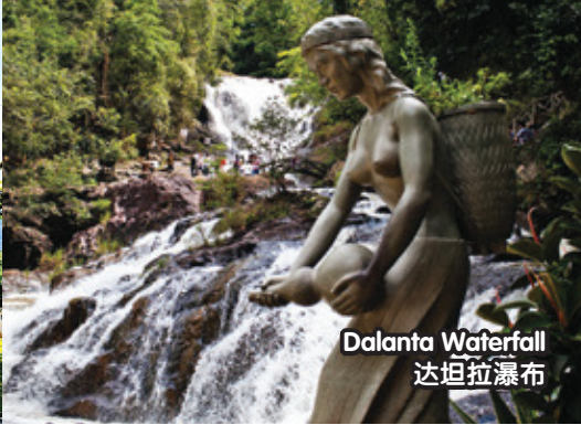
Dalanta Waterfall 达坦拉瀑布