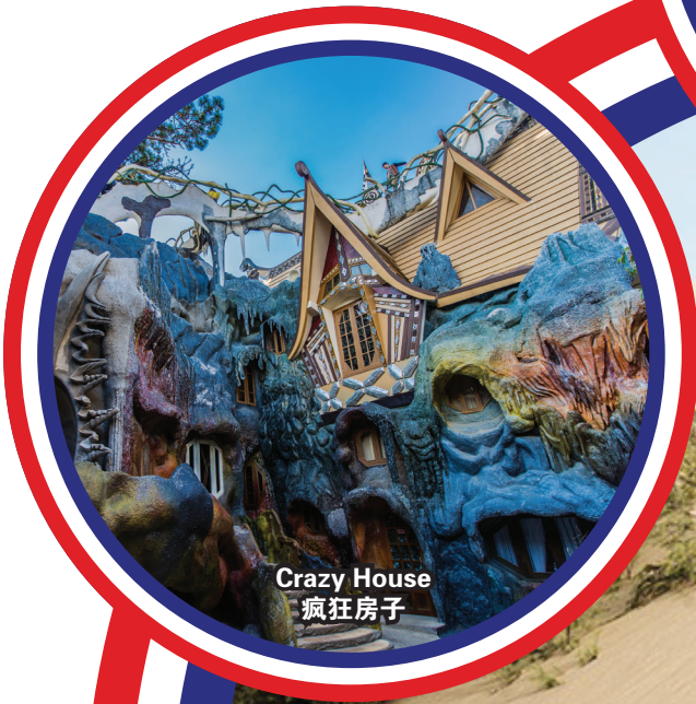
Crazy House 疯狂房子