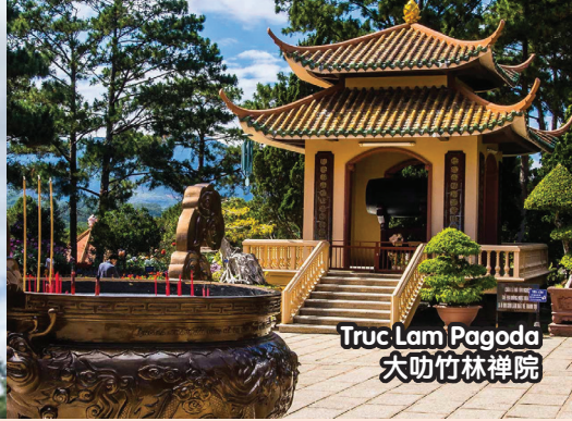
Truc Lam Pagoda 大叻竹林禅院