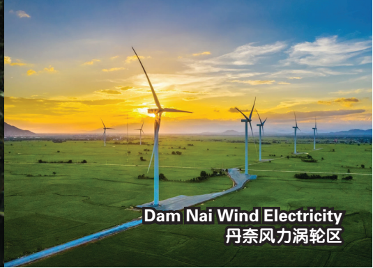
Dam Nai Wind Electricity 丹奈风力涡轮区