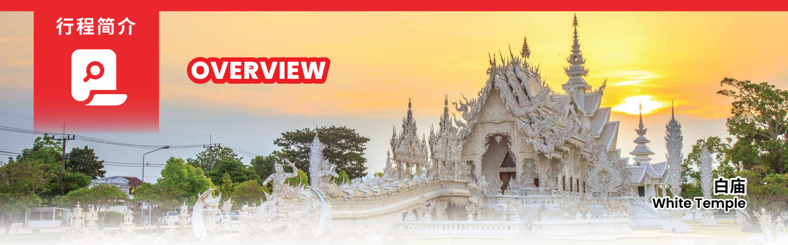
白庙 White Temple