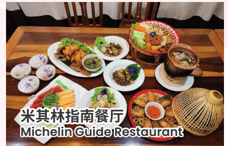
米其林指南餐厅 Michelin Guide Restaurant