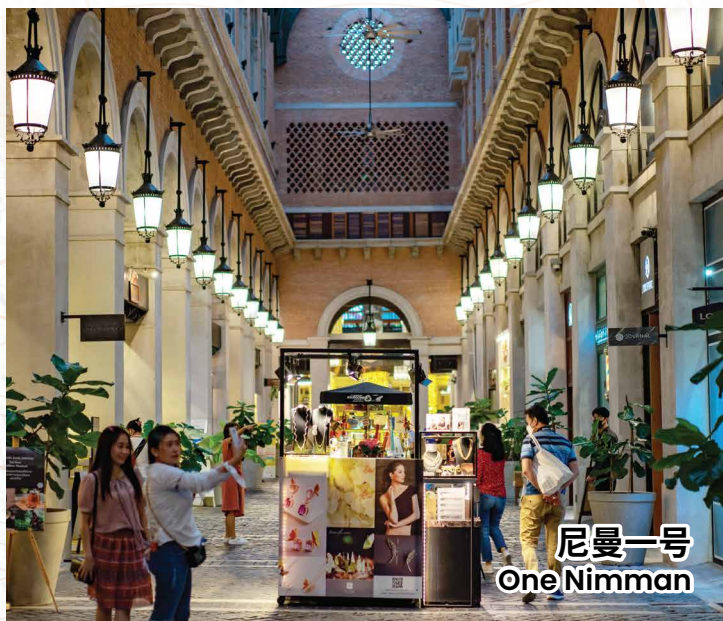
尼曼一号 One Nimman