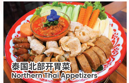
泰国北部开胃菜 Northern Thai Appetizers