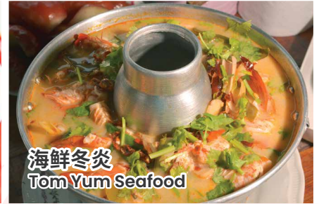
海鲜冬炎 Tom Yum Seafood