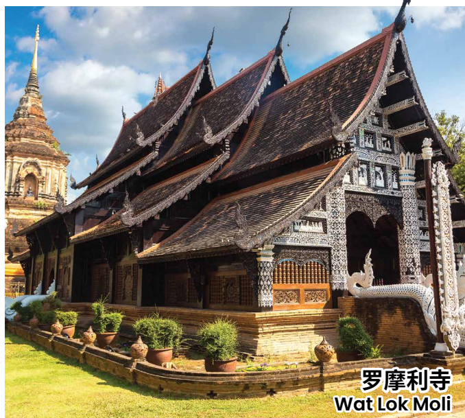
罗摩利寺 Wat Lok Moli