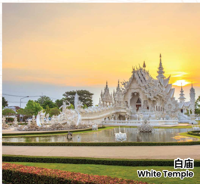
白庙 White Temple