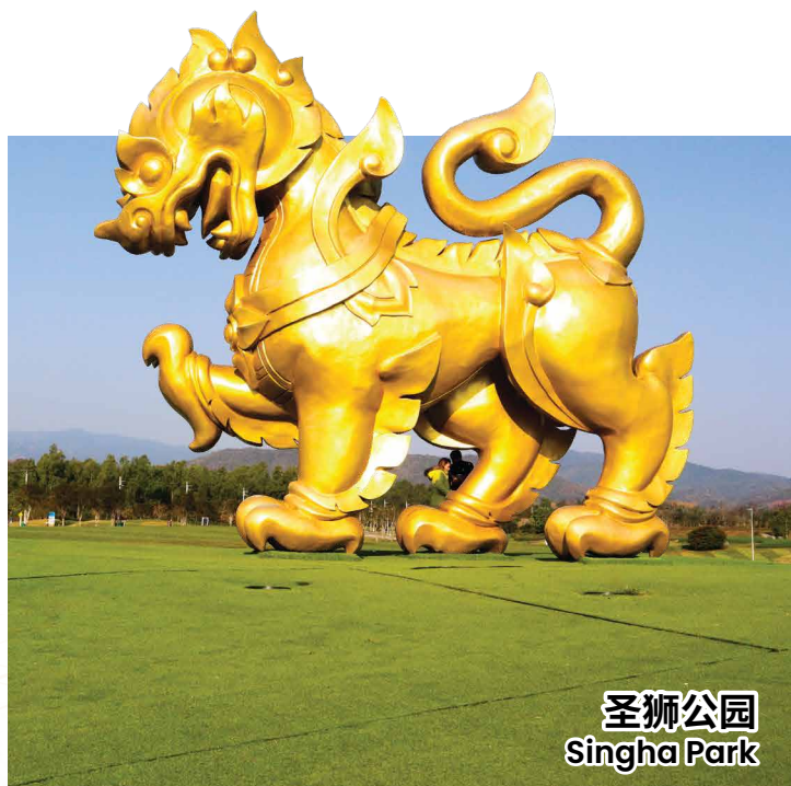
圣狮公园 Singha Park