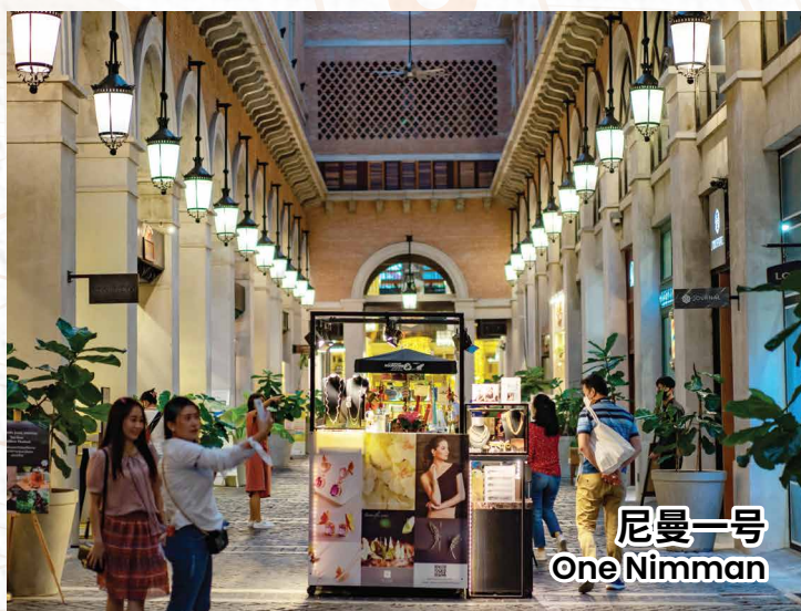
尼曼一号 One Nimman