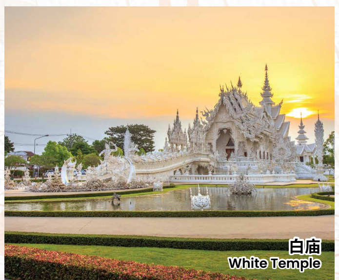
白庙 White Temple