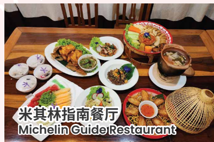
米其林指南餐厅 Michelin Guide Restaurant