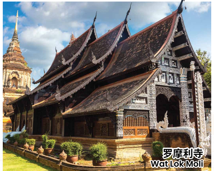
罗摩利寺 Wat Lok Moli