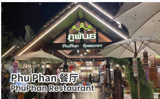
Phu Phan 餐厅 PhuPhan Restaurant