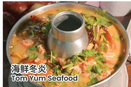
海鲜冬炎 Tom Yum Seafood