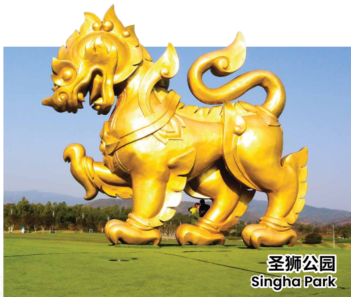
圣狮公园 Singha Park