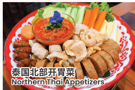
泰国北部开胃菜 Northern Thai Appetizers