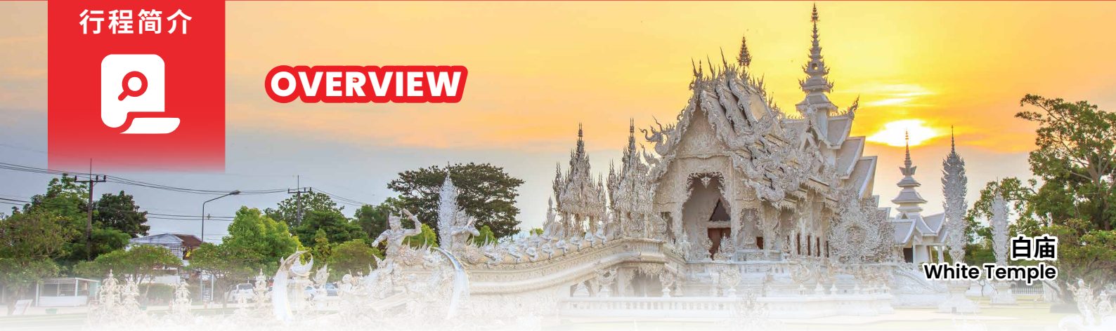
白庙 White Temple