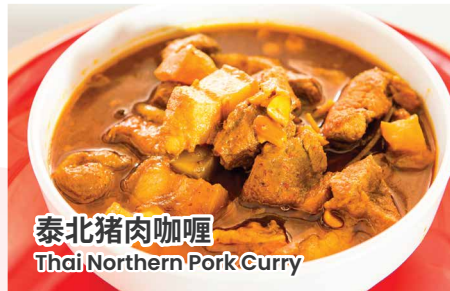
泰北猪肉咖喱 Thai Northern Pork Curry

早 4 餐 午 3 餐 晚 4 餐 B 4 MEALS L 3 MEALS D 4 MEALS