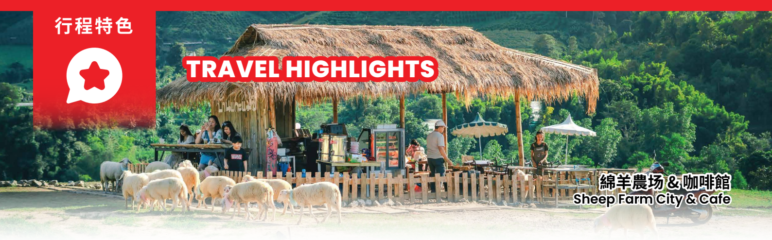
綿羊農場 & 咖啡館 Sheep Farm City & Cafe