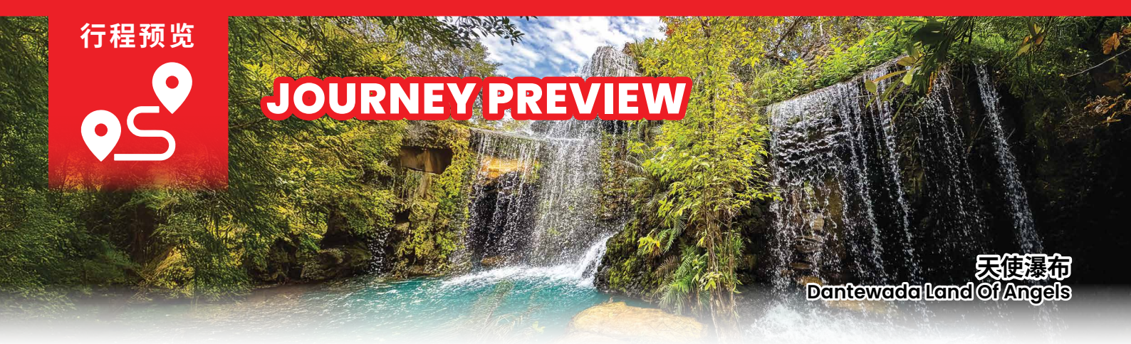
天使瀑布 Dantewada Land Of Angels