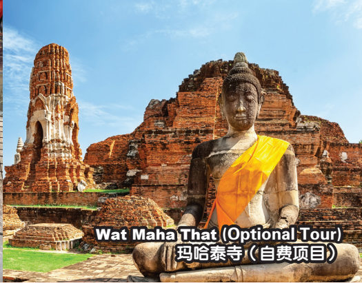
Wat Maha That (Optional Tour) 玛哈泰寺（自费项目）