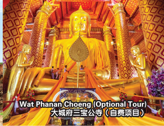
Wat Phanan Choeng (Optional Tour) 大城府三宝公寺（自费项目）