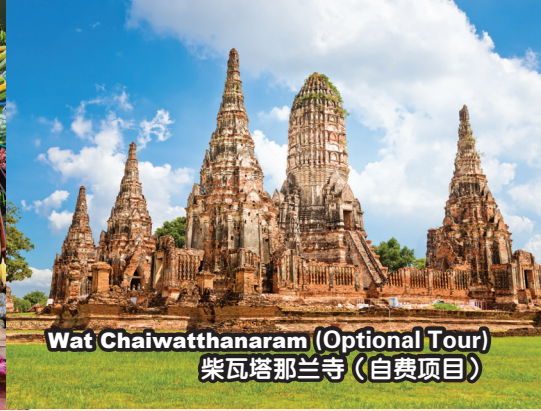
Wat Chaiwatthanaram (Optional Tour) 柴瓦塔那兰寺 (自费项目)