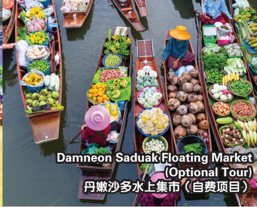
Damneon Saduak Floating Market (Optional Tour) 丹嫩沙多水上集市 (自费项目)