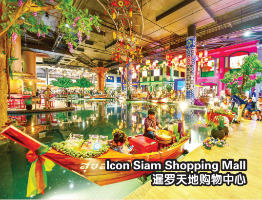
Icon Siam Shopping Mall 暹罗天地购物中心