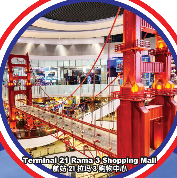
Terminal 21 Rama 3 Shopping Mall 航站21拉玛3购物中心