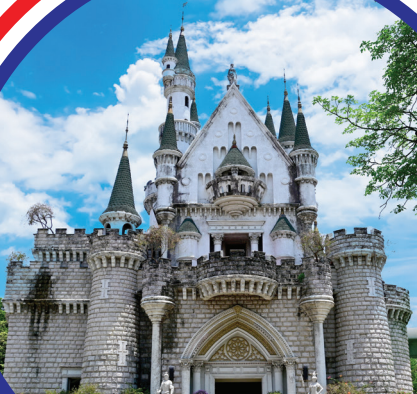
Jodd Fair DanNermit (Optional Tour) 新乔德夜市: 神奇之地 (自费项目)