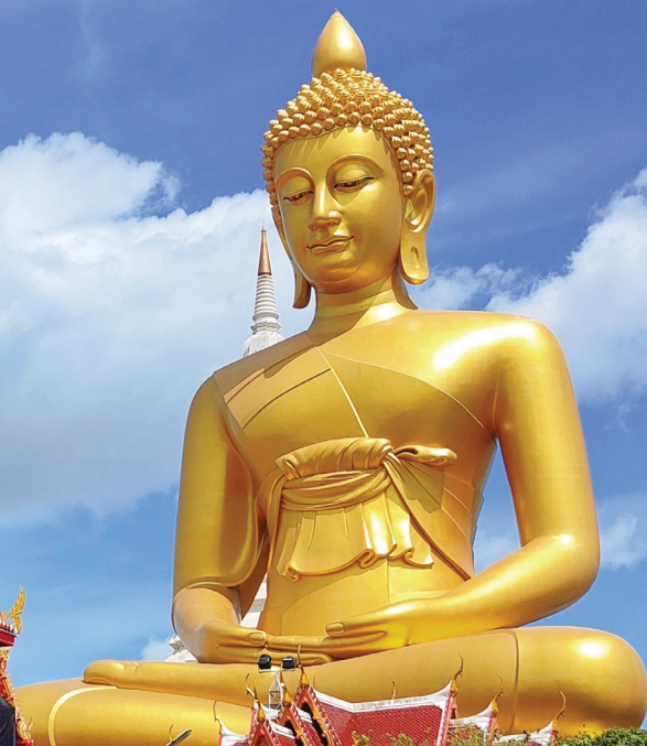
Wat Paknam Phasi Charoen 水门寺

行程次序，以当地旅社安排为准。 Sequences of Itinerary are subject to local arrangement.