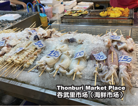
Thonburi Market Place 吞武里市场（海鲜市场）