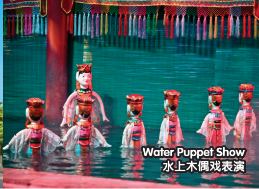
Water Puppet Show 水上木偶戏表演