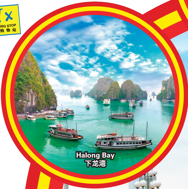
Halong Bay 下龙湾