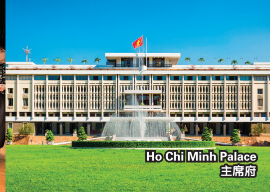
Ho Chi Minh Palace 主席府