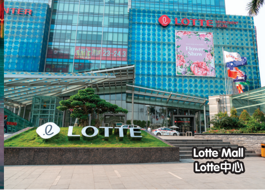
Lotte Mall Lotte中心