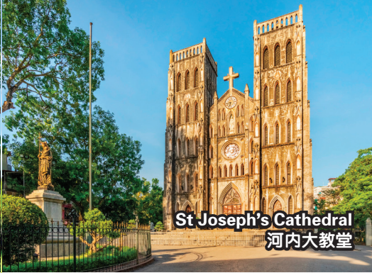
St Joseph's Cathedral 河内大教堂