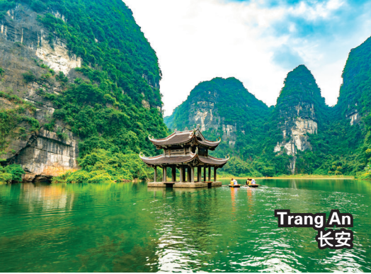
Trang An 长安