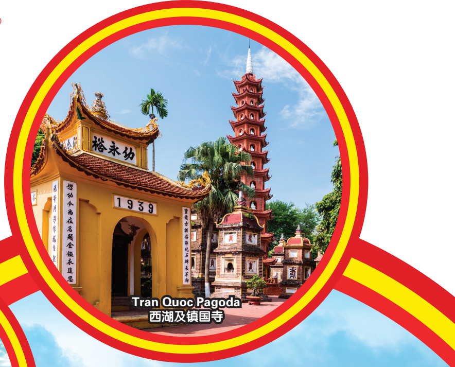
Tran Quoc Pagoda 西湖及镇国寺

Complimentary 2-hour cruise in Halong Bay Entrance ticket to Heavenly Palace Cave in Halong Bay