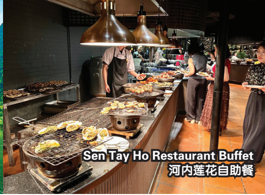
Sen Tay Ho Restaurant Buffet 河内莲花自助餐