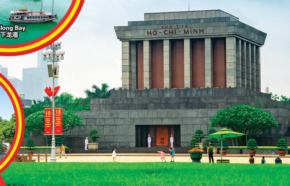
Ba Dinh Square 巴亭广场

行程次序，以当地旅社安排为准。 Sequences of Itinerary are subject to local arrangement.