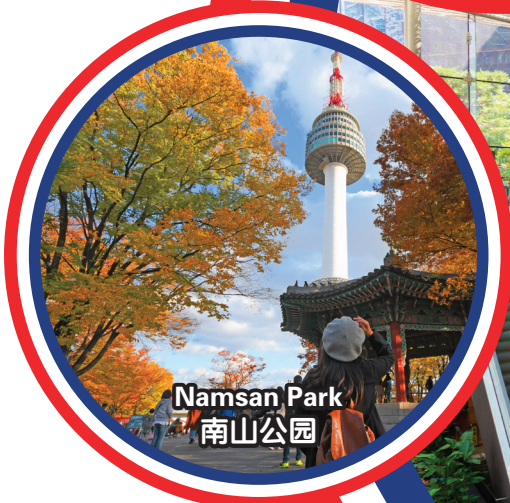
Namsan Park 南山公园