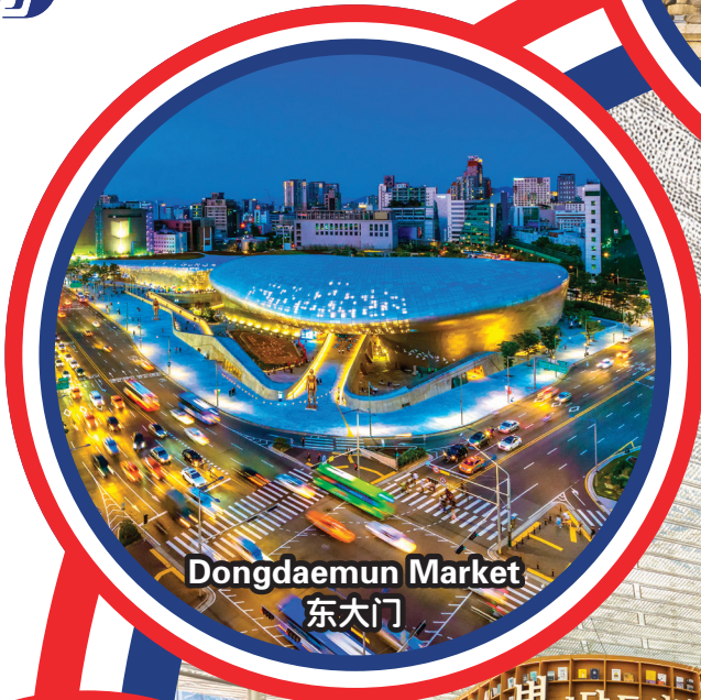
Dongdaemun Market 东大门