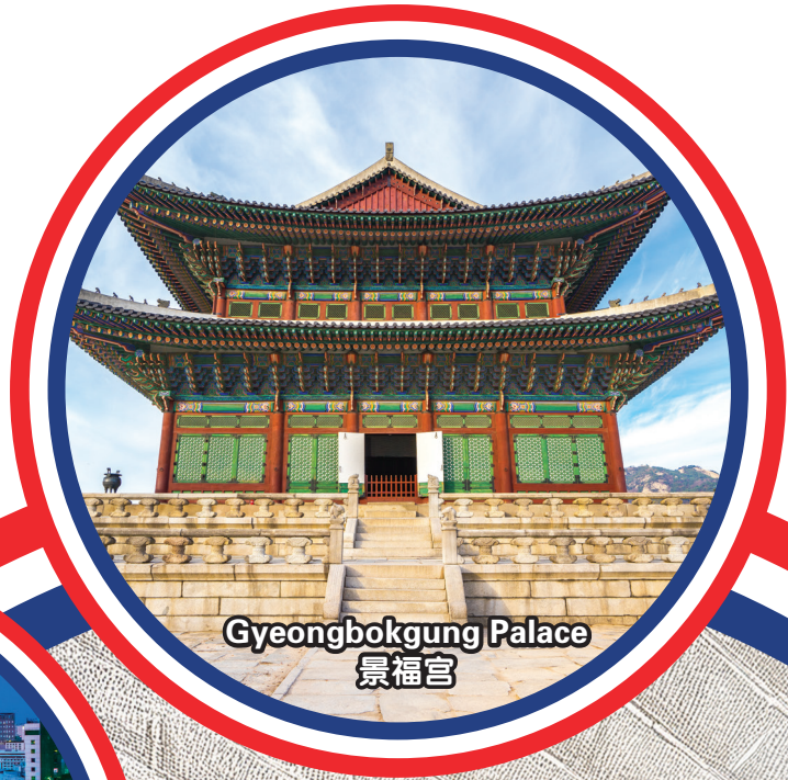
Gyeongbokgung Palace 景福宫