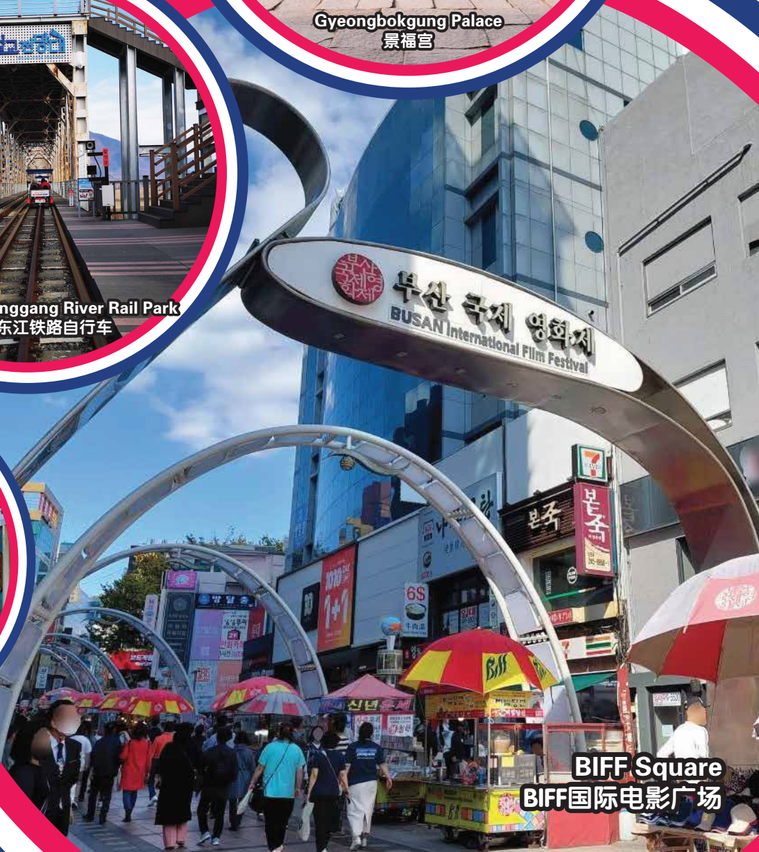
BIFF Square BIFF国际电影广场

行程次序，以当地旅社安排为准。 Sequences of Itinerary are subject to local arrangement.