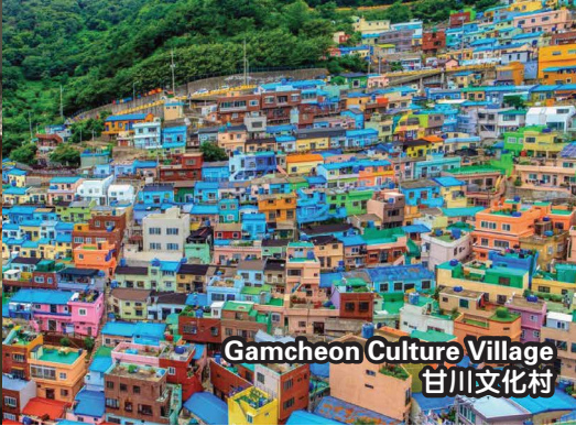
Gamcheon Culture Village 甘川文化村