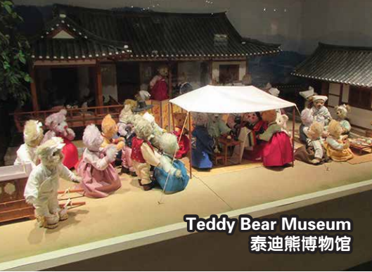
Teddy Bear Museum 泰迪熊博物馆