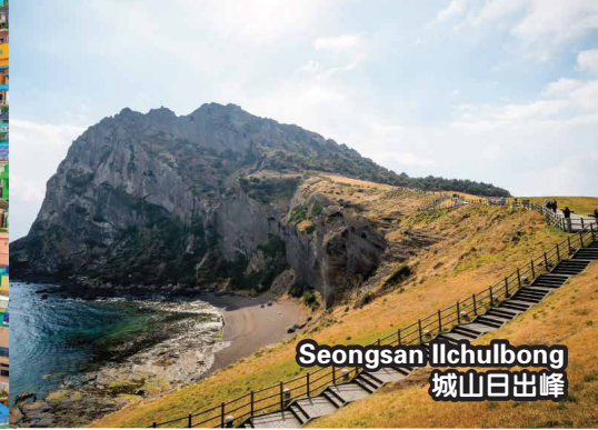
Seongsan Ilchulbong 城山日出峰