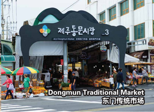
Dongmun Traditional Market 东门传统市场