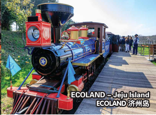
ECOLAND - Jeju Island ECOLAND 济州岛