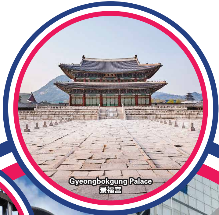
Gyeongbokgung Palace 景福宫