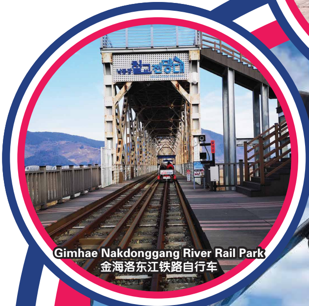
Gimhae Nakdonggang River Rail Park 金海洛东江铁路自行车