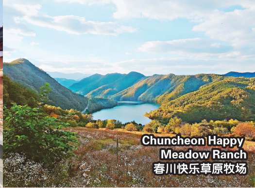
Chuncheon Happy Meadow Ranch 春川快乐草原牧场