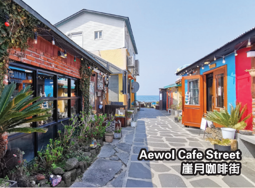
Aewol Cafe Street 崖月咖啡街