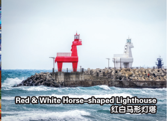
Red & White Horse-shaped Lighthouse 红白马形灯塔