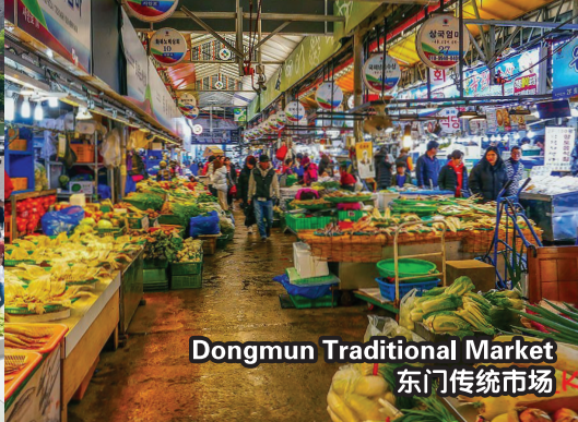
Dongmun Traditional Market 东门传统市场