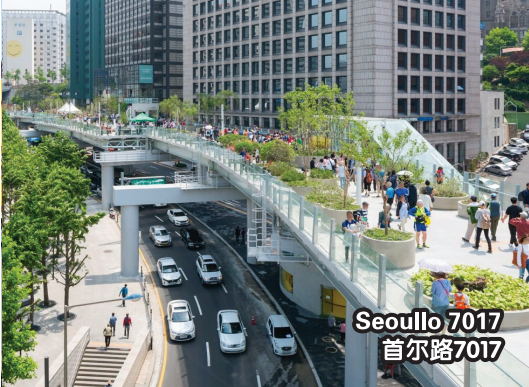
Seoullo 7017 首尔路7017