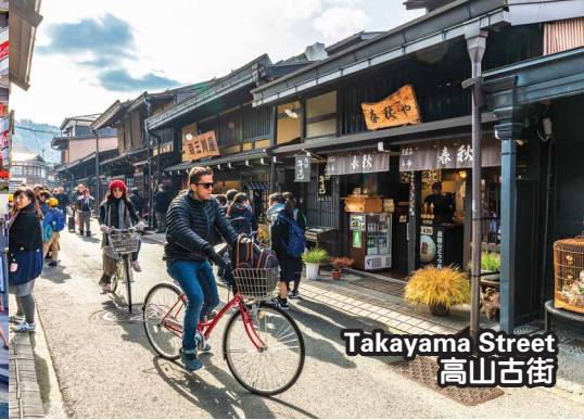
Takayama Street 高山古街