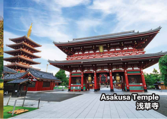
Asakusa Temple 浅草寺