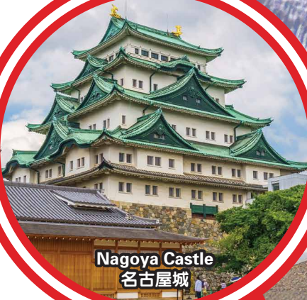
Nagoya Castle 名古屋城