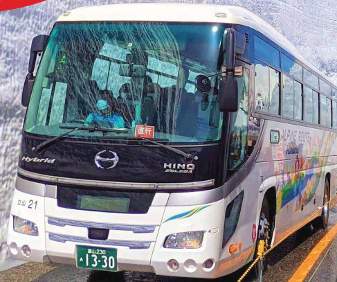
Tateyama Kurobe Alpine Route 立山黑部阿尔卑斯山脉路线