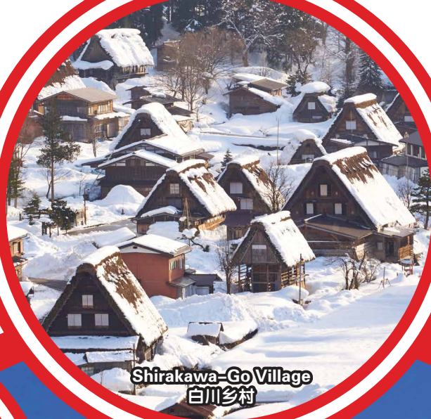
Shirakawa-Go Village 白川乡村