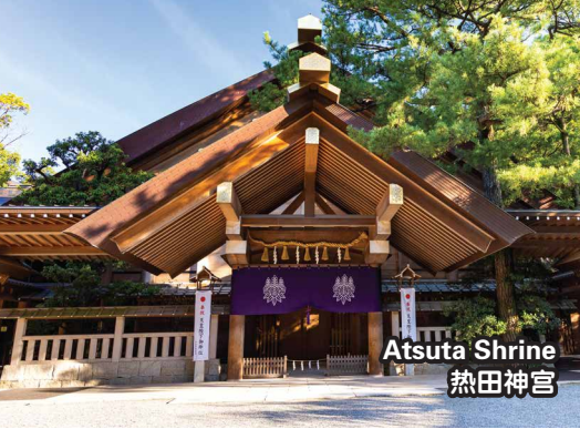
Atsuta Shrine 热田神宫