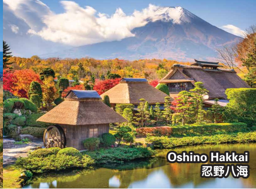
Oshino Hakkai 忍野八海