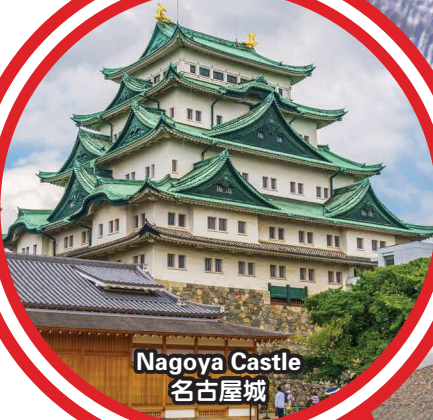
Nagoya Castle 名古屋城