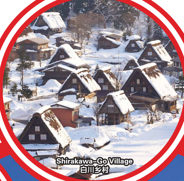
Shirakawa-Go Village 白川乡村