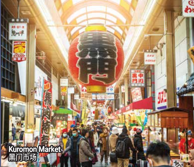
Kuromon Market 黑门市场