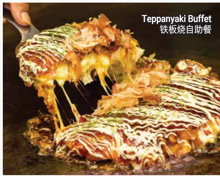
Teppanyaki Buffet 铁板烧自助餐

Deluxe abalone, lobster, scallops, prawns (Japanese pork, beef and chicken all-you-can-eat!) 豪华鲍鱼, 龙虾, 带子, 明虾 (日本豚、牛、鸡肉吃到饱!)