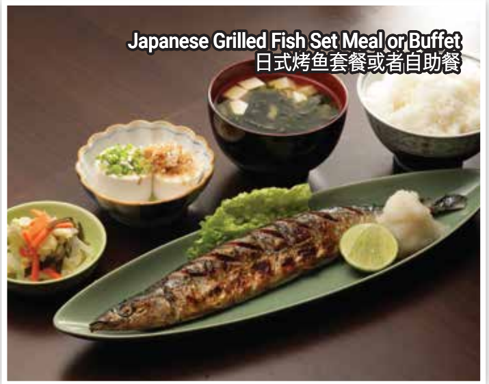
Japanese Grilled Fish Set Meal or Buffet 日式烤鱼套餐或者自助餐