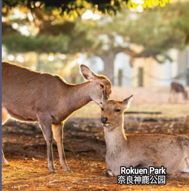
Rokuen Park 奈良神鹿公园