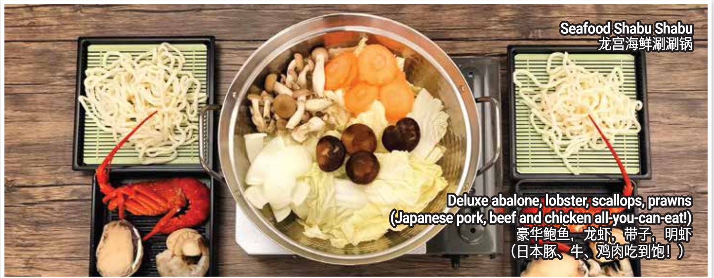
Seafood Shabu Shabu 龙宫海鲜涮涮锅

Deluxe abalone, lobster, scallops, prawns (Japanese pork, beef and chicken all-you-can-eat!) 豪华鲍鱼, 龙虾, 带子, 明虾 (日本豚、牛、鸡肉吃到饱!)