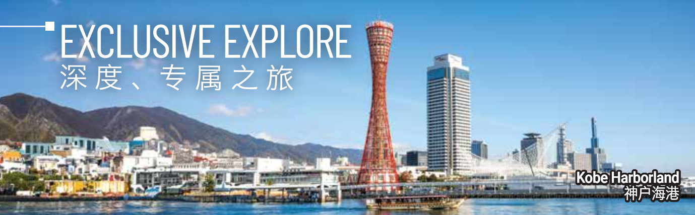
Kobe Harborland 神戸海港