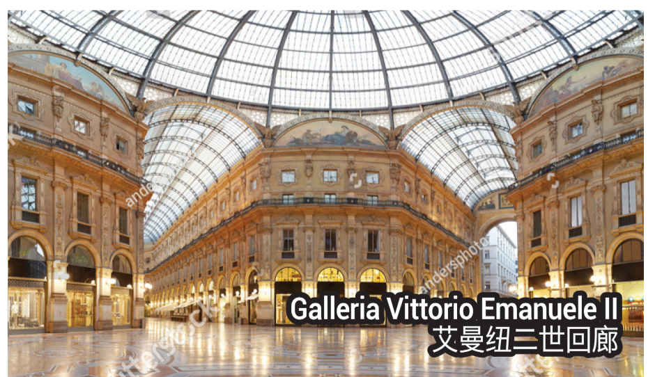
Galleria Vittorio Emanuele II 艾曼纽二世回廊