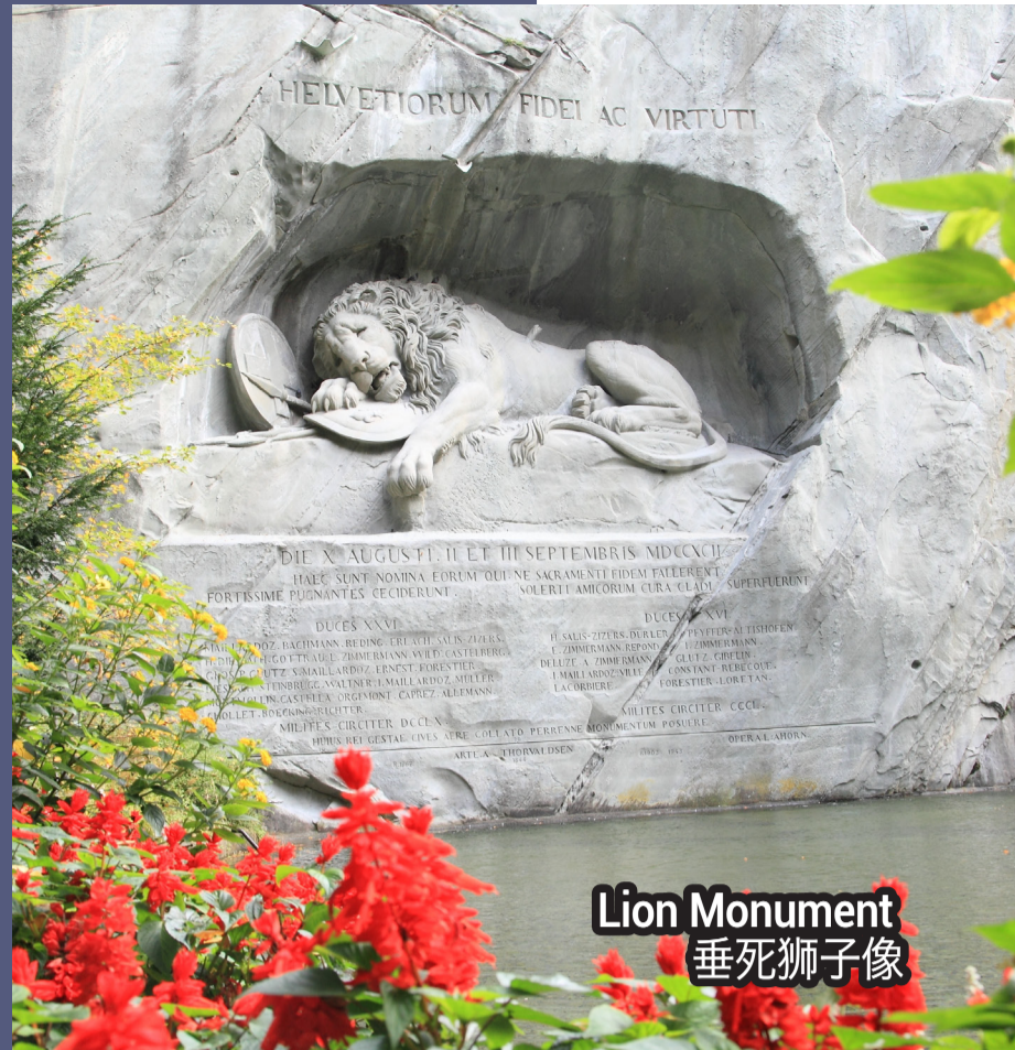
Lion Monument 垂死狮子像