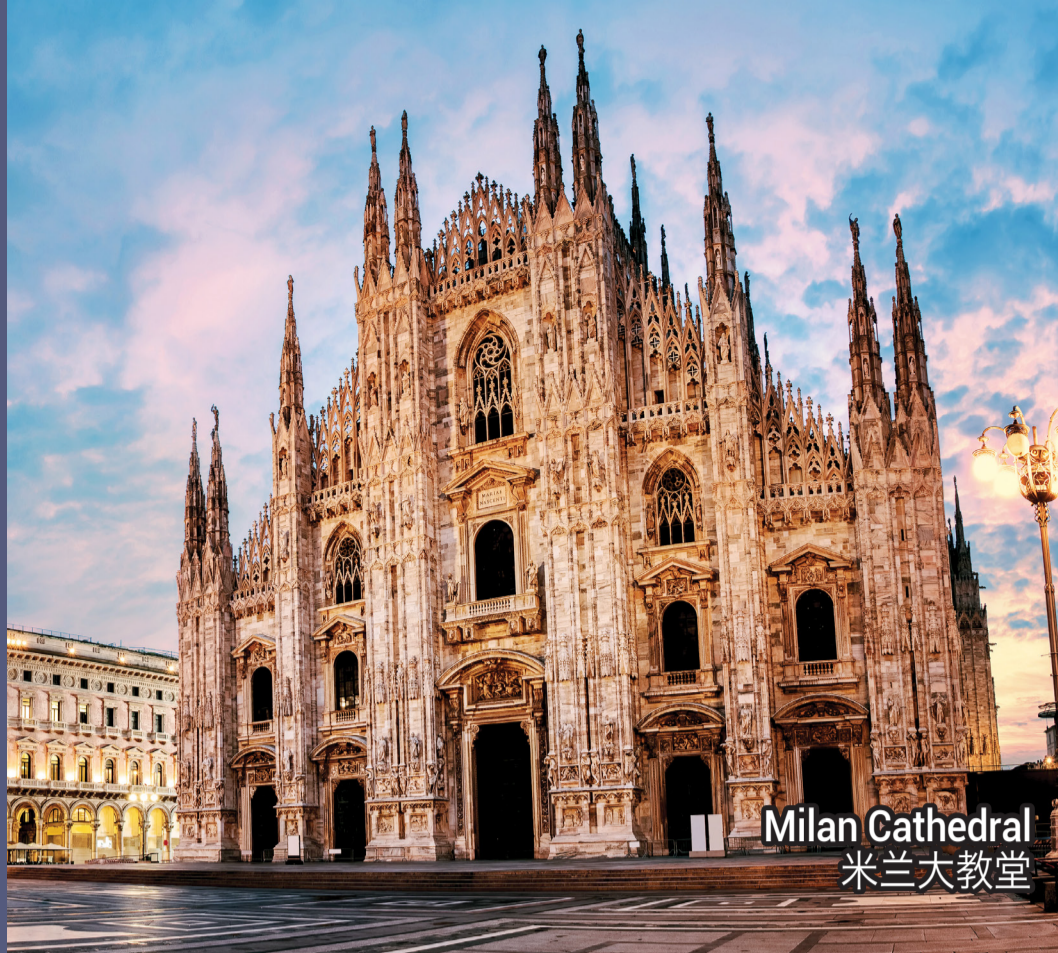
Milan Cathedral 米兰大教堂