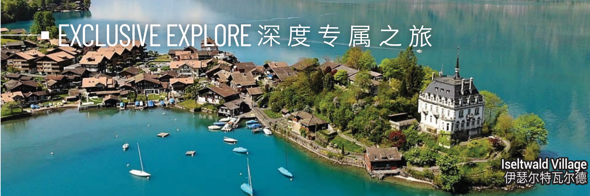
Iseltwald Village 伊瑟尔特瓦尔德