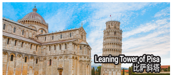
Leaning Tower of Pisa 比萨斜塔