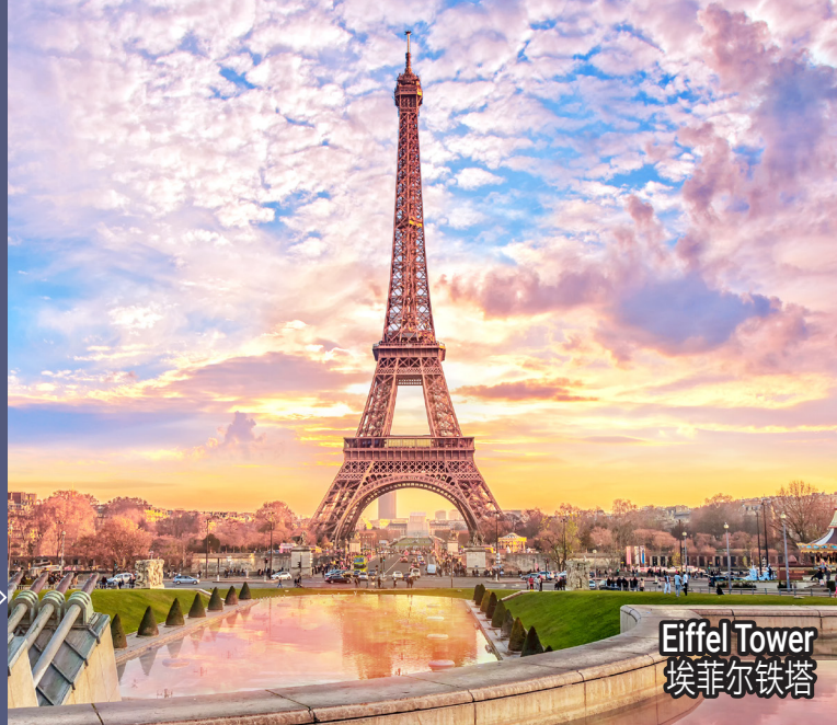
Eiffel Tower 埃菲尔铁塔