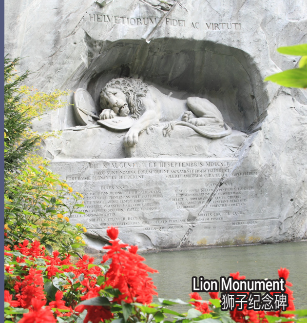
Lion Monument 狮子纪念碑