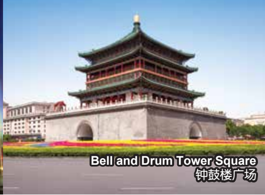
Bell and Drum Tower Square 钟鼓楼广场