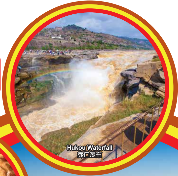
Hukou Waterfall 壶口瀑布

3晚五星酒店：西安蓝溪酒店或同级 特色餐：自助涮烤 3 Nights Stay at 5-Star Hotel: Xi'an Lanxi Hotel or similar Special Meals: HOT POT and BBQ Buffet