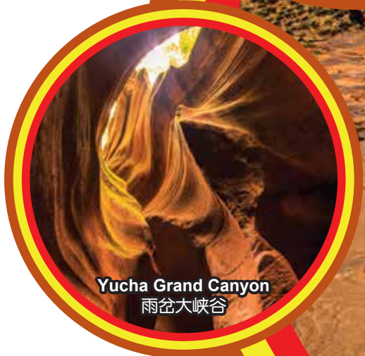
Yucha Grand Canyon 雨岔大峡谷