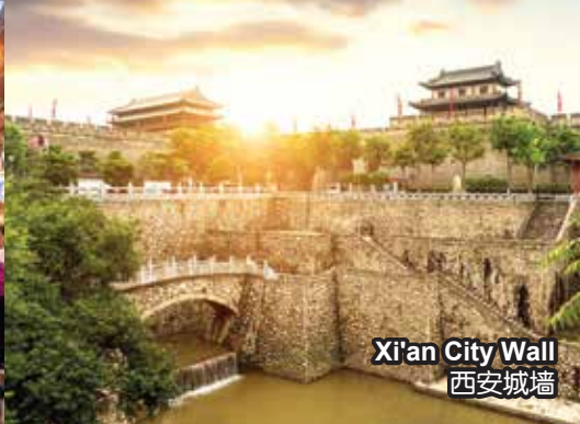
Xi'an City Wall 西安城墙