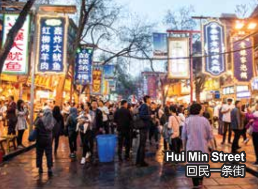
Hui Min Street 回民一条街