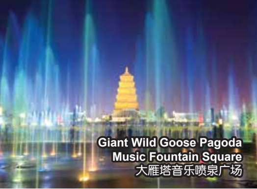
Giant Wild Goose Pagoda Music Fountain Square 大雁塔音乐喷泉广场