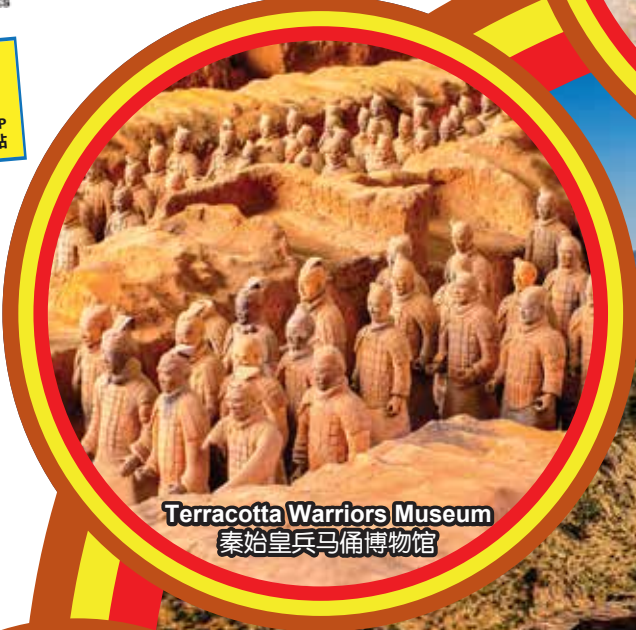
Terracotta Warriors Museum 秦始皇兵马俑博物馆