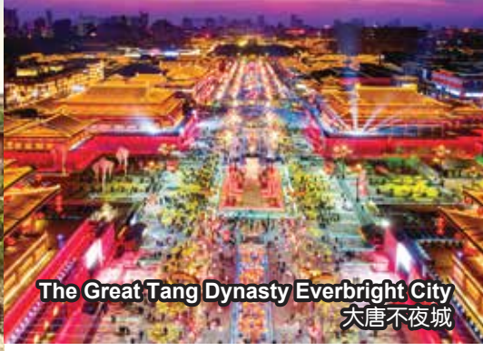
The Great Tang Dynasty Everbright City 大唐不夜城