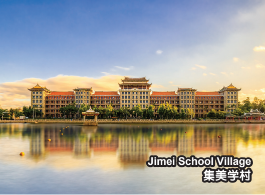
Jimei School Village 集美学村