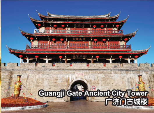
Guangji Gate Ancient City Tower 广济门古城楼