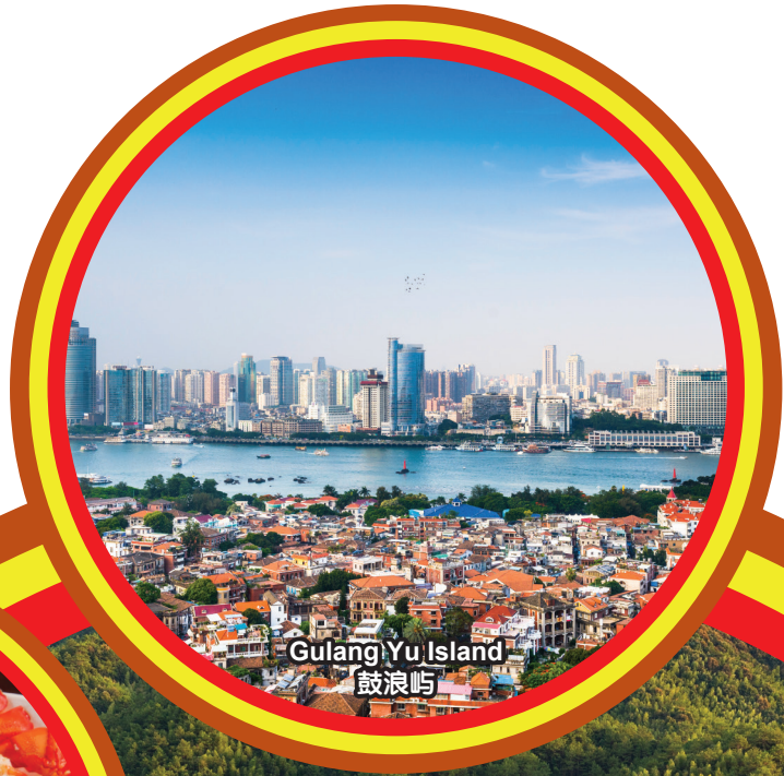
Gulang Yu Island 鼓浪屿