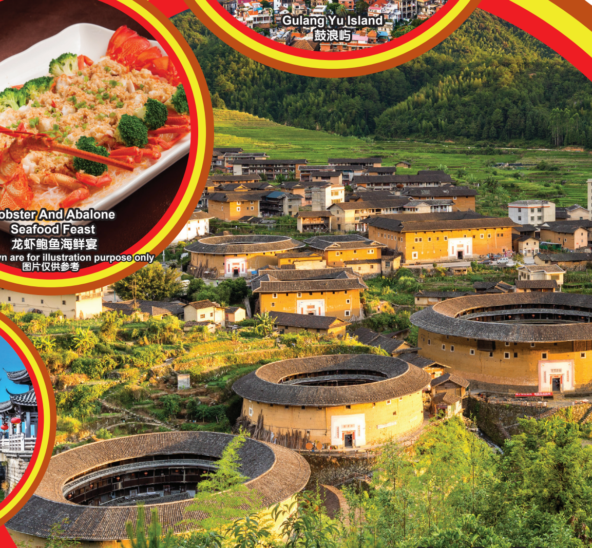
Yongding Tulou 永定土楼