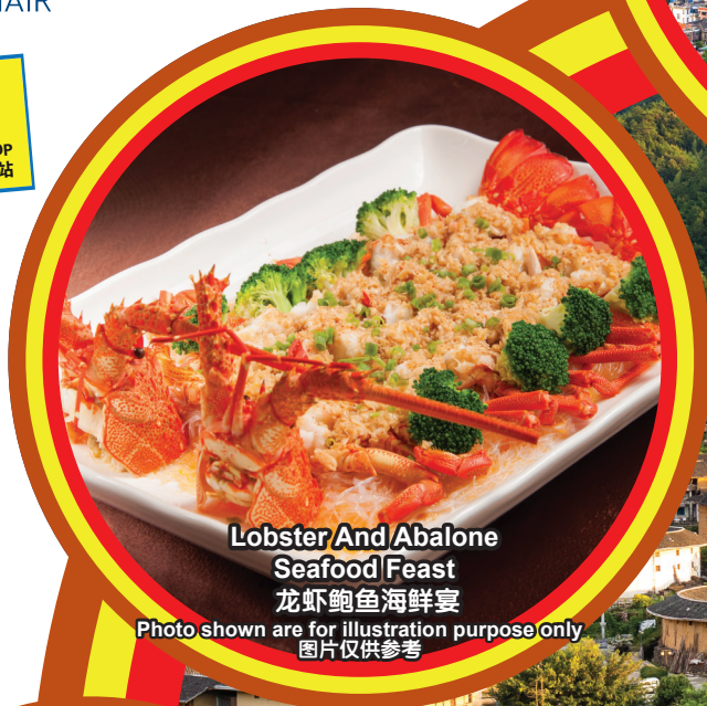
Lobster And Abalone Seafood Feast 龙虾鲍鱼海鲜宴

Photo shown are for illustration purpose only 图片仅供参考