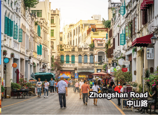
Zhongshan Road 中山路