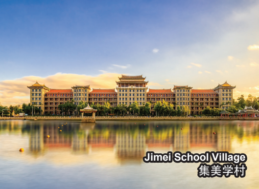
Jimei School Village 集美学村