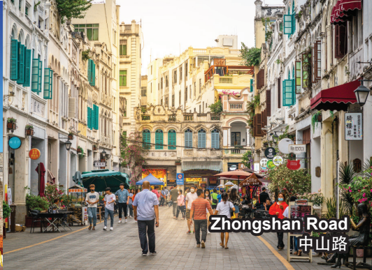
Zhongshan Road 中山路