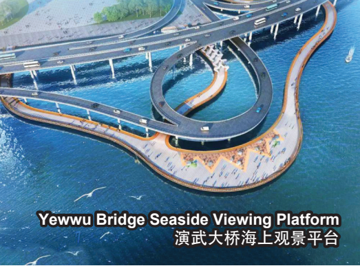
Yewwu Bridge Seaside Viewing Platform 演武大桥海上观景平台