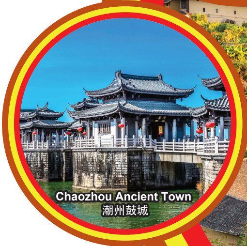
Chaozhou Ancient Town 潮州鼓城