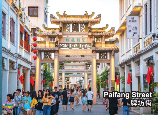
Paifang Street 牌坊街