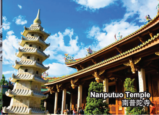
Nanputuo Temple 南普陀寺