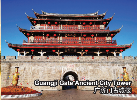
Guangji Gate Ancient City Tower 广济门古城楼