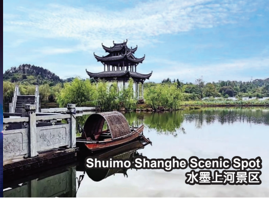
Shuimo Shanghe Scenic Spot 水墨上河景区