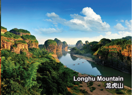
Longhu Mountain 龙虎山