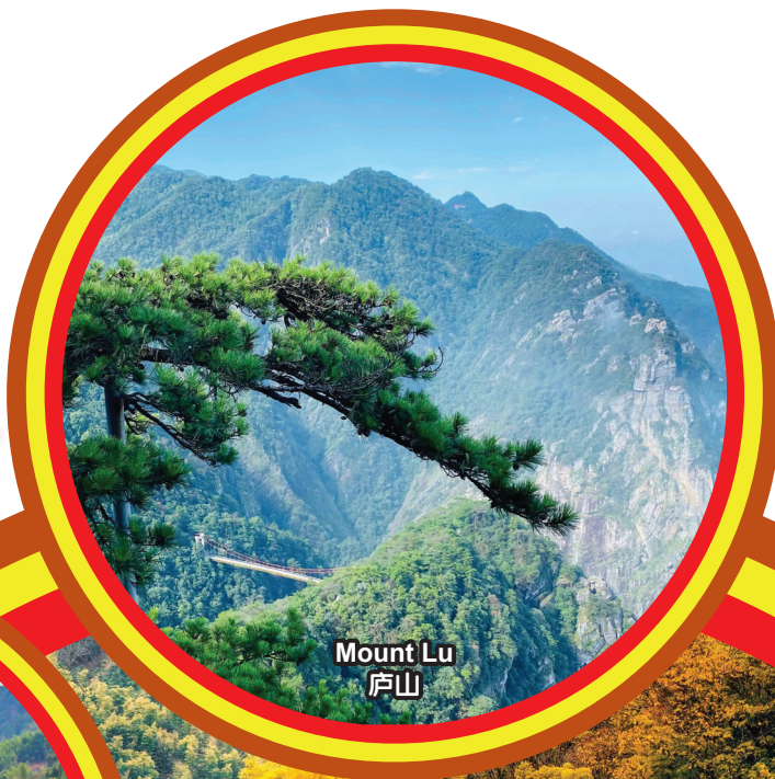
Mount Lu 庐山