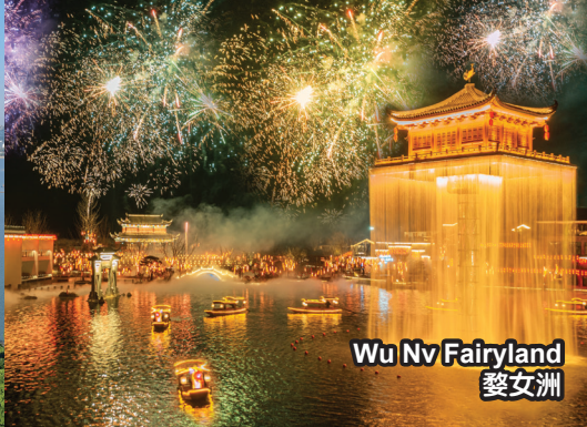
Wu Nv Fairyland 婺女洲