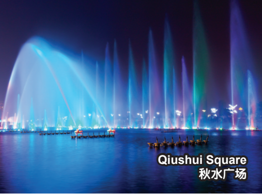
Qiushui Square 秋水广场