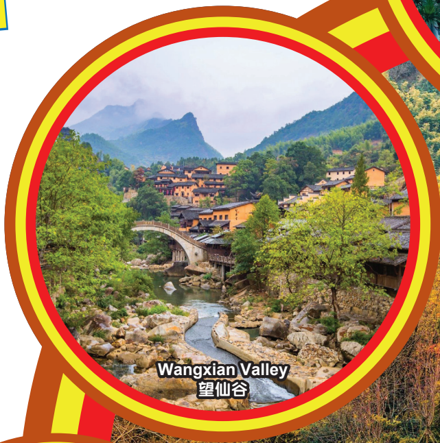
Wangxian Valley 望仙谷