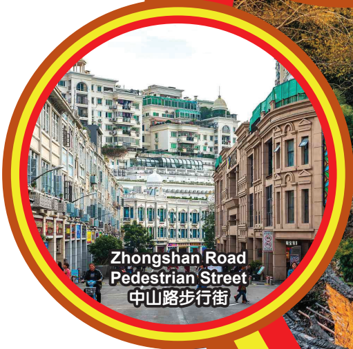
Zhongshan Road Pedestrian Street 中山路步行街