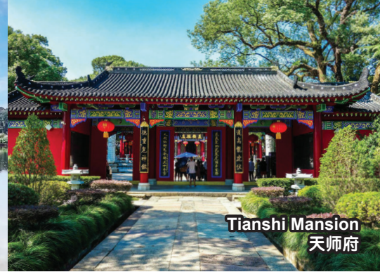
Tianshi Mansion 天师府