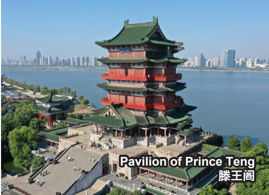
Pavilion of Prince Teng 滕王阁