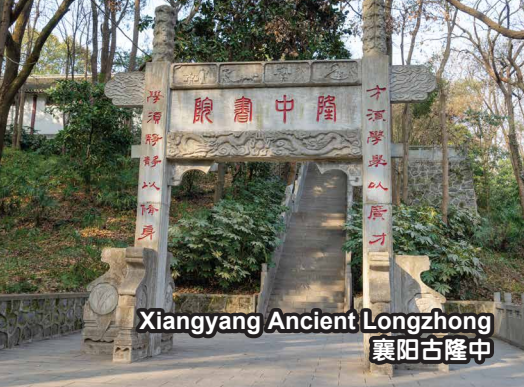
Xiangyang Ancient Longzhong 襄阳古隆中