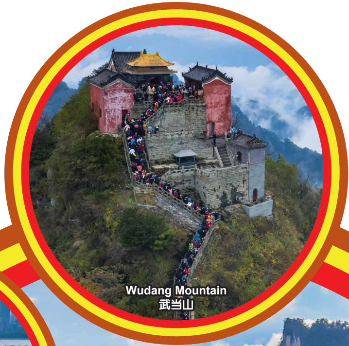
Wudang Mountain 武当山