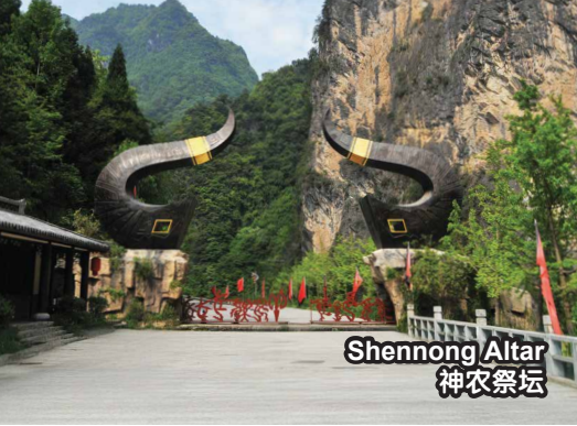
Shennong Altar 神农祭坛