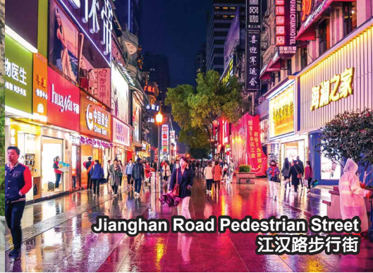
Jiangnan Road Pedestrian Street 江汉路步行街