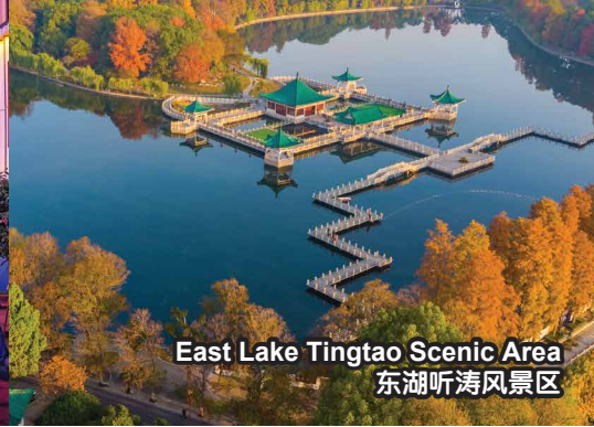
East Lake Tingtao Scenic Area 东湖听涛风景区