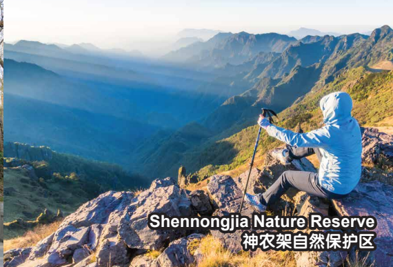
Shennongjia Nature Reserve 神农架自然保护区