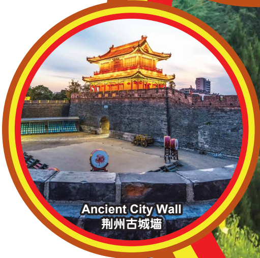
Ancient City Wall 荆州古城墙