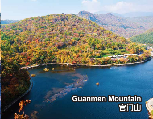
Guanmen Mountain 官门山