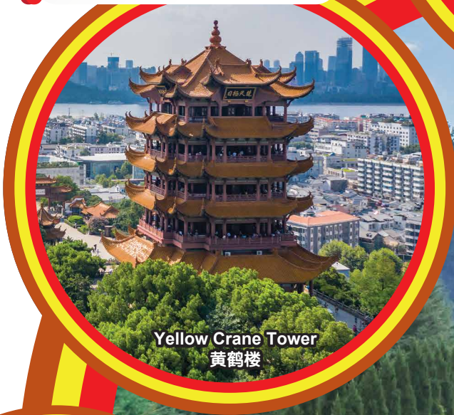
Yellow Crane Tower 黄鹤楼