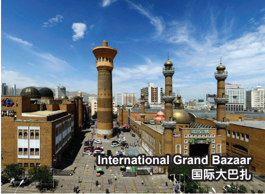
International Grand Bazaar 国际大巴扎