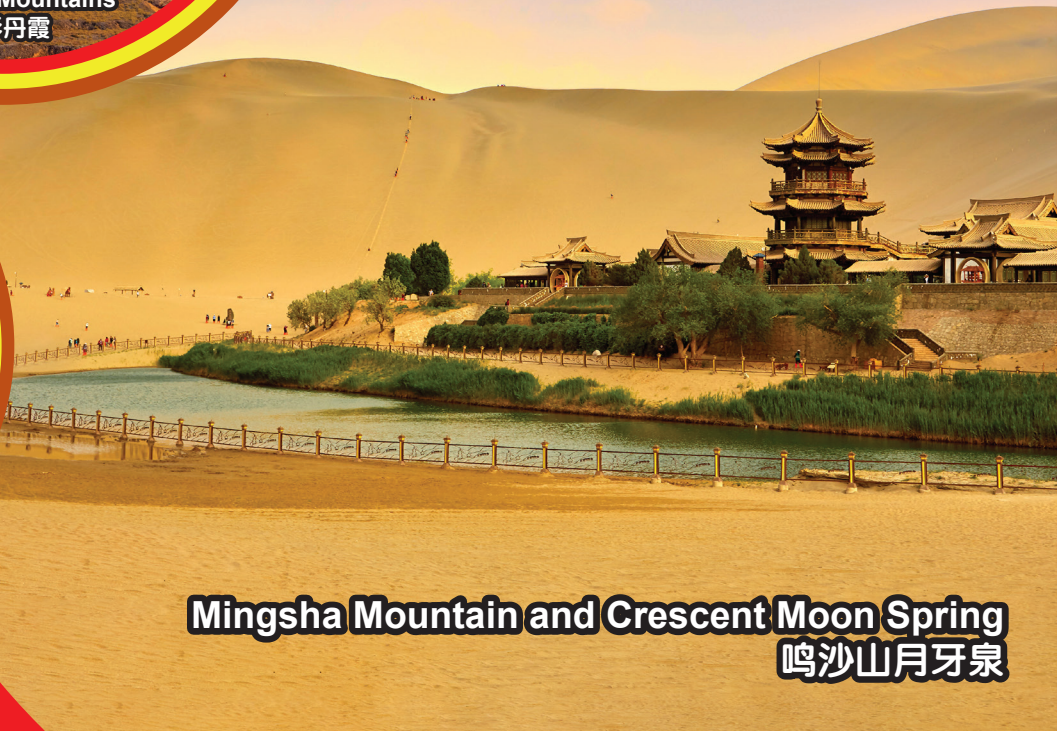
Mingsha Mountain and Crescent Moon Spring 鸣沙山月牙泉

行程次序，以當地旅社安排為準。 Sequences of Itinerary are subject to local arrangement.