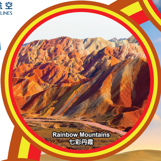
Rainbow Mountains 七彩丹霞