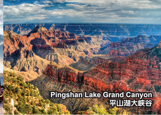
Pingshan Lake Grand Canyon 平山湖大峡谷