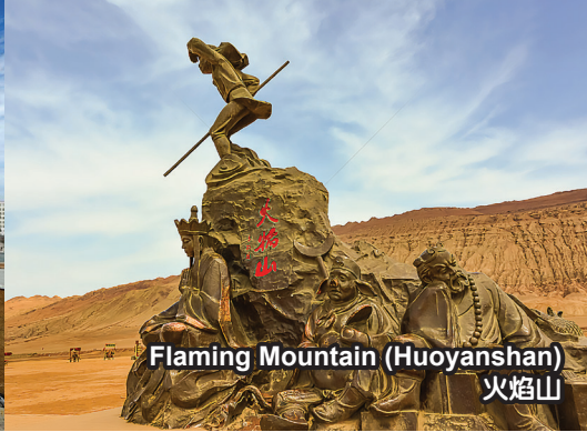
Flaming Mountain (Huoyanshan) 火焰山