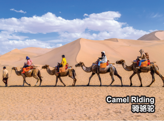
Camel Riding 骑骆驼