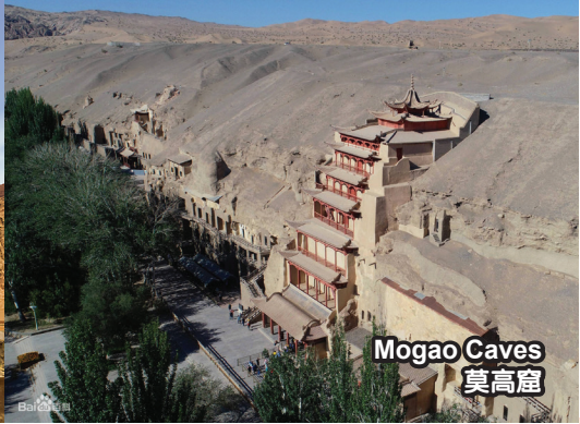
Mogao Caves 莫高窟