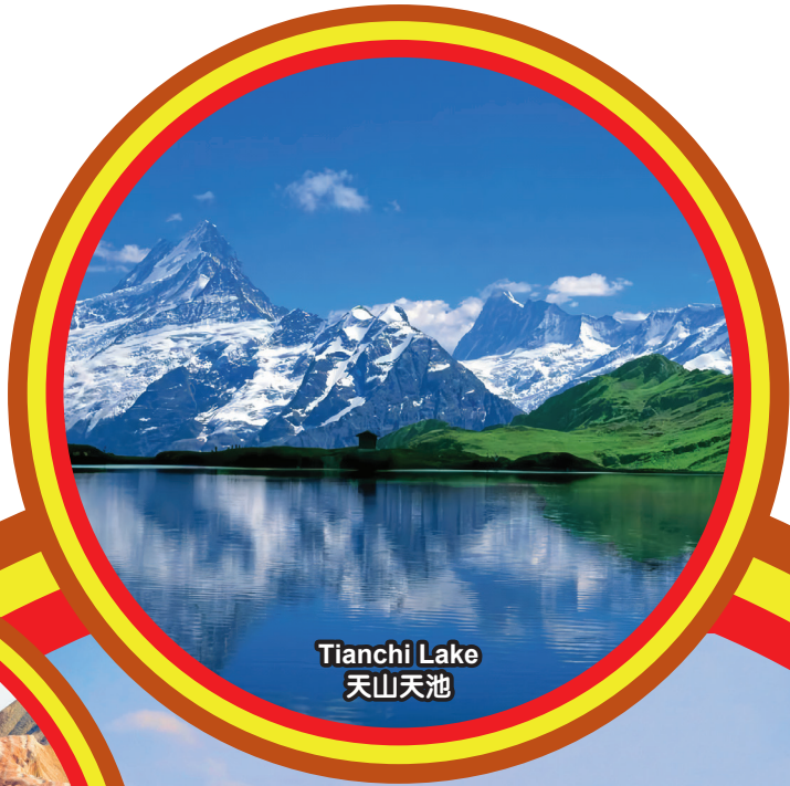
Tianchi Lake 天山天池

烤全羊风味 Roast Whole Lamb *Special Cuisine 特色美食* ***