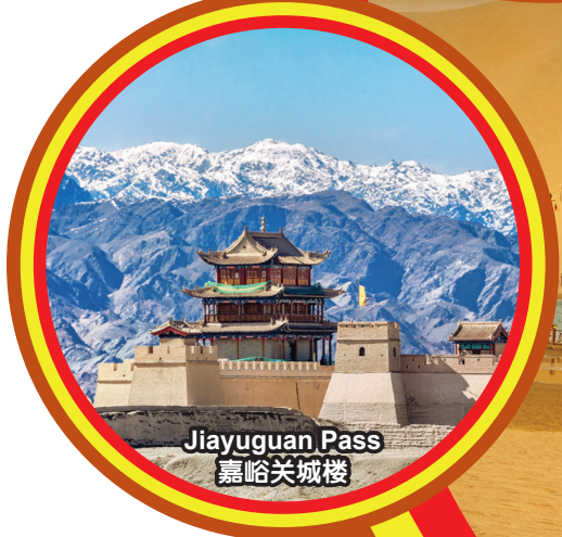
Jiayuguan Pass 嘉峪关城楼