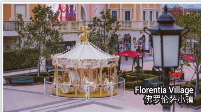
Florentia Village 佛罗伦萨小镇