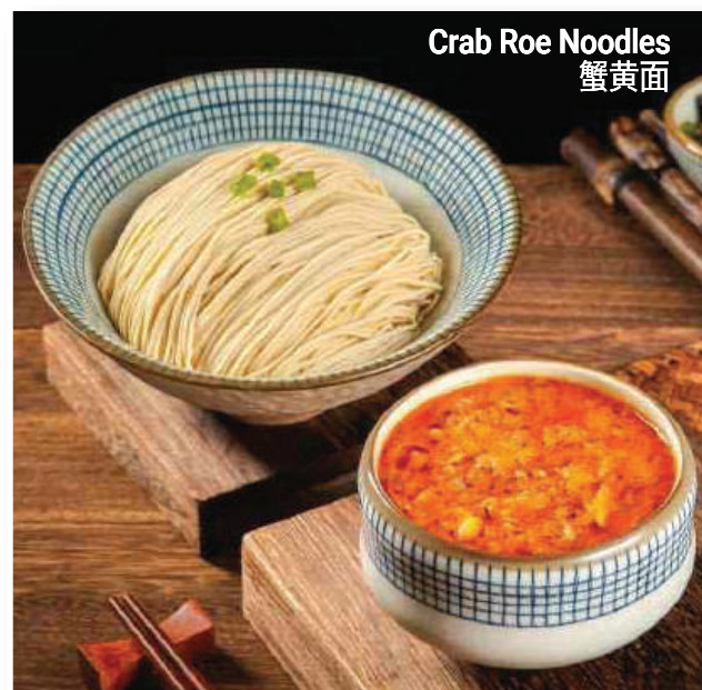
Crab Roe Noodles 蟹黄面