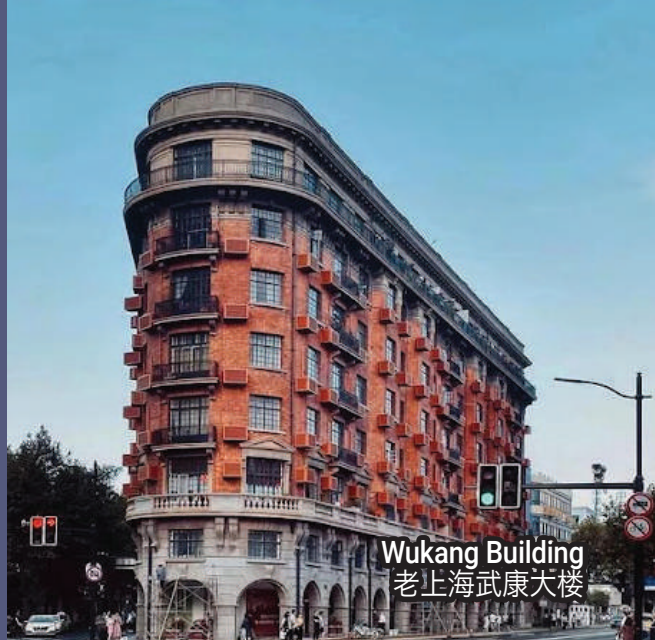
Wukang Building 老上海武康大楼