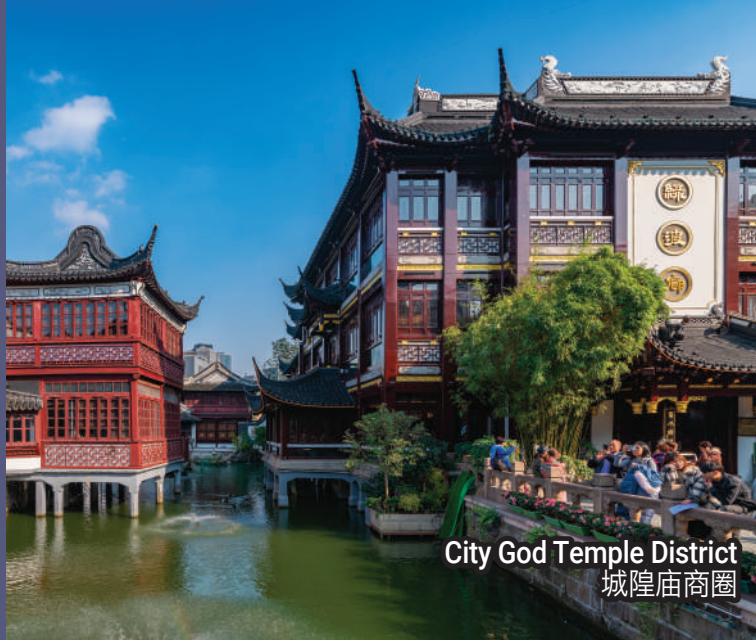
City God Temple District 城隍庙商圈