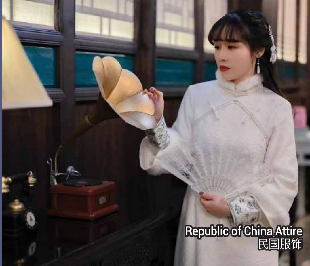
Republic of China Attire 民国服饰