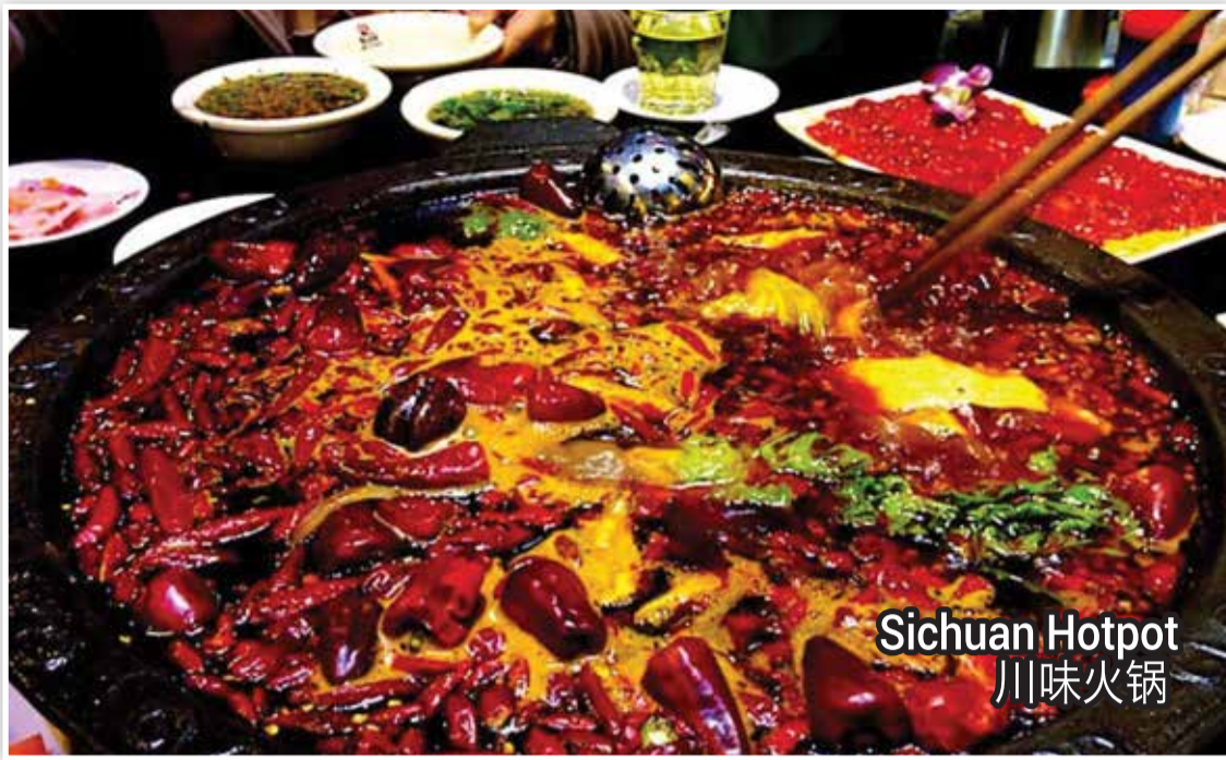
Sichuan Hotpot 川味火锅