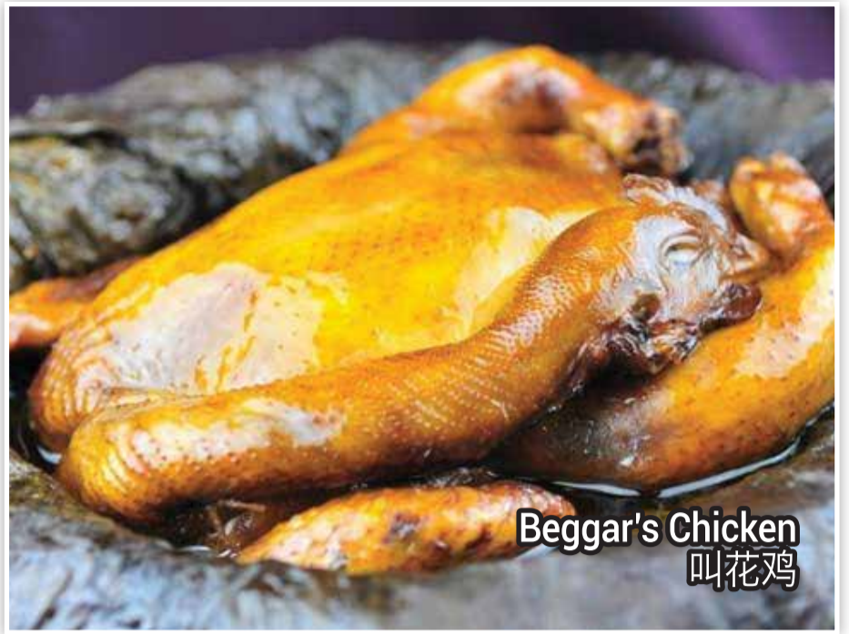
Beggar's Chicken 叫花鸡