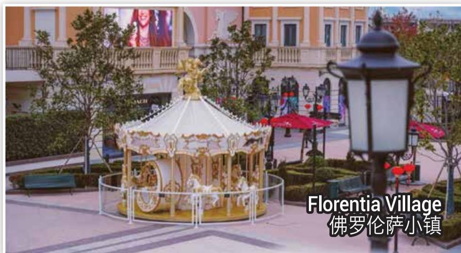
Florentia Village 佛罗伦萨小镇