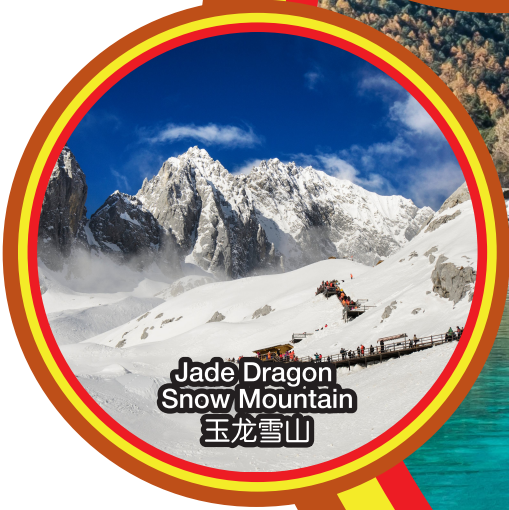
Jade Dragon Snow Mountain 玉龙雪山