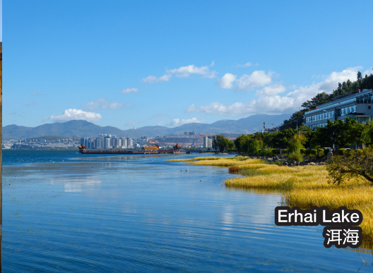
Erhai Lake 洱海