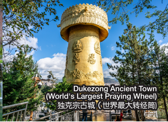
Dukezong Ancient Town (World's Largest Praying Wheel) 独克宗古城 (世界最大转经筒)