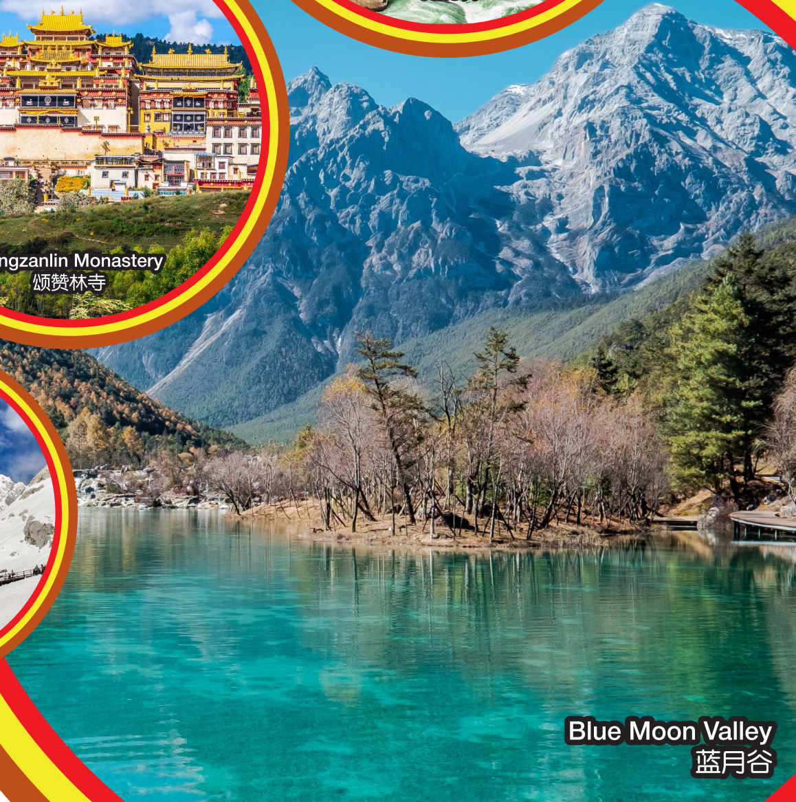
Blue Moon Valley 蓝月谷

行程次序，以当地旅社安排为准。 Sequences of Itinerary are subject to local arrangement.