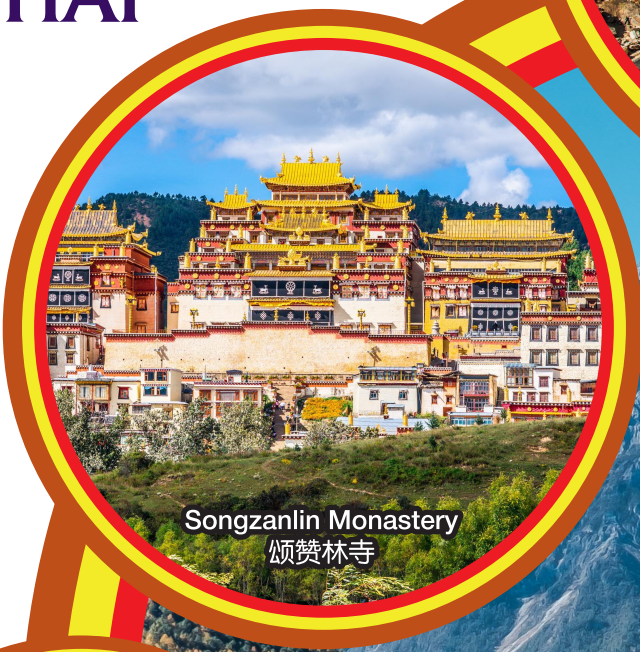
Songzanlin Monastery 颂赞林寺