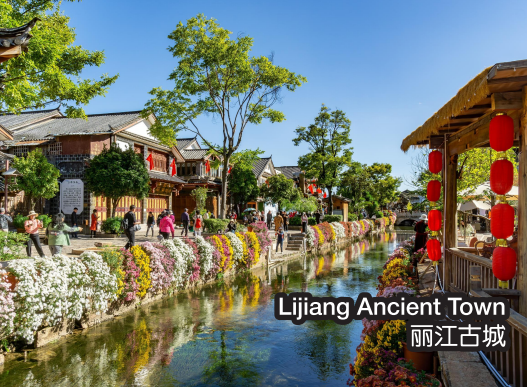
Lijiang Ancient Town 丽江古城