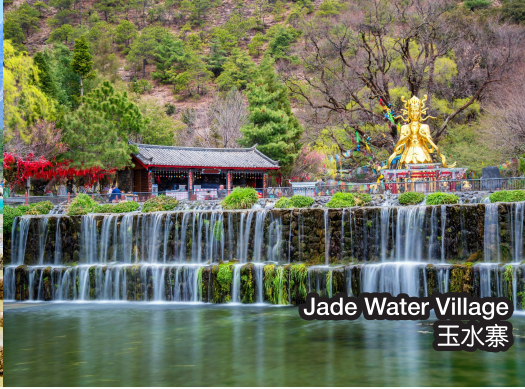
Jade Water Village 玉水寨