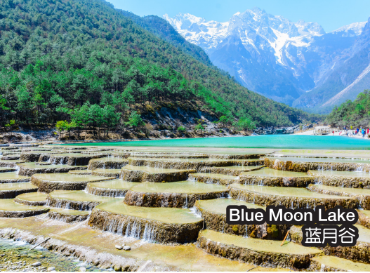
Blue Moon Lake 蓝月谷