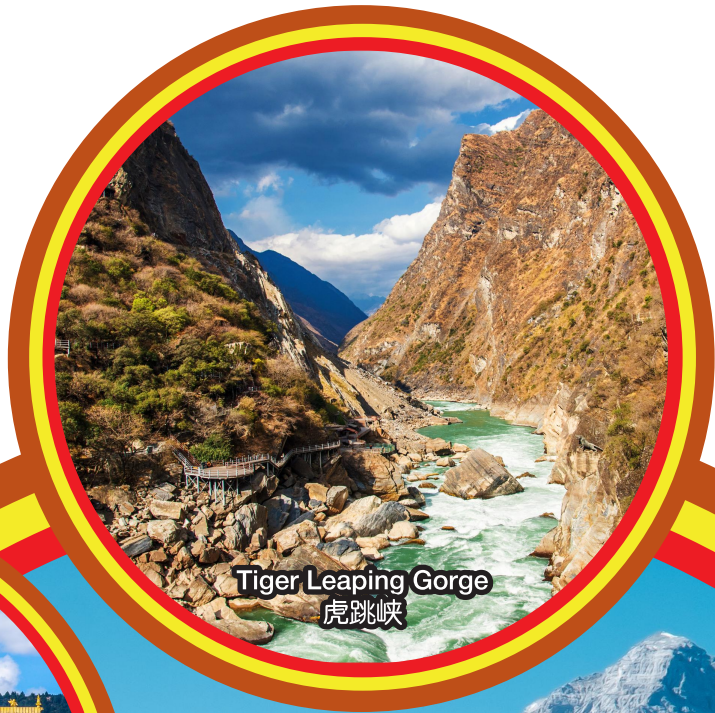
Tiger Leaping Gorge 虎跳峡