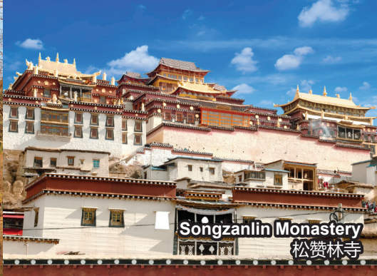
Songzanlin Monastery 松赞林寺