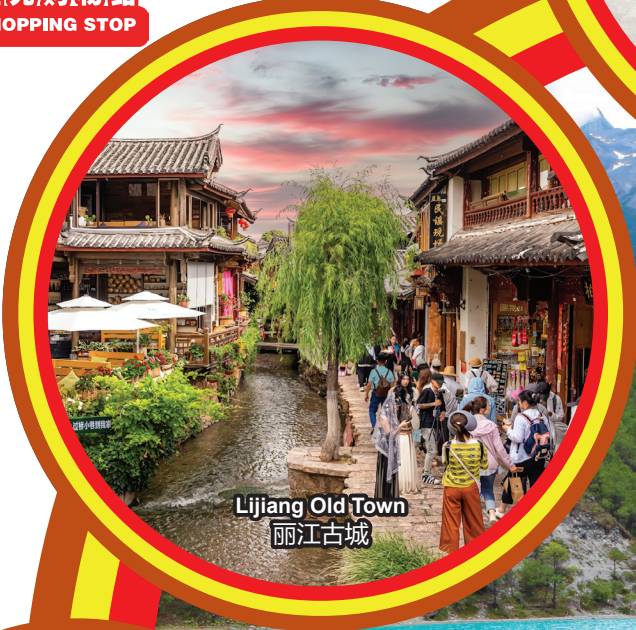
Lijiang Old Town 丽江古城