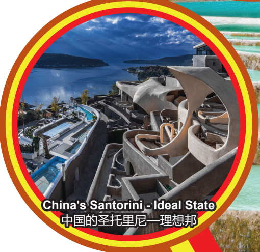
China's Santorini - Ideal State 中国的圣托里尼-理想邦