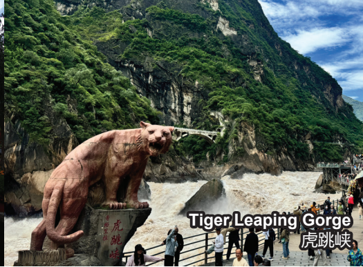
Tiger Leaping Gorge 虎跳峡