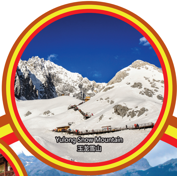
Yulong Snow Mountain 玉龙雪山