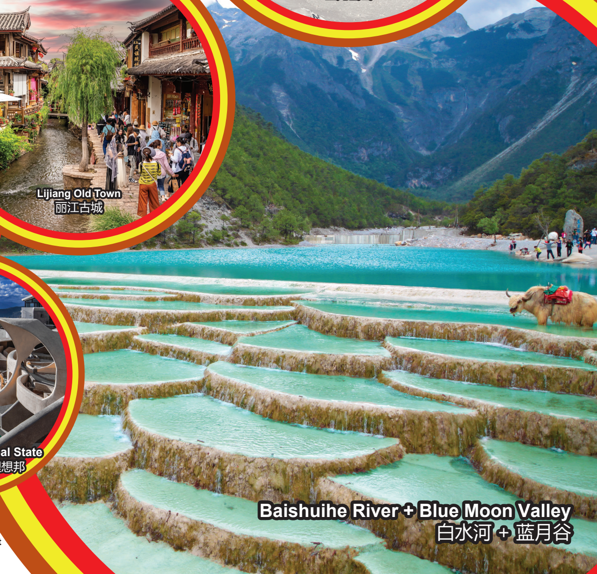
Baishuihe River + Blue Moon Valley 白水河 + 蓝月谷

行程次序, 以当地旅社安排为准。 Sequences of Itinerary are subject to local arrangement.