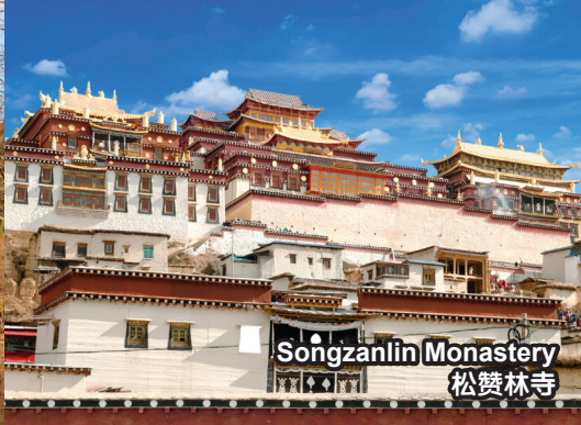
Songzanlin Monastery 松赞林寺