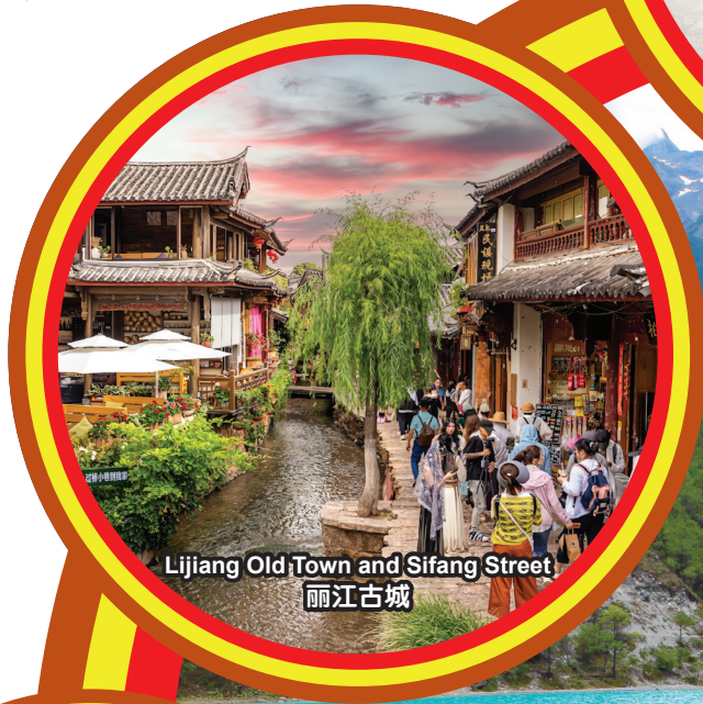
Lijiang Old Town and Sifang Street 丽江古城