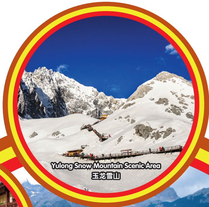
Yulong Snow Mountain Scenic Area 玉龙雪山