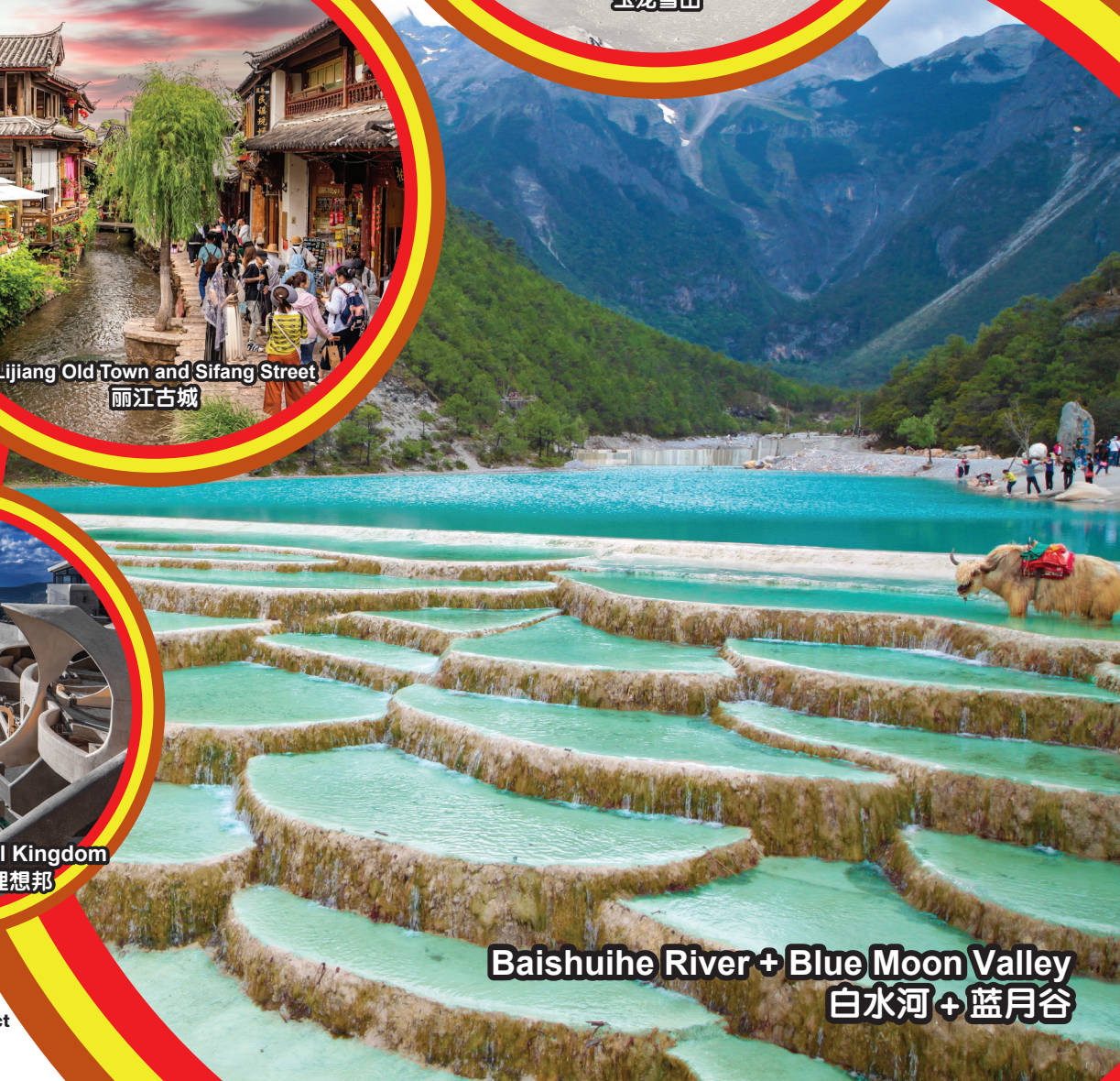
Baishuihe River + Blue Moon Valley 白水河 + 蓝月谷

行程次序, 以当地旅社安排为准。 Sequences of Itinerary are subject to local arrangement.