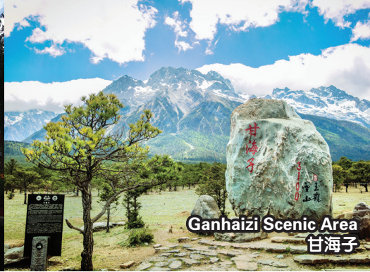
Ganhaizi Scenic Area 甘海子