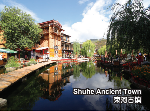
Shuhe Ancient Town 束河古镇