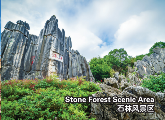
Stone Forest Scenic Area 石林风景区