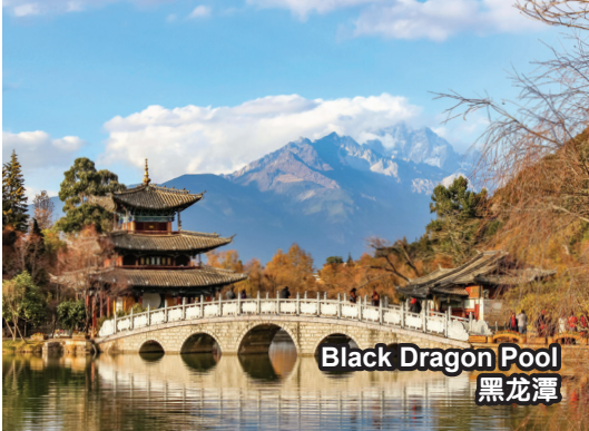
Black Dragon Pool 黑龙潭