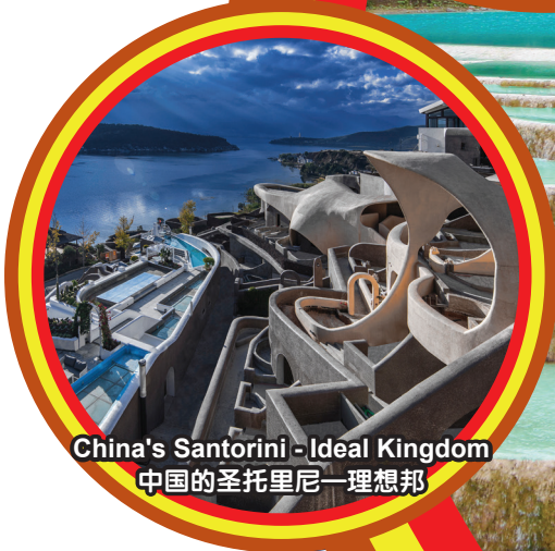
China's Santorini - Ideal Kingdom 中国的圣托里尼—理想邦