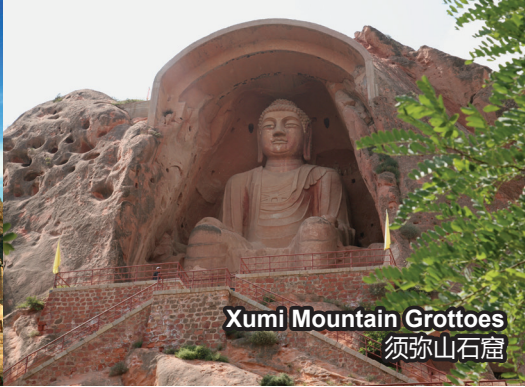
Xumi Mountain Grottoes 须弥山石窟