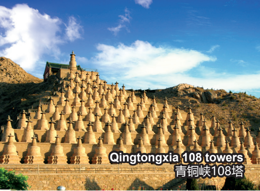
Qingtongxia 108 towers 青铜峡108塔