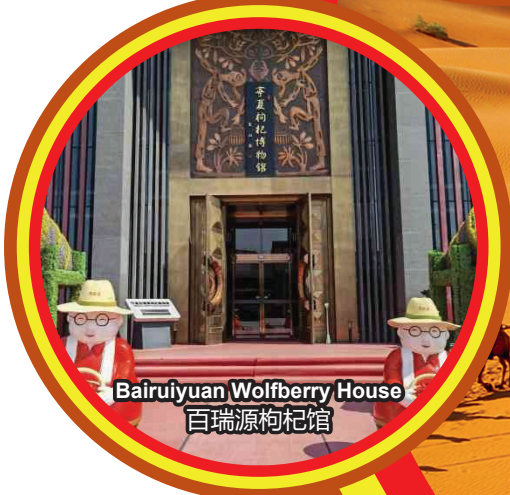
Bairuiyuan Wolfberry House 百瑞源枸杞馆