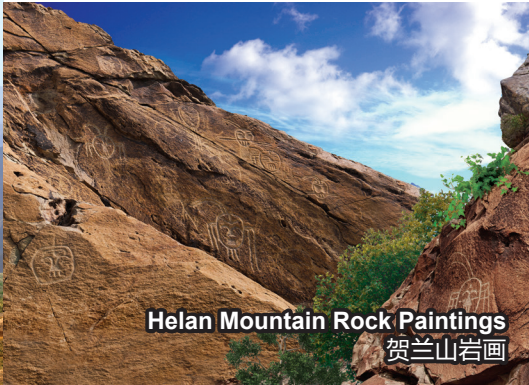
Helan Mountain Rock Paintings 贺兰山岩画