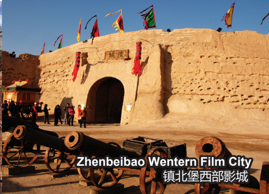
Zhenbeibao Western Film City 镇北堡西部影城