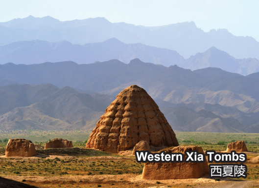
Western Xia Tombs 西夏陵