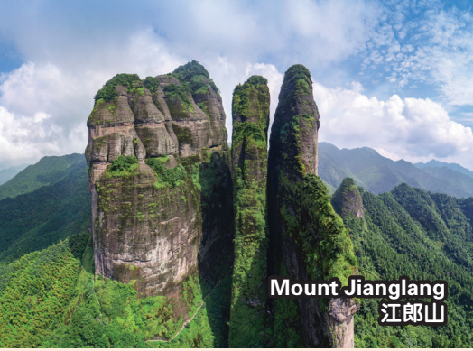
Mount Jiulang 江郎山