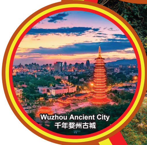
Wuzhou Ancient City 千年婺州古城