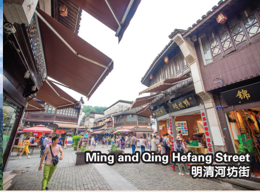
Ming and Qing Hefang Street 明清河坊街