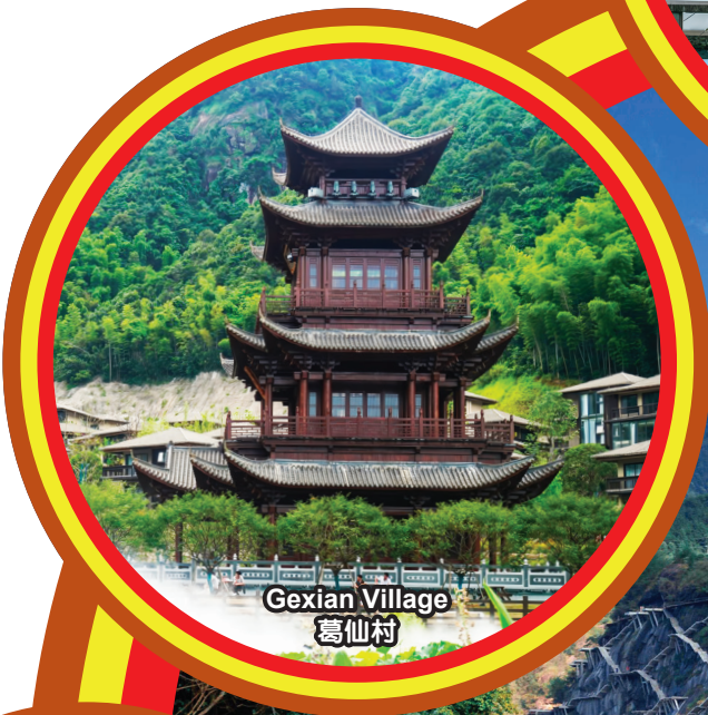
Gexian Village 葛仙村