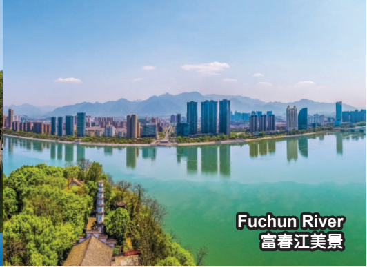
Fuchun River 富春江美景