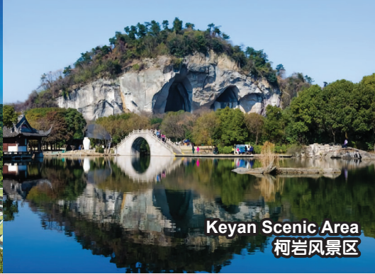
Keyan Scenic Area 柯岩风景区