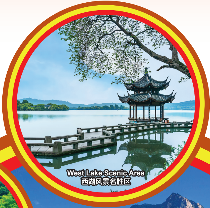
West Lake Scenic Area 西湖风景名胜區