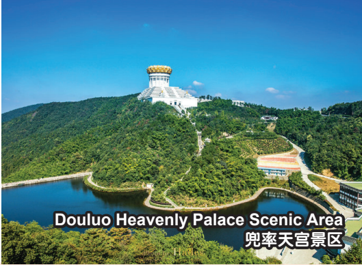
Douluo Heavenly Palace Scenic Area 兜率天宮景区