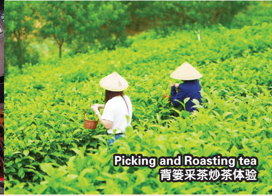
Picking and Roasting tea 背篓采茶炒茶体验