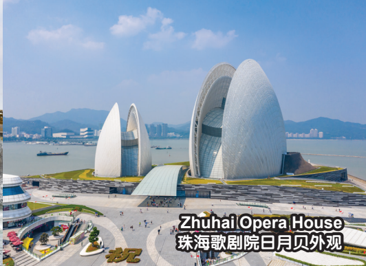
Zhuhai Opera House 珠海歌剧院日月贝外观