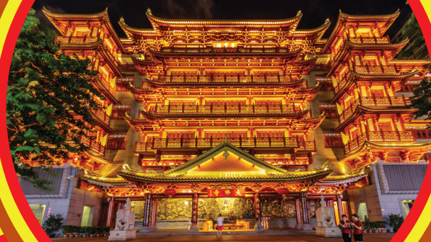
Grand Buddha Temple 大佛寺