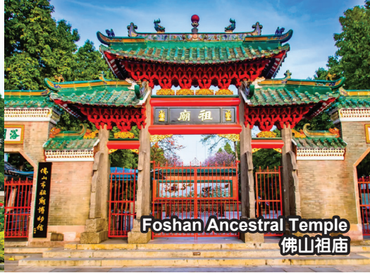
Foshan Ancestral Temple 佛山祖庙