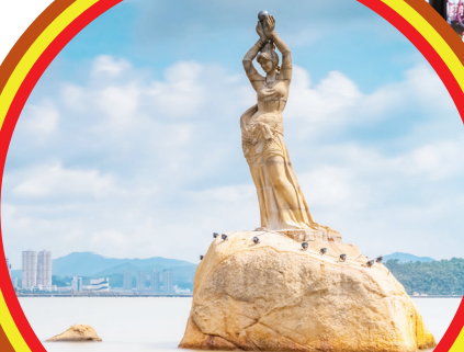
Fisher Girl Statue 渔女像