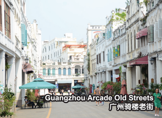
Guangzhou Arcade Old Streets 广州骑楼老街