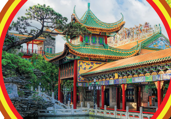
Shawan Ancient Town 沙湾古镇