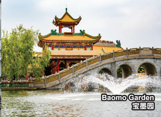
Baomo Garden 宝墨园