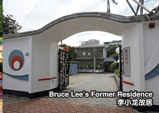
Bruce Lee's Former Residence 李小龍故居