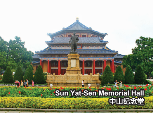
Sun Yat-Sen Memorial Hall 中山纪念堂