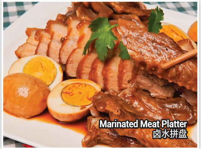
Marinated Meat Platter 卤水拼盘