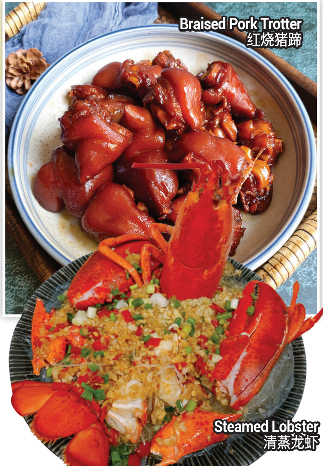
Braised Pork Trotter 红烧猪蹄