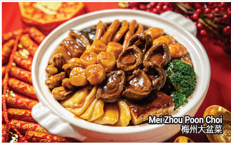
Mei Zhou Poon Choi 梅州大盆菜