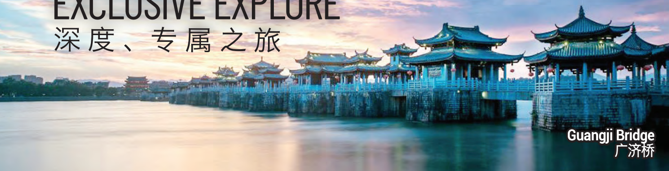
Guangji Bridge 广济桥