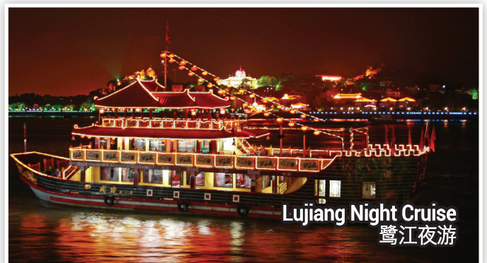
Lujiang Night Cruise 鹭江夜游