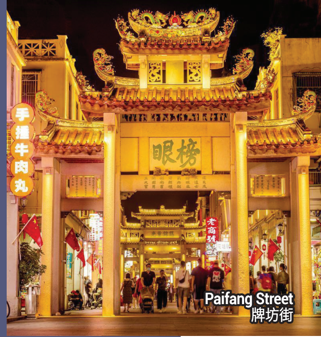
Paifang Street 牌坊街