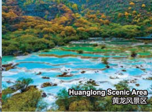
Huanglong Scenic Area 黄龙风景区