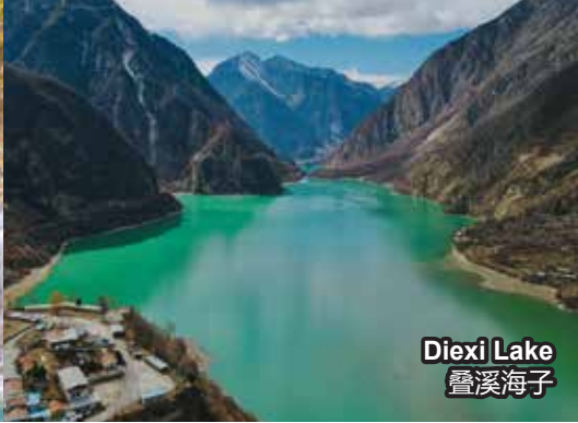
Diexi Lake 叠溪海子