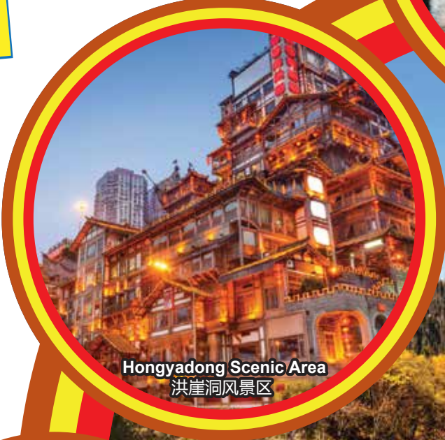
Hongyadong Scenic Area 洪崖洞风景区