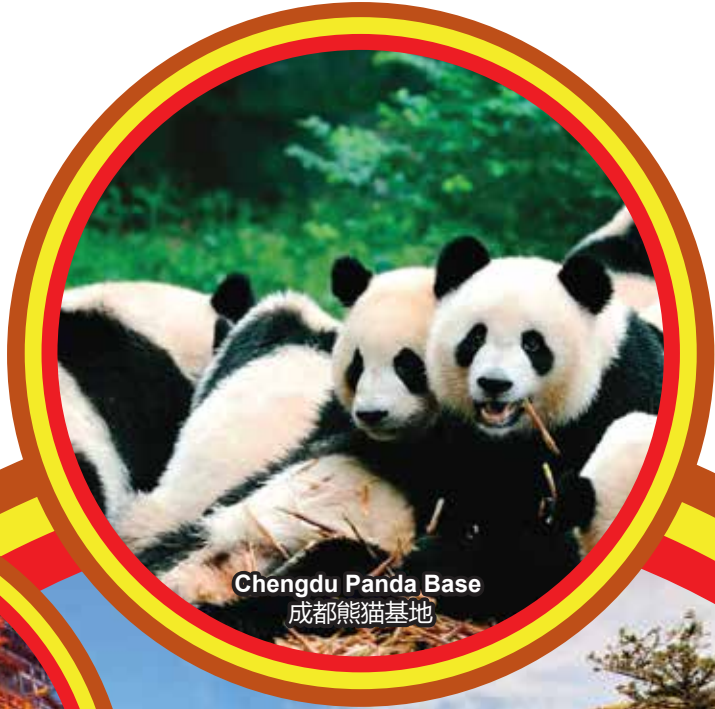
Chengdu Panda Base 成都熊猫基地