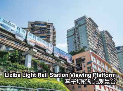
Liziba Light Rail Station Viewing Platform 李子坝轻轨站观景台