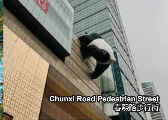
Chunxi Road Pedestrian Street 春熙路步行街