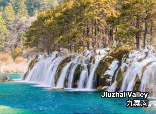
Jiuzhai Valley 九寨沟