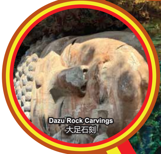
Dazu Rock Carvings 大足石刻