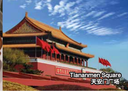
Tiananmen Square 天安门广场