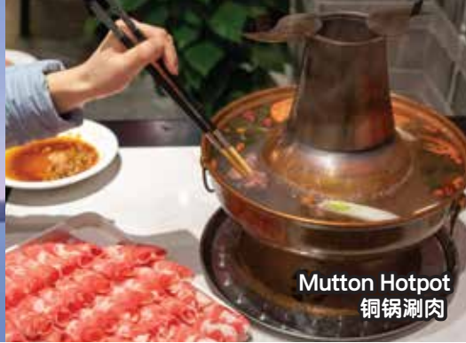
Mutton Hotpot 铜锅涮肉