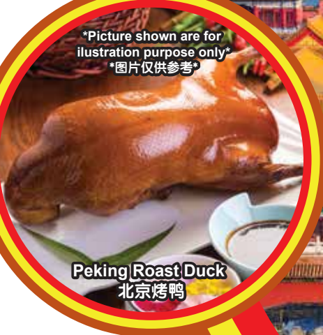
Peking Roast Duck 北京烤鸭

*Picture shown are for illustration purpose only* *图片仅供参考*