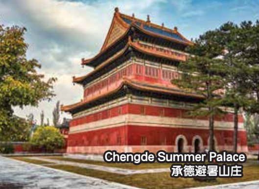
Chengde Summer Palace 承德避暑山庄