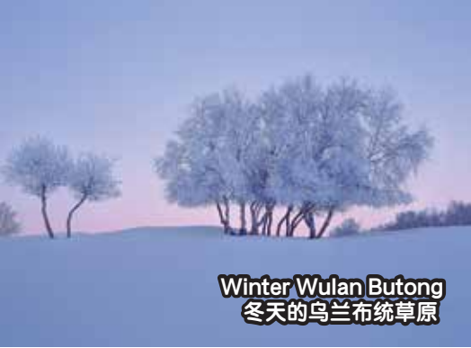
Winter Wulan Butong 冬天的乌兰布统草原