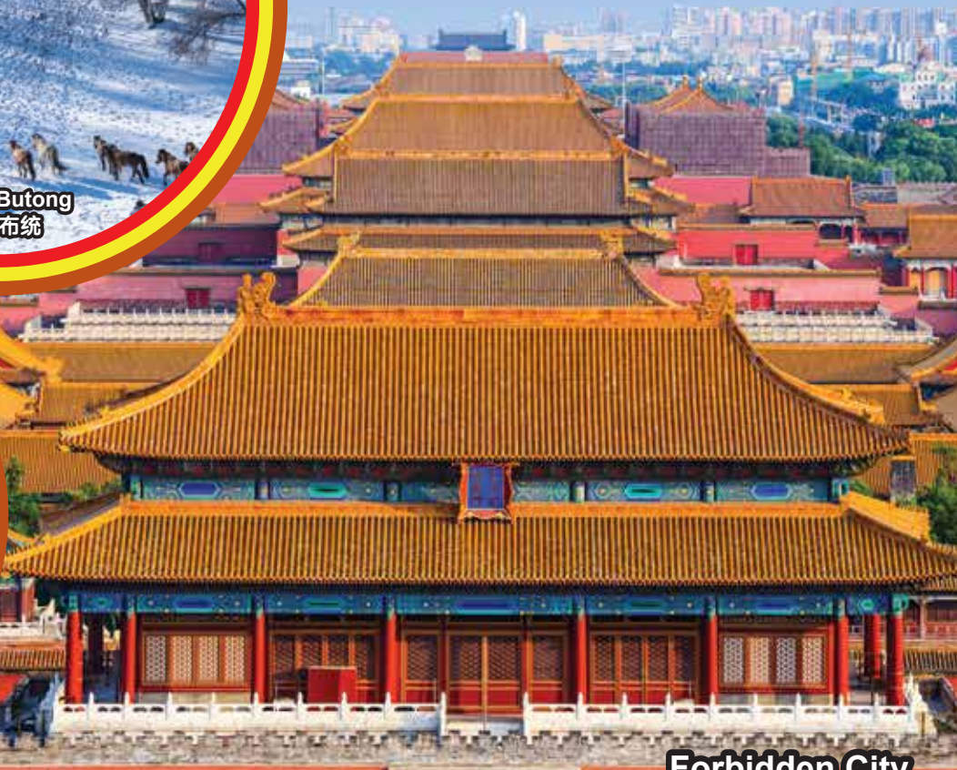
Forbidden City 故宫

行程次序，以当地旅社安排为准。 Sequences of Itinerary are subject to local arrangement.