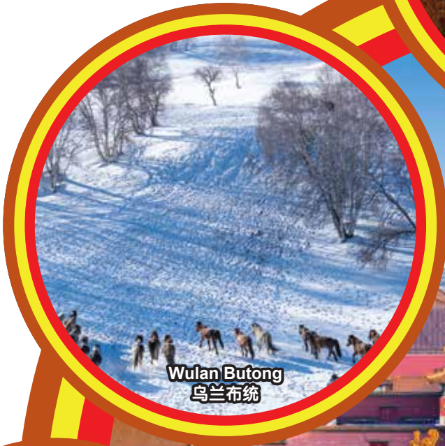
Wulan Butong 乌兰布统

*Picture shown are for illustration purpose only* *图片仅供参考*