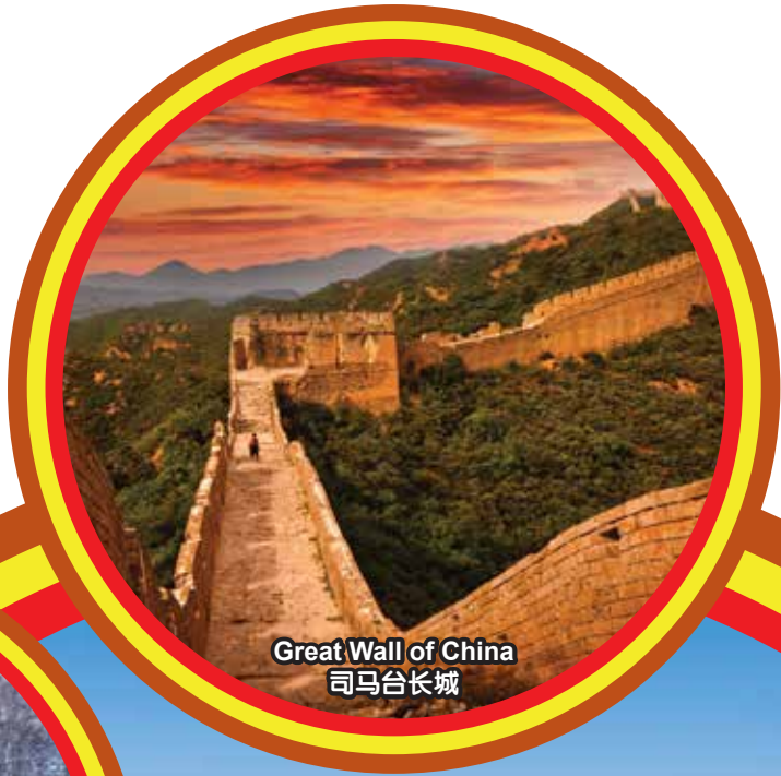
Great Wall of China 司马台长城