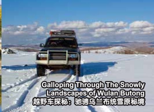
Galloping Through The Snowy Landscapes Of Wulan Butong 越野车探秘：驰骋乌兰布统雪原秘境