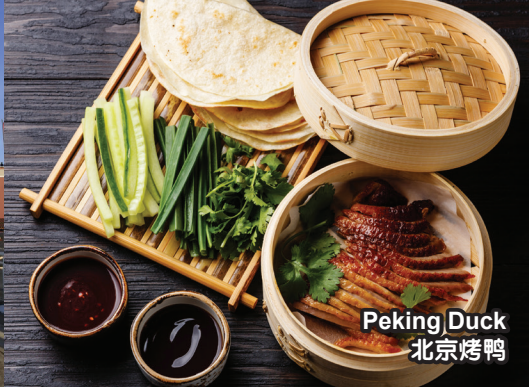
Peking Duck 北京烤鸭