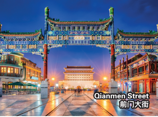
Qianmen Street 前门大街