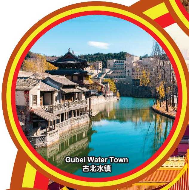
Gubei Water Town 古北水镇