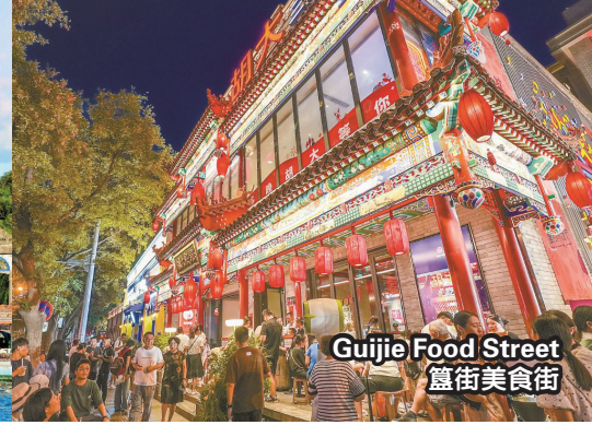
Guijie Food Street 簋街美食街