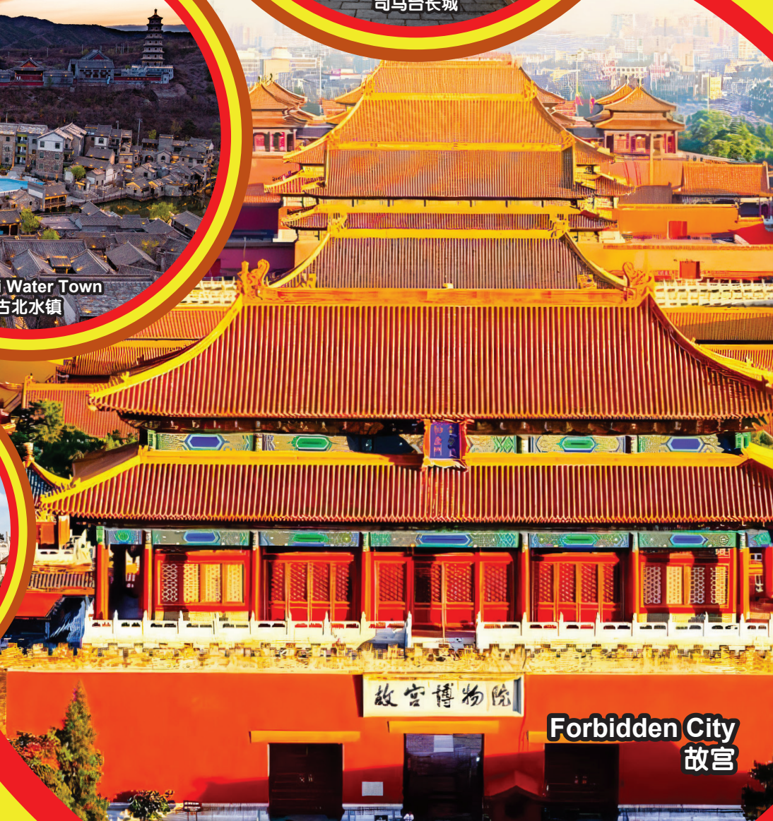
Forbidden City 故宫

行程次序，以当地旅社安排为准。 Sequences of Itinerary are subject to local arrangement.