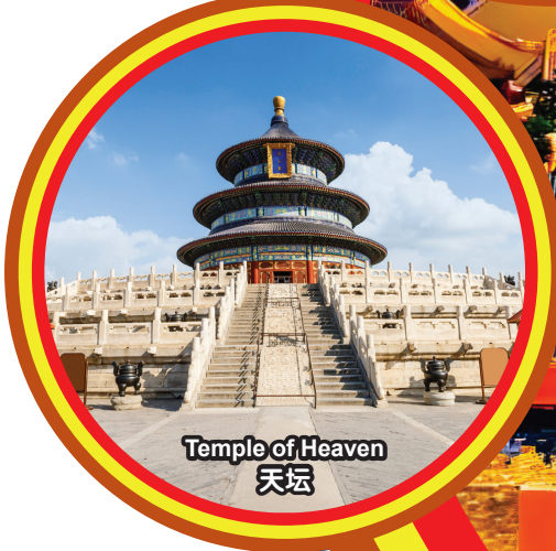
Temple of Heaven 天坛