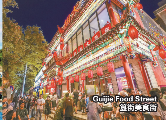
Guijie Food Street 簋街美食街