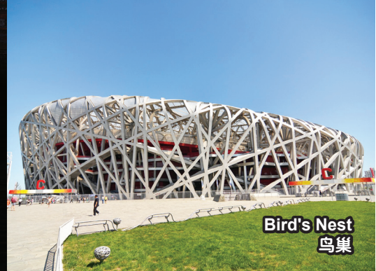
Bird's Nest 鸟巢