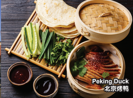
Peking Duck 北京烤鸭