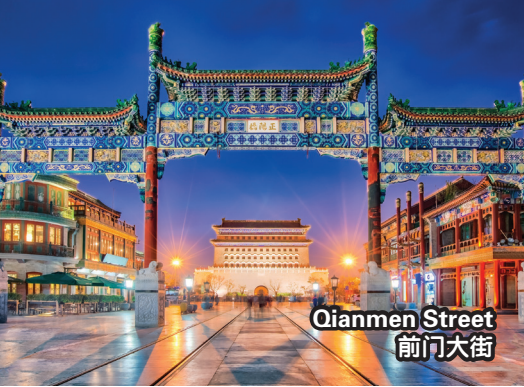
Qianmen Street 前门大街