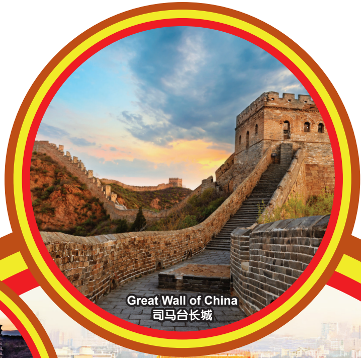
Great Wall of China 司马台长城