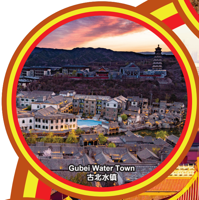
Gubei Water Town 古北水镇