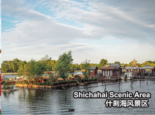
Shichahai Scenic Area 什刹海风景区