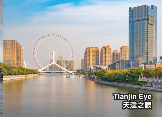
Tianjin Eye 天津之眼