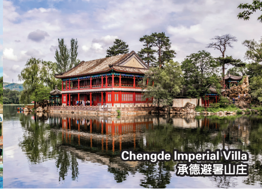
Chengde Imperial Villa 承德避暑山庄