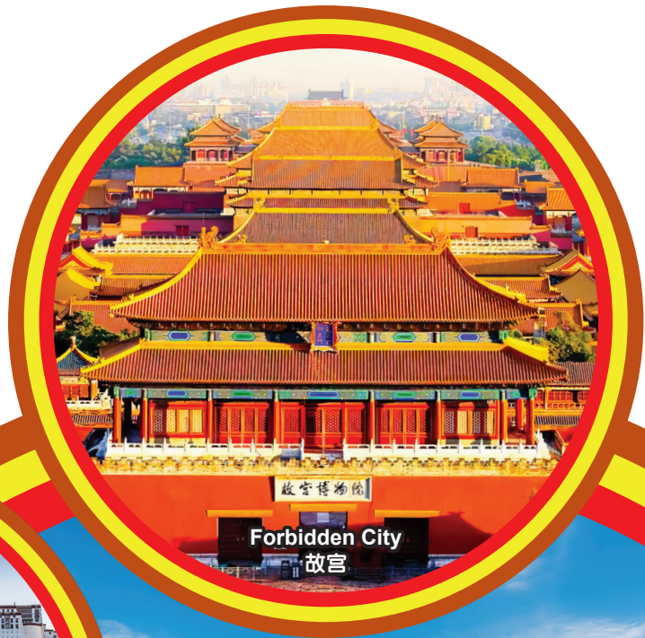
故宫博物院 Forbidden City 故宫