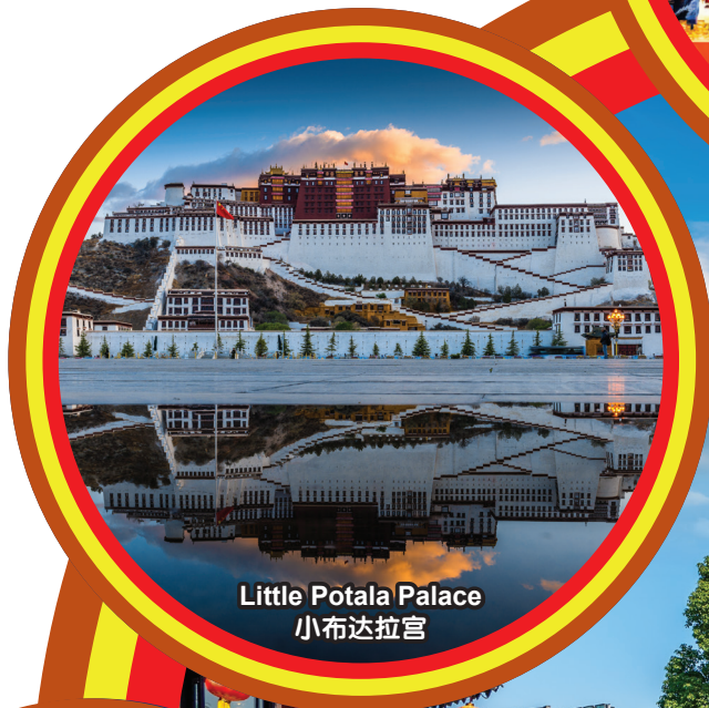
Little Potala Palace 小布达拉宫