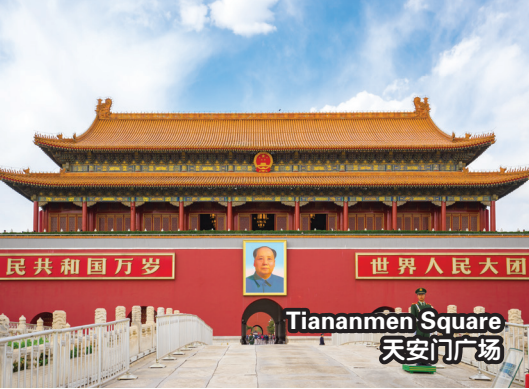
Tiananmen Square 天安门广场