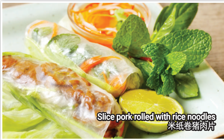
Slice pork rolled with rice noodles 米纸卷猪肉片