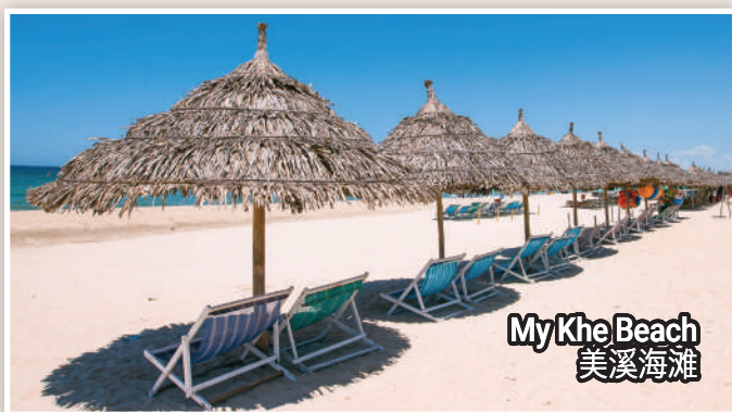
My Khe Beach 美溪海滩