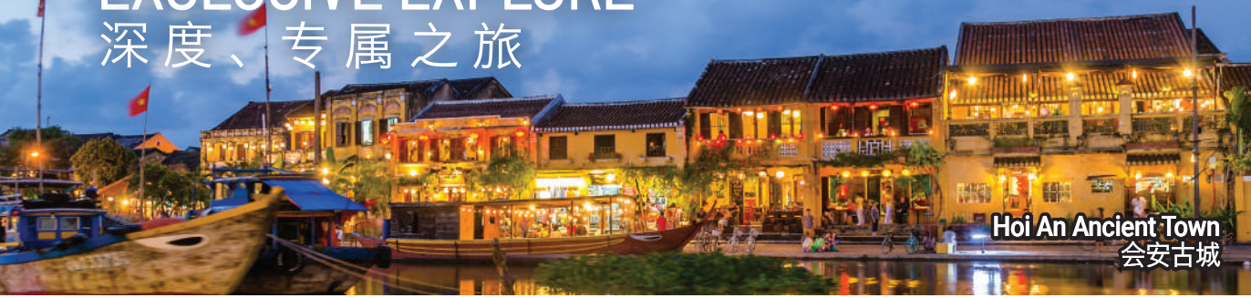
Hoi An Ancient Town 会安古城