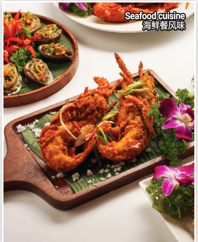
Seafood cuisine 海鲜餐风味