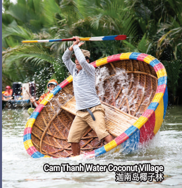
Cam Thanh Water Coconut Village 迦南岛椰子林