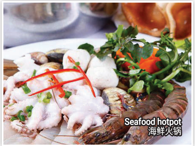
Seafood hotpot 海鲜火锅