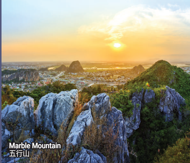
Marble Mountain 五行山