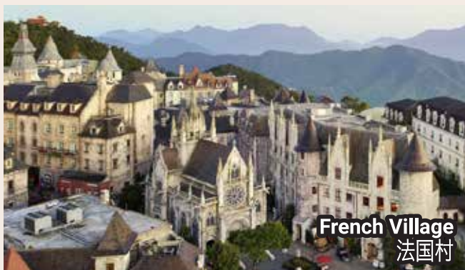
French Village 法国村