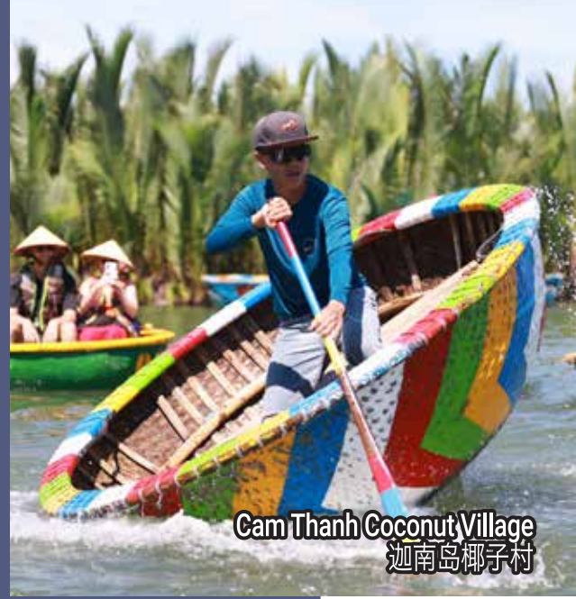
Cam Thanh Coconut Village 迦南岛椰子村