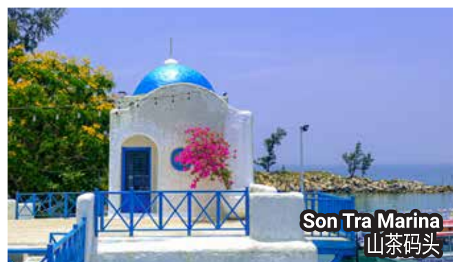
Son Tra Marina 山茶码头