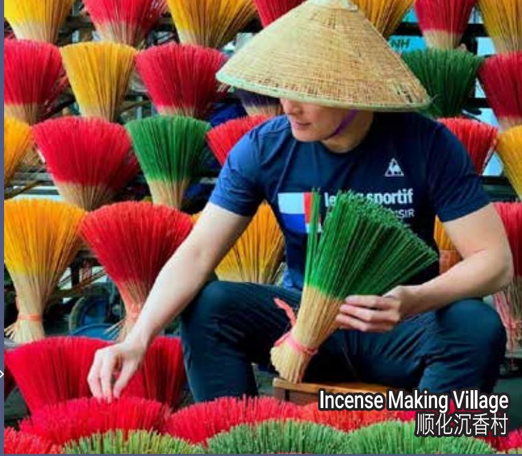
Incense Making Village 顺化沉香村