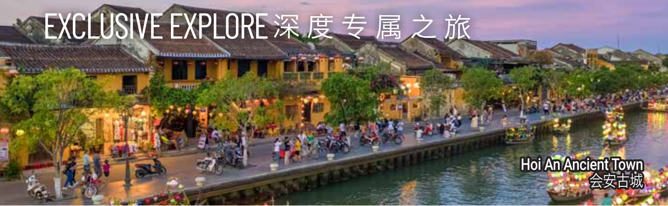
Hoi An Ancient Town 会安古城