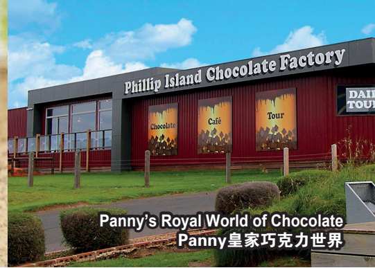
Panny's Royal World of Chocolate Panny皇家巧克力世界