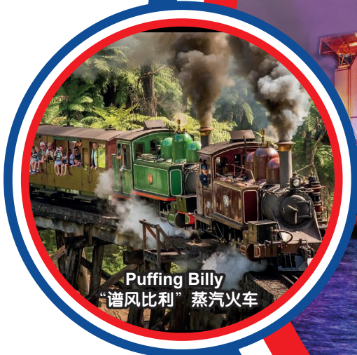
Puffing Billy “谱风比利”蒸汽火车