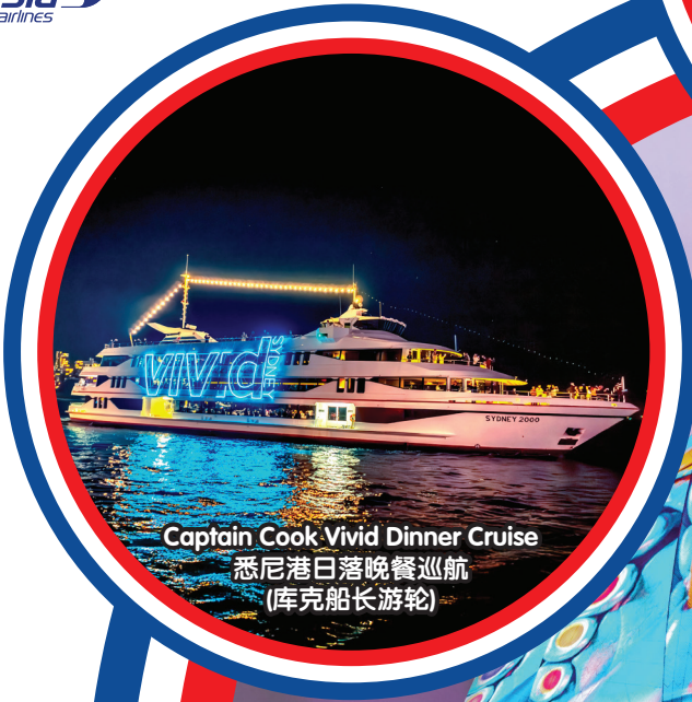
Captain Cook Vivid Dinner Cruise 悉尼港日落晚餐巡航 (库克船长游轮)