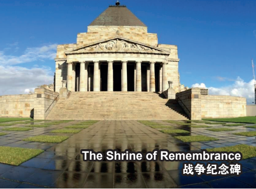
The Shrine of Remembrance 战争纪念碑