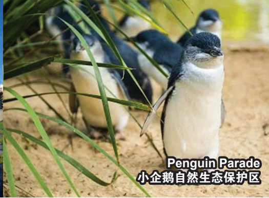
Penguin Parade 小企鹅自然生态保护区