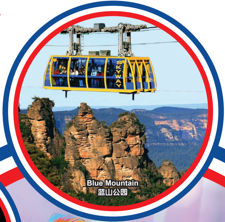
Blue Mountain 蓝山公园