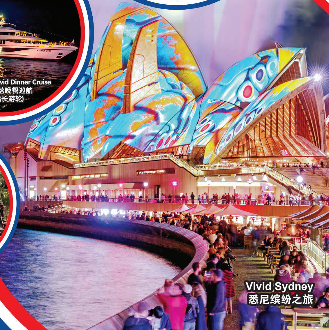
Vivid Sydney 悉尼缤纷之旅

行程次序，以当地旅社安排为准。 Sequences of Itinerary are subject to local arrangement.