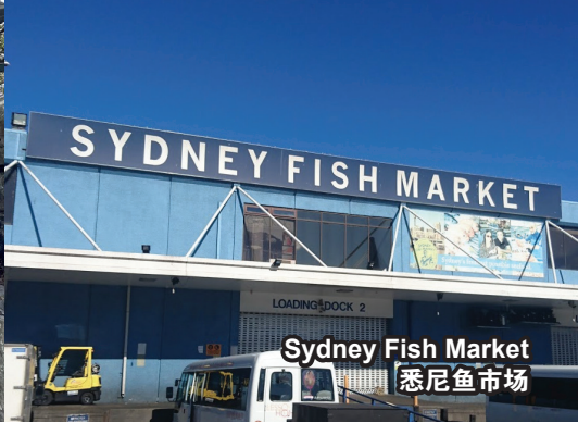
Sydney Fish Market 悉尼鱼市场