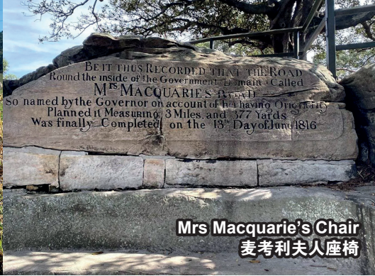
Mrs Macquarie's Chair 麦考利夫人座椅