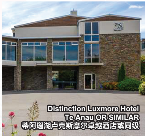
Distinction Luxmore Hotel Te Anau OR SIMILAR 蒂阿瑙湖卢克斯摩尔卓越酒店或同级