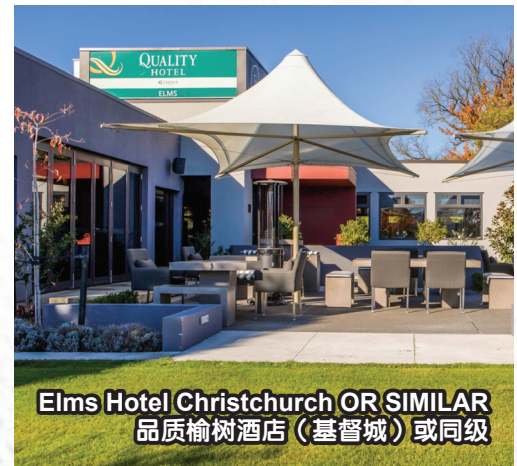
Elms Hotel Christchurch OR SIMILAR 品质榆树酒店（基督城）或同级