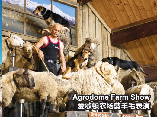
Agrodome Farm Show 爱歌顿农场剪羊毛表演