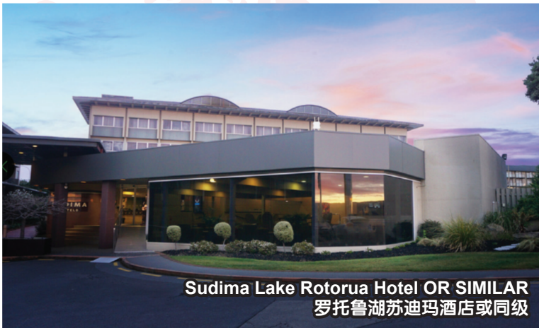
Sudima Lake Rotorua Hotel OR SIMILAR 罗托鲁湖苏迪玛酒店或同级