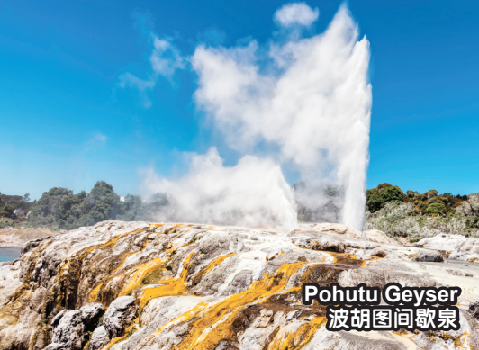
Pohutu Geyser 波胡图间歇泉