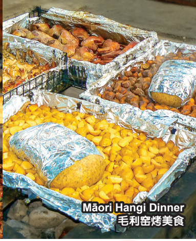
Māori Hangi Dinner 毛利窑烤美食