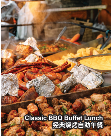
Classic BBQ Buffet Lunch 经典烧烤自助餐