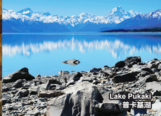
Lake Pukaki 普卡基湖