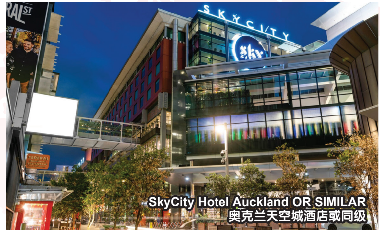
SkyCity Hotel Auckland OR SIMILAR 奥克兰天空城酒店或同级