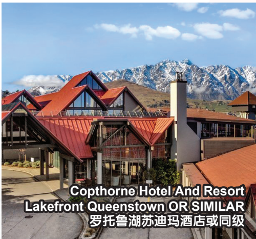
Copthorne Hotel And Resort Lakefront Queenstown OR SIMILAR 罗托鲁湖苏迪玛酒店或同级