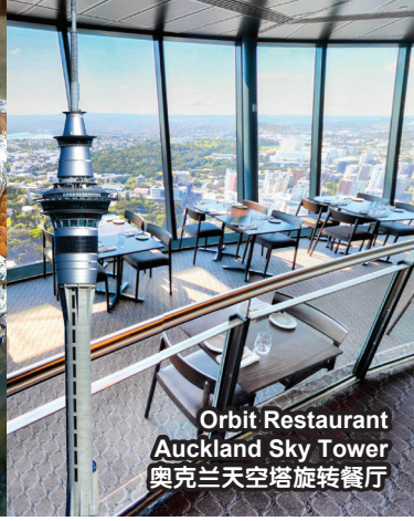
Orbit Restaurant Auckland Sky Tower 奥克兰天空塔旋转餐厅