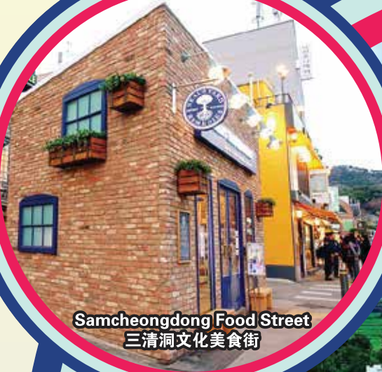
Samcheongdong Food Street 三清洞文化美食街