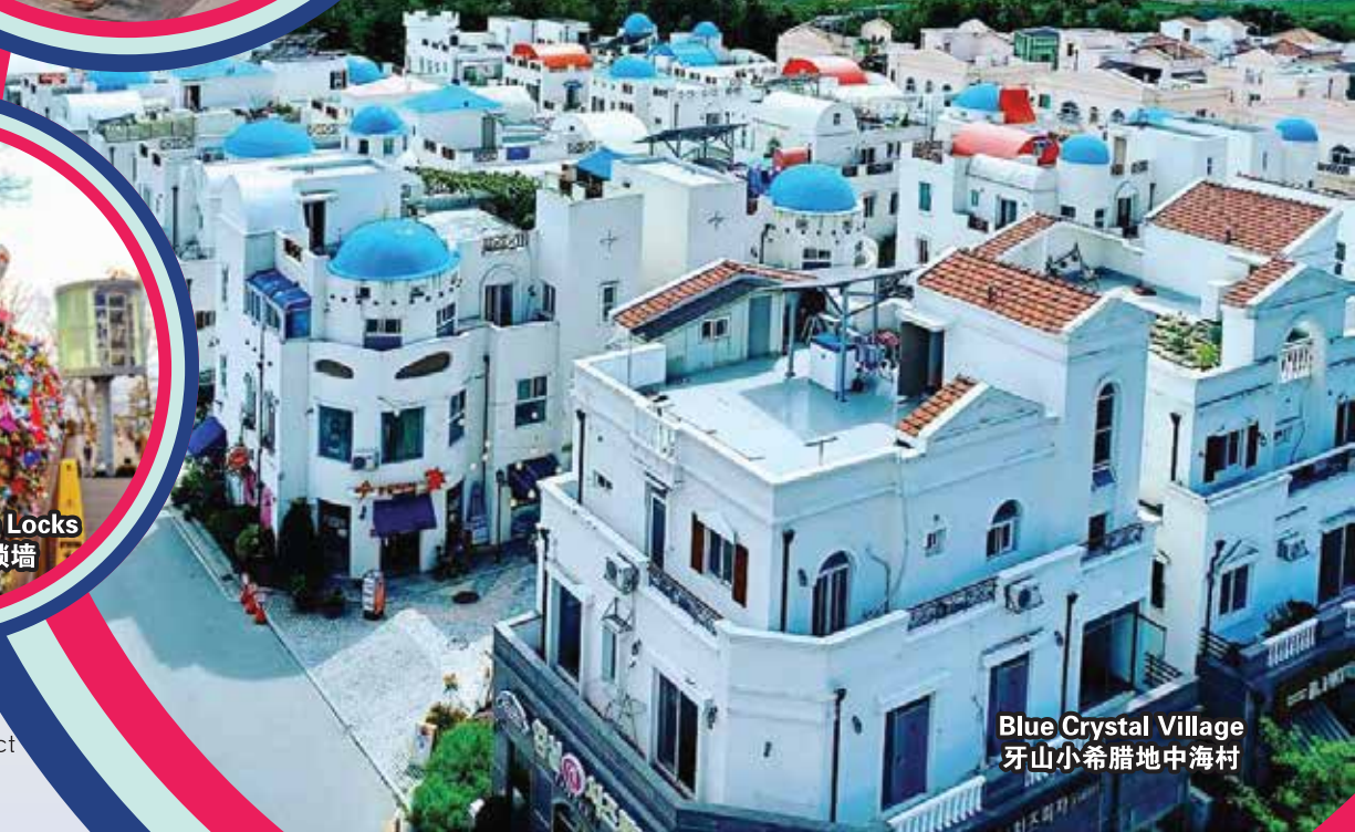
Blue Crystal Village 牙山小希腊地中海村

行程次序，以当地旅社安排为准。 Sequences of Itinerary are subject to local arrangement.