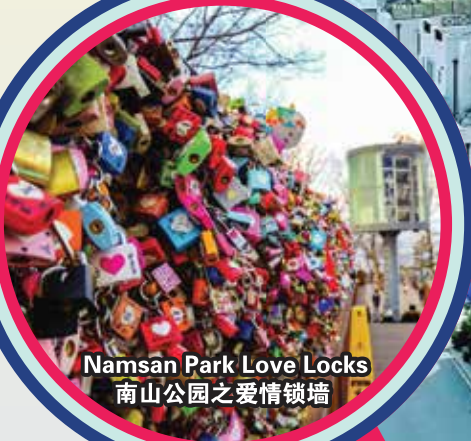
Namsan Park Love Locks 南山公园之爱情锁墙