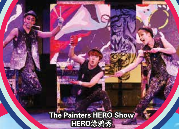
The Painters HERO Show HERO 涂鸦秀