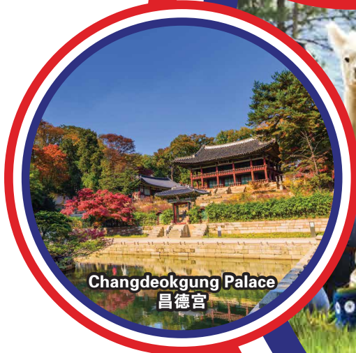
Changdeokgung Palace 昌德宫