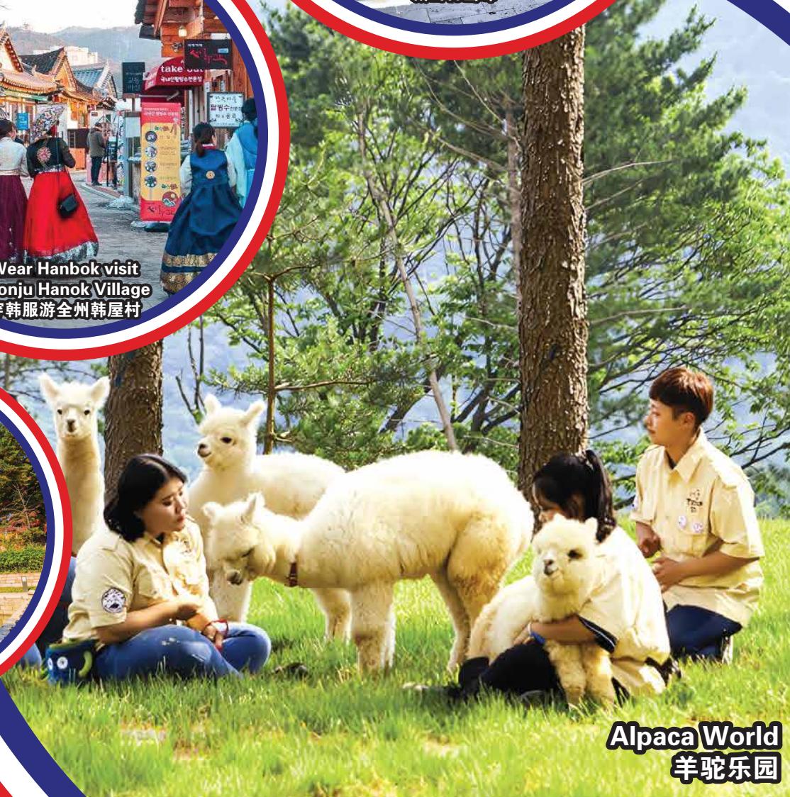
Alpaca World 羊驼乐园

行程次序，以當地旅社安排為準。 Sequences of Itinerary are subject to local arrangement.