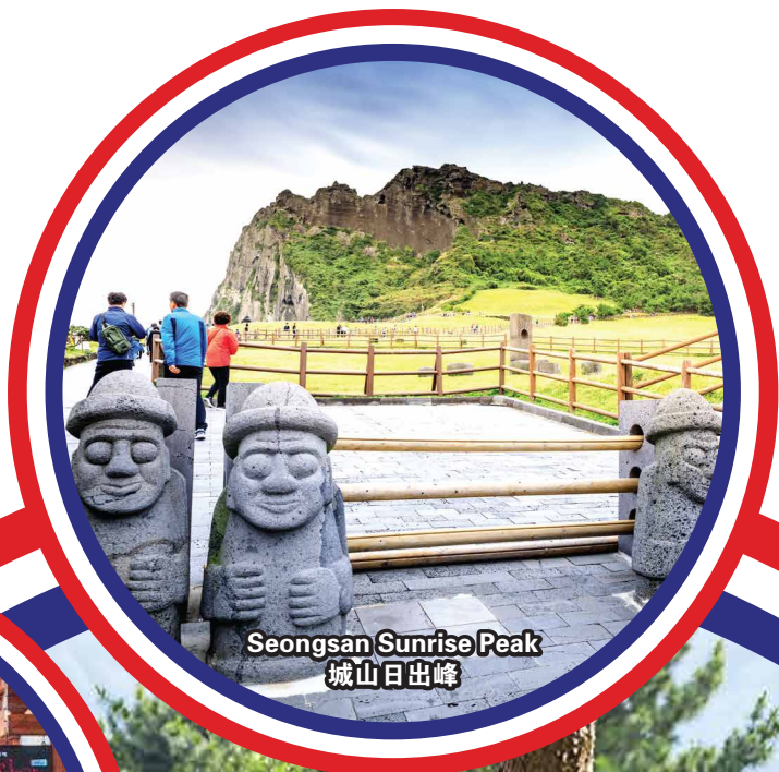
Seongsan Sunrise Peak 城山日出峰