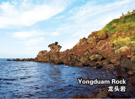
Yongduam Rock 龙头岩