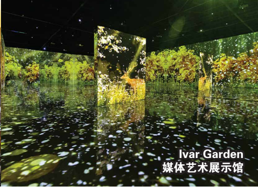
Ivar Garden 媒体艺术展示馆