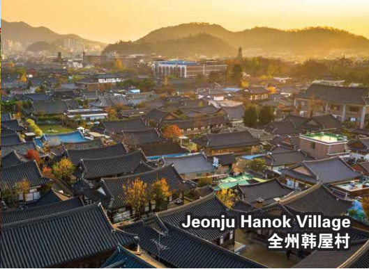
Jeonju Hanok Village 全州韩屋村