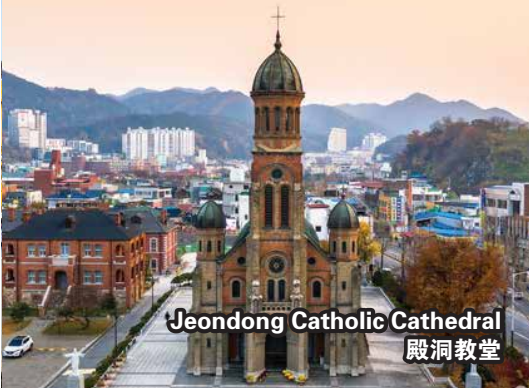
Jeondong Catholic Cathedral 殿洞教堂