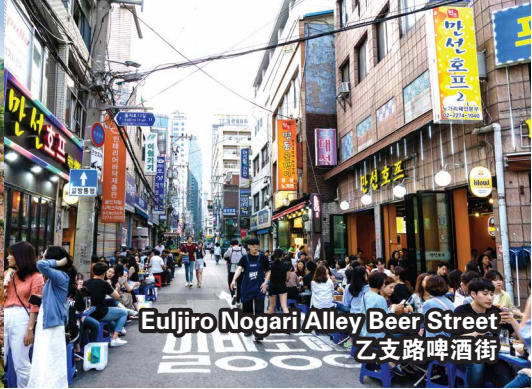
Euljiro Nogari Alley Beer Street 乙支路啤街