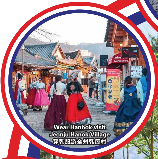
Wear Hanbok visit Jeonju Hanok Village 穿韩服游全州韩屋村