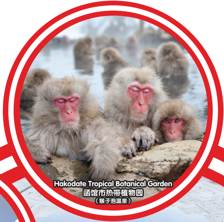
Hakodate Tropical Botanical Garden 函馆市热带植物园 (猴子泡温泉)