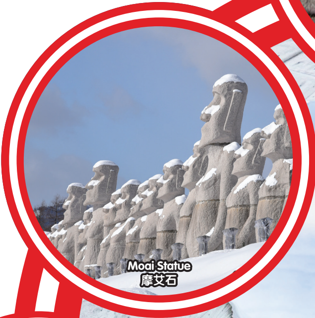
Moai Statue 摩艾石