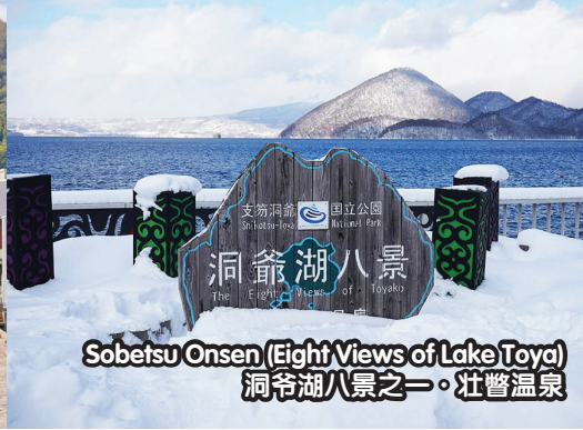
Sobetsu Onsen (Eight Views of Lake Toya) 洞爷湖八景之一·狂誓温泉