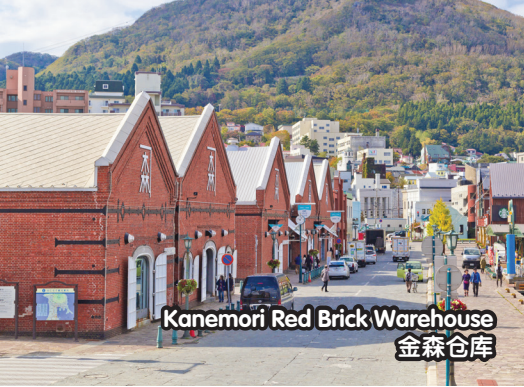
Kanemori Red Brick Warehouse 金森仓库