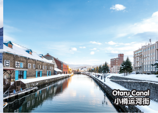
Otaru Canal 小樽运河街