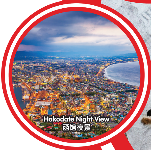
Hakodate Night View 函馆夜景