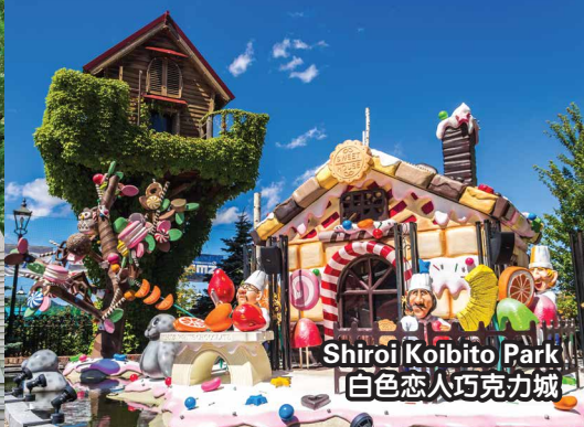
Shiroi Koibito Park 白色恋人巧克力城