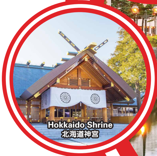
Hokkaido Shrine 北海道神宫