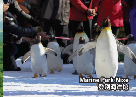
Marine Park Nixe 登別海洋館