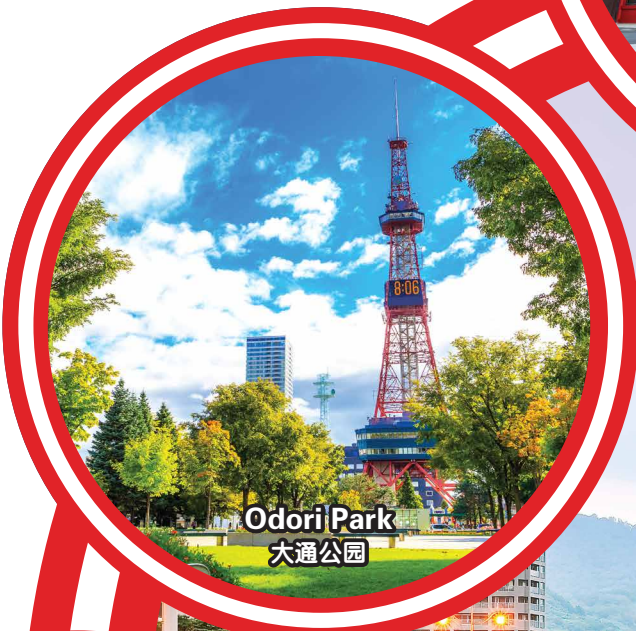
Odori Park 大通公园