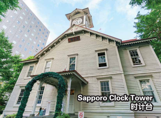
Sapporo Clock Tower 時計台