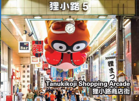
Tanukikoji Shopping Arcade 狸小路商店街