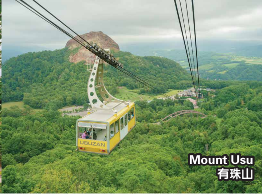
Mount Usu 有珠山