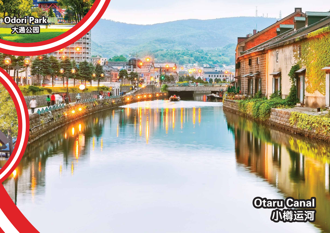
Otaru Canal 小樽运河

行程次序，以當地旅社安排為準。 Sequences of Itinerary are subject to local arrangement.