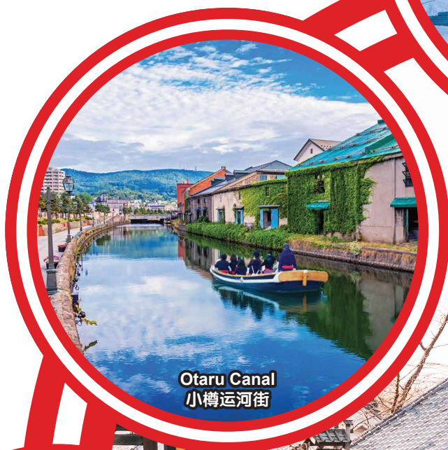
Otaru Canal 小樽运河街