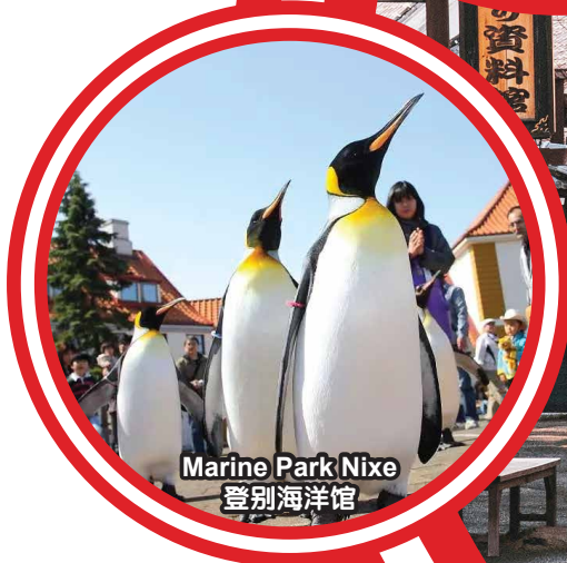
Marine Park Nixe 登别海洋馆