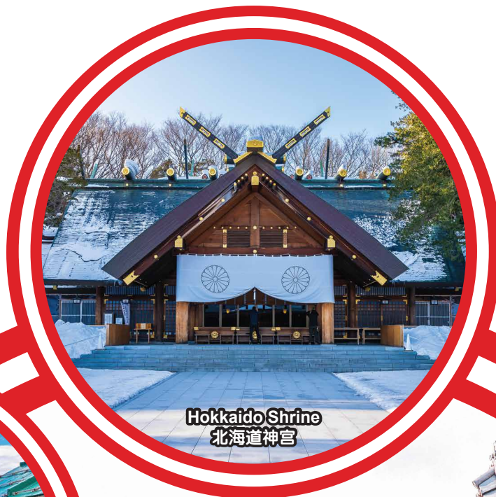
Hokkaido Shrine 北海道神宮