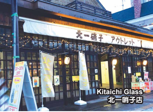
Kitaichi Glass 北一硝子店