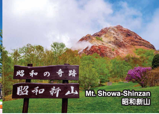
Mt. Showa-Shinzan 昭和神山