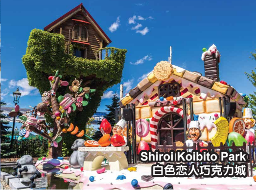
Shiroi Koibito Park 白色恋人巧克力城