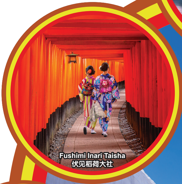
Fushimi Inari Taisha 伏见稻荷大社