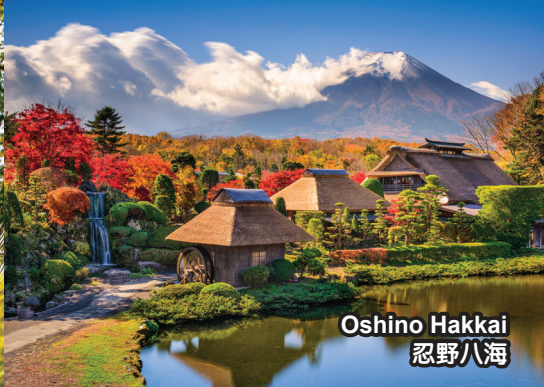
Oshino Hakkai 忍野八海