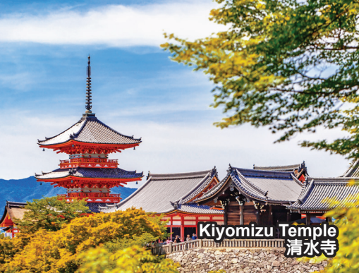
Kiyomizu Temple 清水寺