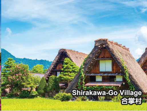
Shirakawa-Go Village 合掌村