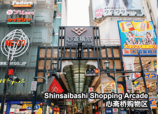
Shinsaibashi Shopping Arcade 心斋桥购物区