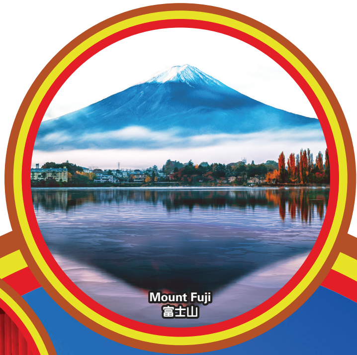
Mount Fuji 富士山