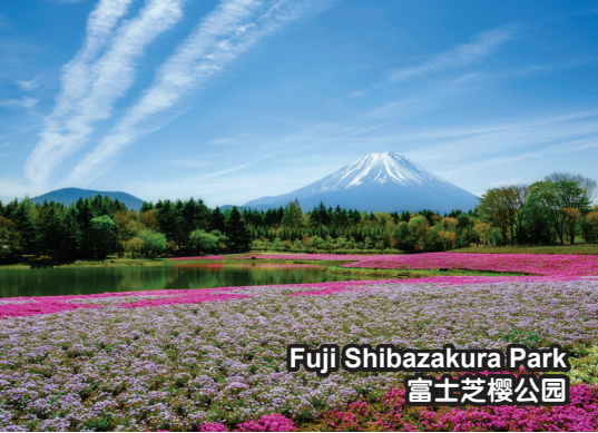
Fuji Shibazakura Park 富士芝櫻公園