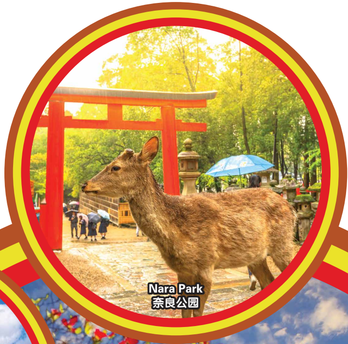
Nara Park 奈良公园