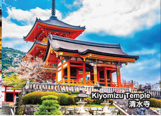
Kiyomizu Temple 清水寺