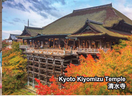
Kyoto Kiyomizu Temple 清水寺