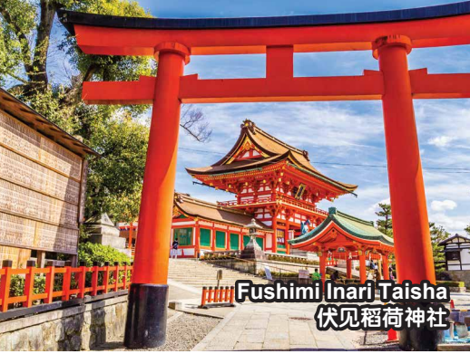
Fushimi Inari Taisha 伏见稻荷神社