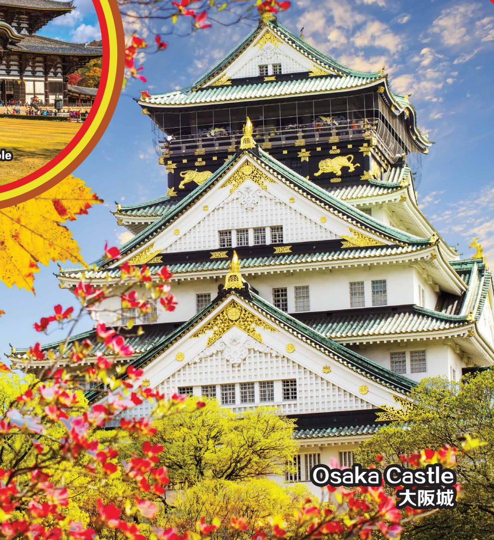
Osaka Castle 大阪城

行程次序, 以当地旅社安排为准。 Sequences of Itinerary are subject to local arrangement.