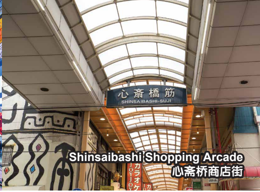
Shinsaibashi Shopping Arcade 心斋桥商店街