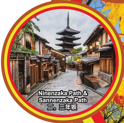
Ninenzaka Path & Sannenzaka Path 二, 三年坂