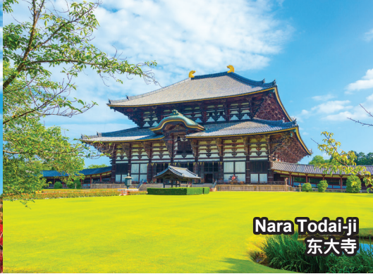
Nara Todai-ji 东大寺