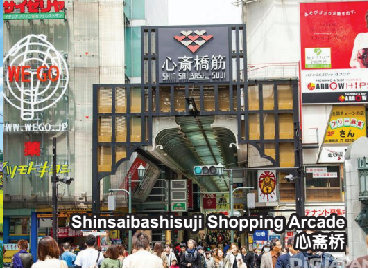
Shinsaibashisuji Shopping Arcade 心斋桥