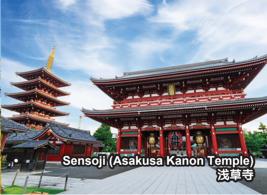
Sensoji (Asakusa Kanon Temple) 浅草寺