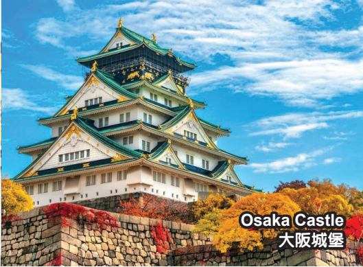
Osaka Castle 大阪城堡