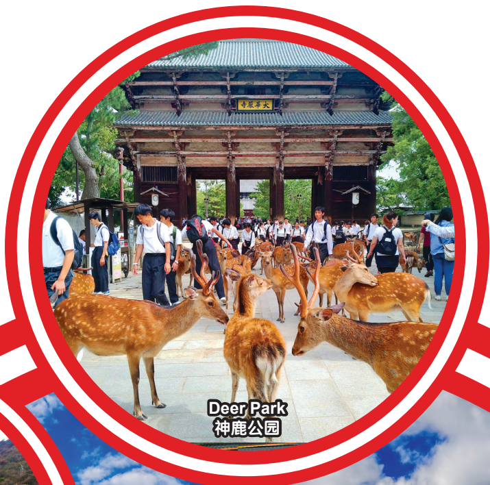
Deer Park 神鹿公园