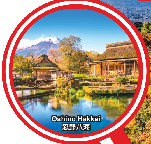
Oshino Hakkai 忍野八海