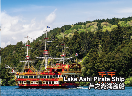
Lake Ashi Pirate Ship 芦之湖海盜船