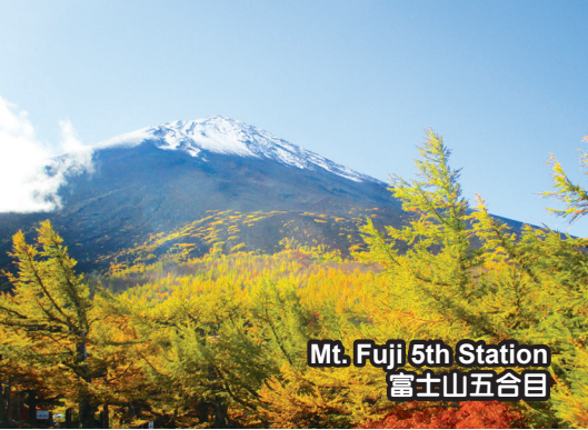
Mt. Fuji 5th Station 富士山五合目